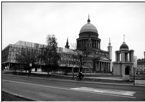
Fig. 6. The city centre was rebuilt in communist times, which destroyed its historical spatial structure: next to historical monuments new modernist buildings were constructed, of low architectural value

The ruins of the Royal Palace, which was destroyed during the carpet bombing in 1945, remained till 1961, when they were removed by the GDR communist government. In the 1970s, exactly in the place of the south-west corner of the former palace building, an out-scaled intersection of streets was constructed, which not only completely distorted the historical plan of the Old Market, but also annihilated social and cultural life in the most important central place of the city: the Old Market had always been the beloved, traditional place of meetings for inhabitants and visitors (figures 6–7).