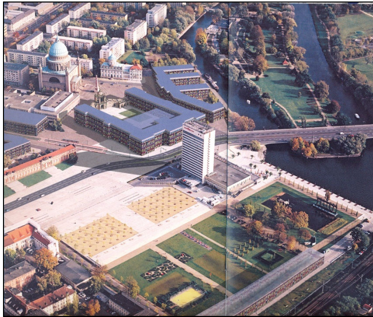
Fig. 8. The City Centre Revitalisation Area: visualisation of the new building of the State of Brandenburg Parliament, built in the place of the former Royal Palace. A new traffic solution for this area is also visible, including a new street going round the proposed Parliament building corner, the pedestrian zone near the city centre and green areas near the river bank, being a part of the former National Garden Exhibition

The first step towards the implementation of this idea was the reconstruction in 2002 of the historical Portal of Fortune (Sanierungsträger Potsdam, 2001b), the former main entrance to the Palace from the Old Market square.