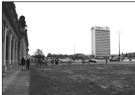
Fig. 7. The spatial composition of this part of the city was completely distorted by introduction of high-rise buildings and over-scaled intersection of streets