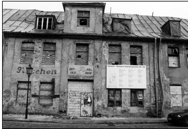
Fig. 1. Buildings in the historical centre of Potsdam at the beginning of the 1990s were mostly in a disastrous technical condition

During the last years, thanks to numerous revitalisation projects, many other historical monuments and places, too, were restored and gained new life, enriching the stock of valuable cultural heritage objects of the city: the Old Market Square ( Alte Markt ) and the New Market Square ( Neue Markt ), historical city gates and historical quarters – the Dutch Quarter ( Holländisches Viertel ) and the Baroque Quarter ( II. Barocke Stadterweiterung ).