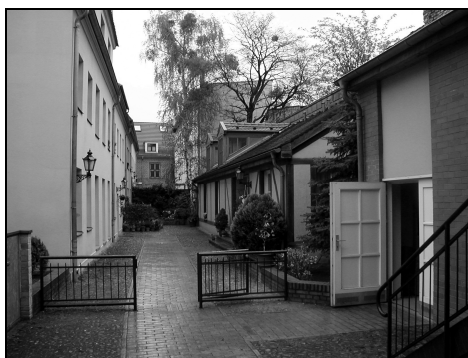
Fig. 5. Holländisches Viertel : in the interior of the blocks open spaces were created – public, semi-public and private, giving the feeling of intimacy in spite of living in the city centre