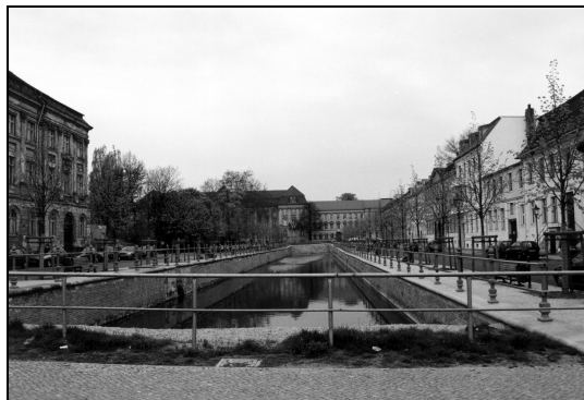
Fig. 10. One of the re-opened water canals – for the past few decades in this place was a transport artery leading heavy traffic

Water canals were important elements of the historical urban structure of Potsdam's central area. They constitute a characteristic feature of both the Baroque and the Dutch Districts. In 1722 King Frederic Wilhelm the First ordered the rebuilding of previous water trenches into Dutch style canals. After the Second World War they were decked and in this place new traffic arteries were constructed. It was decided, as part of the revitalisation programme, to have them re-opened, as an important element of the city's identity. The projects of that kind have recently been implemented in many European cities and towns whose origin and development were closely related to water. 3