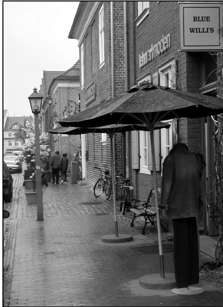
Fig. 3. Great care was taken – regarding the design, details, material, elements of small architecture and greenery – to upgrade both public spaces and private backyards