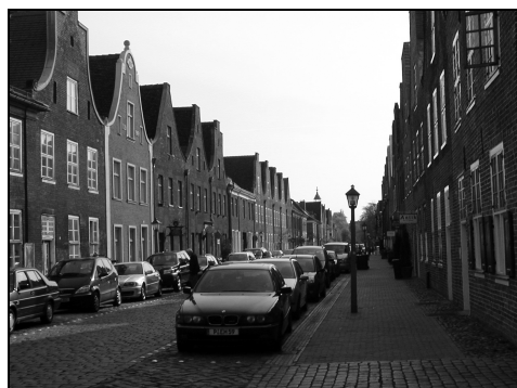
Fig. 4. Holländisches Viertel : the buildings seen from the street form a continuous row

The front walls of old buildings, adjacent to the street, were reconstructed with great care to restore their historical shape, but the inner spaces were reconstructed in an innovative way. Substandard elements of existing development like sheds, side-buildings and outbuildings were demolished, giving way to new arrangement of space – attractive recreation areas, playgrounds and green spaces were provided, as well as utility spaces for residents of adjoining buildings. At the back side of some of the buildings were built terraces and small gardens, offering a unique possibility of having private open space in the heart of the city (figures 3–5).