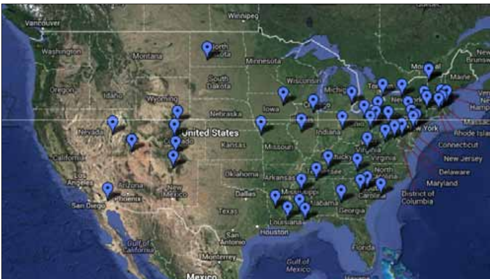
Fig. 1. Map of National Heritage Areas in the United States. Since the 1980s, forty four national heritage areas have been implemented for only ten new national parks

Also, management guidelines and projects are only made publicly available in exceptional cases (e.g., Casas, 2006). Not only there is a lack of interdisciplinary