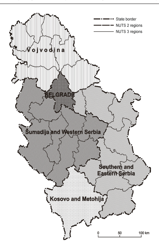
Fig. 1. NUTS 2 and NUTS 3 regions in Serbia, 2010

In Serbia the regional disparities are enormous even by European standards (Komšić, 2009, p. 76) which can exacerbate (Lilić, 2009, p. 17), or traditionally remain stable along a North-South axis (Nikolić, 2009, pp. 54–56). Comparing the levels of development of Serbian macroregions it can be stated that all have GDPs below the average EU GDP: Belgrade 50%, Vojvodina 37.1%, while Central-Serbia 21.1% of the EU average (according to 2005 data) (Nikolić, 2009, pp. 54–56). The ratio of regional disparities is 1:7 (districts – okrug ) and 1:15 (municipalities).