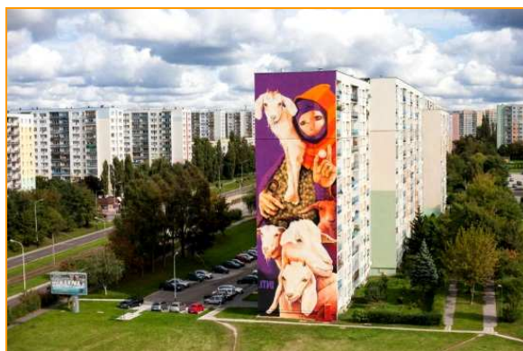
Photo 11. Mural at 80 Wyszyńskiego, Łódź

An interesting example of the creation of a new, attractive place in Łódź by an accumulation of murals is 3 & 12 Uniwersytecka St (Photo 9) and the mural in 59 Jaracza St situated close by. According to the opinion of local residents they are identified with each other and often mentioned together.