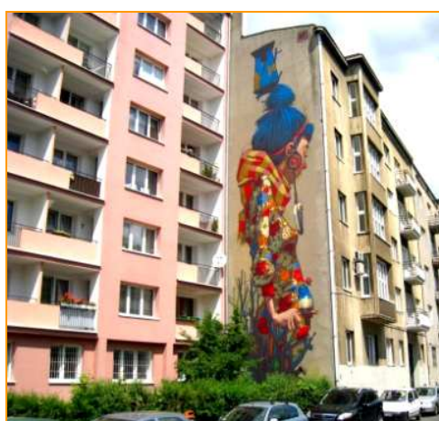
Photo 9. Mural at 12 Uniwersytecka St, Łódź