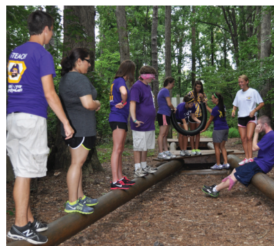
2012-2013 Freshmen Maynard Scholars work on team-building skills at the ECU Ropes Course.