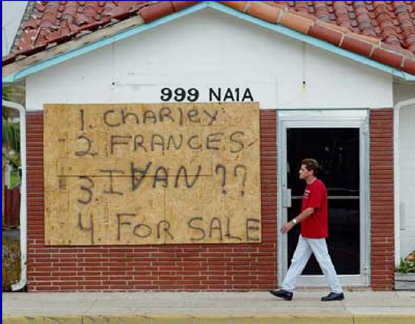
Hotel in Daytona Beach, FL (Sept.2004)