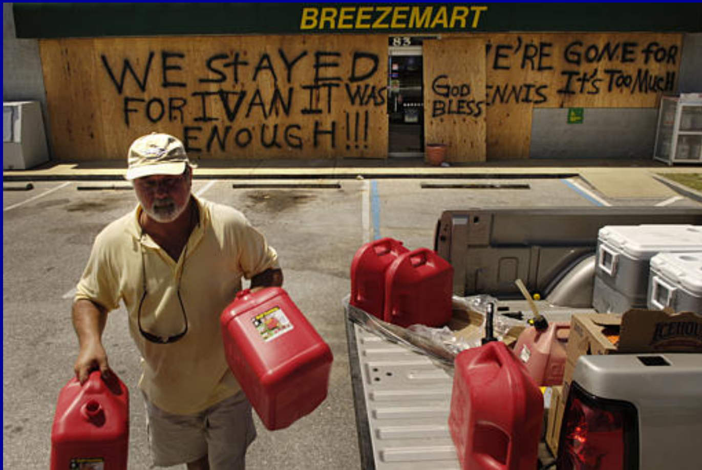
Convenience Store in Gulf Breeze (FL)