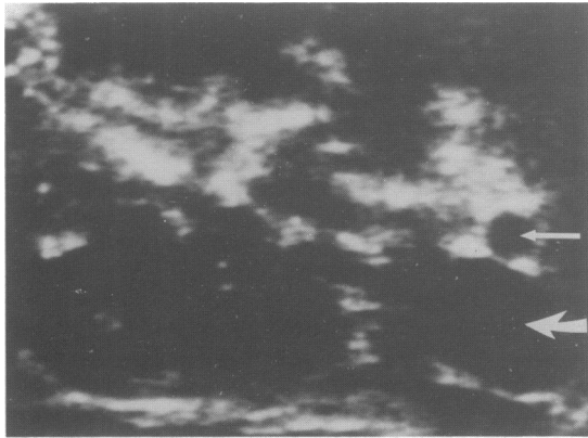
Fig 2 A transverse ultrasound study of the neck showing a mass consisting of multiple fluid filled spaces as evidenced by the lack of internal echoes, strong backwall, and increased through transmission of sound. There are solid elements within some of the fluid filled spaces. Thick arrow indicates jugular vein; thin arrow indicates carotid artery.

One week later the patient underwent a thoracotomy to debulk the remaining intrathoracic tumour. At surgery a large tumour posterior to the oesophagus was dissected from the superior vena cava, innominate artery and vein, as well as carotid and subclavian arteries. The tumour was found to extend into the vertebral foramina T4, T5, T6, and T8 and small remnants were left. The pathology of the tumour was similar to the previous biopsy specimen and showed a neuroblastoma with rare ganglionic differentiation.