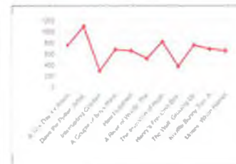
Lexile measures for Caldecott Medal and Honor Books above the level of Beginning Reader for the past five years, excluding poetry/plays