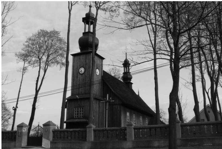
Fig. 6. St. Dorothy's &amp; St. John the Baptist's Church in Mileszki (Stoki)

If we were to measure the attractiveness of a church by the amount of marriages by couples from outside the parish, St. Dorothy's & St. John the Baptist's Church in Mileszki (fig. 6) would be the most attractive one in Łódź. It is a small, wooden, old church located away from the city turmoil. This phenomenon proves the attachment to tradition and a specific "romantic model" of sacral space. The other model can be called "monumental". Such image is reflected in answers to the question about the appearance of a church – large and spacious, modestly ornamented building.