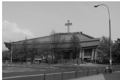
Fig. 5. The smallest and the largest newly built churches in Łódź - a. St. Michael the Archangel Church in Rysownicza Street, b. St. Maximilian Kolbe Church in Tatrzańska Street

Ryc. 5. Najmniejszy i największy nowowytbudowany kościół w Łodzi - a. pw. Świętego Michała Archanioła na Rysowniczej, b. pw. Św. Maksymiliana Marii Kolbego na Tatrzańskiej