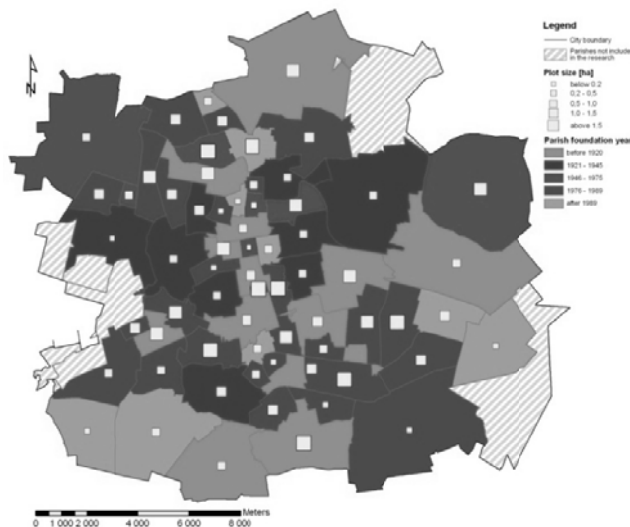
Fig. 4. Parishes' foundation date in relation to the size of land plots, where the churches are built

Plots of land, designated for sacral buildings, vary in their size – from 0.07 ha (The Good Shepherd parish in Pasterska Street) up to 2.93 ha (St. Vincent Pallotti parish in Łagiewnicka Street) – fig. 4. Overall, plots of land covered by churches add up to 50 ha, which is only 0.17% of the city's area.