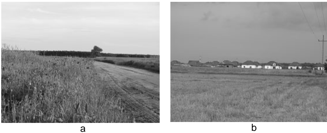
a b Fig. 1. Open space with a line of forest on the horizon (a); residential development interfering with open areas (b)