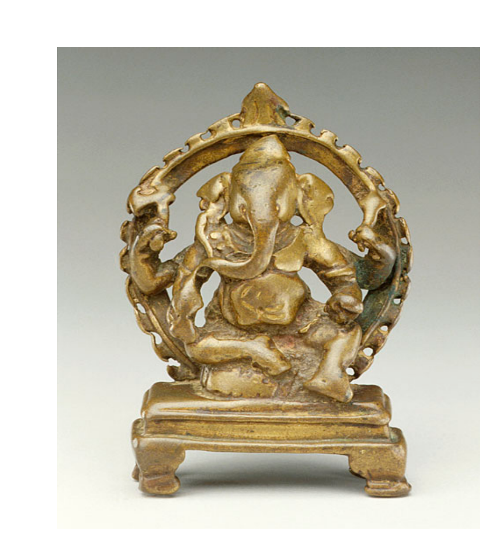
Ganesha, Lord of Obstacles, India, 10th-11th century Metal, Brass, 3 5/8 x 2 3/16 x 11/16 in.