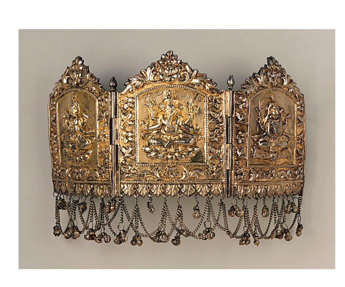
Bridegroom's Wedding Crown (umlak) Adorned with Vishnu, Ganesha, and Shiva, 19th century Metalwork, Repoussé silver with gilding, 6 3/8 x 10 3/8 in.