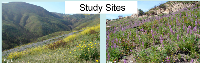
Fig. 6 & 7. Study sites at Corral Canyon in the Santa Monica Mountains of California. Location of wild fire in the year, 2007.