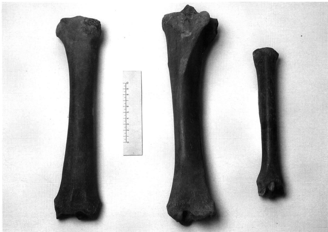
Fig. 3: Limb bones of Equus przewalskii from Kempen; from left to right: Radius dext., tibia sin., and metatarsale sin.

mandible from Seamer Carr (Yorkshire, England) the measurements P 2 -M 3 exhibit moderate differences (CLUTTON-BROCK & BURLEIGH 1991: 240). The premolars throughout are somewhat shorter, but on the contrary, the molars are of equal length (M 1 ) or slightly longer. All cheek teeth are significantly wider with exception of P 3 showing equal width.