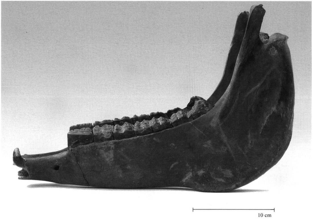
Fig. 2a: Lower jaw of Equus przewalskii from Kempen; lateral view of left mandible.