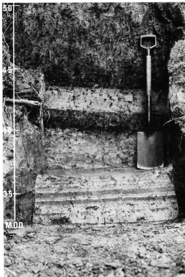
Fig. 3: Photograph of a cliff section showing the layer at Maryton, near site 8.

The scale shows altitudes above Ordnance Datum (O. D.). At the base of the section laminated Late Devensian clays reach 4.00 m., O. D.: above these lies peat at 4.00—4.15; the grey micaceous silty fine sand layer at 4.15—4.33; silty peat at 4.33—4.43; and grey silty clay ("case clay") at 4.43 to the surface at 6.80.