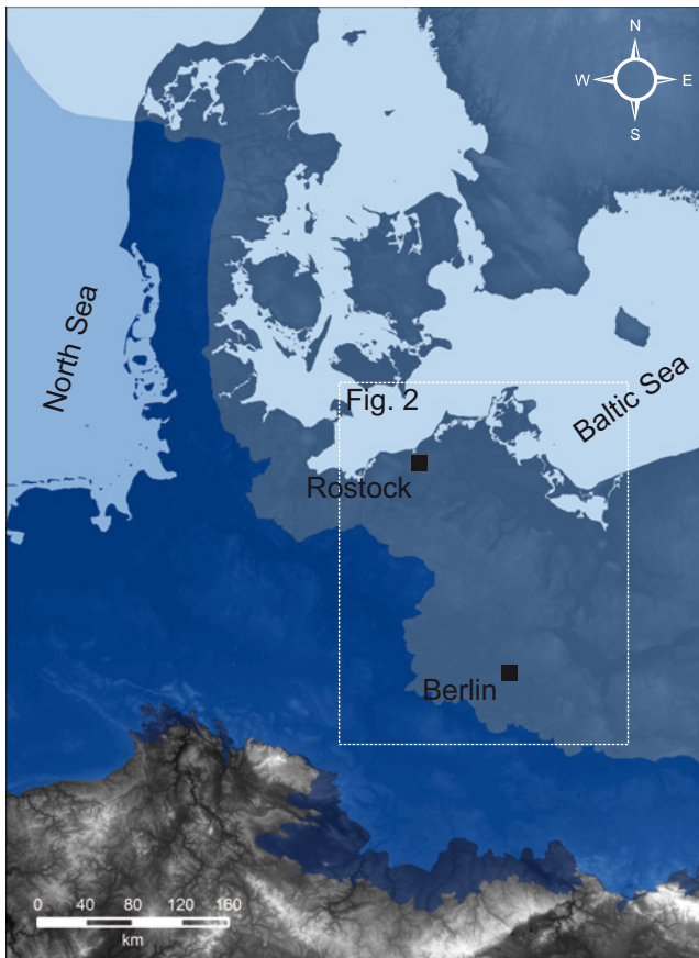
Fig. 1: Maximum extents (from south to north) of the Elsterian (dark blue), Saalian (blue) and Weichselian (light blue) glaciations in Germany and neighbouring areas (data provided by EHLERS & GIBBARD 2004). Figure based on a digital elevation model (DEM) derived from hole-filled seamless SRTM data (processed by JARVIS et al. 2006). (Figure modified from LÜTHGENS 2011).

Abb. 1: Maximalausdehnungen (von Süd nach Nord) des Elster-Glazials (dunkelblau), Saale-Glazials (blau) und des Weichsel-Glazials (hellblau) in Deutschland und benachbarten Gebieten (Daten bereitgestellt von EHLERS & GIBBARD 2004). Abbildung basiert auf einem digitalen Höhenmodell (DHM) abgeleitet aus SRTM Daten (prozessiert von JARVIS et al. 2006). (Abbildung verändert nach LÜTHGENS 2011).