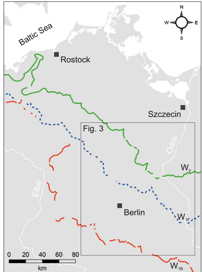
Fig. 2: North-eastern Germany and neighbouring areas of Denmark and Poland, selected cities, and major rivers. Main Weichselian ice marginal positions according to Liedtke (1981): W_{1B} – Brandenburg phase (red line), W_{1F} – Frankfurt recessional phase (dashed blue line), W_2 – Pomeranian phase (green line). (Figure modified from LÜTHGENS 2011).

positions (IMPs) which in general is still valid today. He assigned landforms south of the Glogów-Baruth ice marginal valley (IMV) to the penultimate glaciation and differentiated two phases for the formation of main ice marginal positions during the last glaciation. The “Jütische Phase” consists of the “Brandenburger Phase” and the “Posensche Subphase”. The “Pommersche Phase” follows to the north. This morphostratigraphical model already implied a first relative chronology with the southernmost IMP representing the oldest ice advance and a succession of younger IMPs northward towards the Baltic Sea basin (summarised in LÜTHGENS 2011). Apart from these three main IMPs a complex pattern of intermediary systems of recessional terminal moraines has been controversially discussed within scientific discourse (summarised in BÖSE 1994, 2005, LÜTHGENS & BÖSE 2010). Despite such conflicting interpretations on regional and local scales, the general pattern established by WOLDSTEDT (1925) was later confirmed by LIEDTKE (1975) who differentiates three main IMPs (Fig. 2): the Brandenburg ( W_{1B} ) IMP representing the southernmost extent of the Weichselian glaciation, the Frankfurt IMP