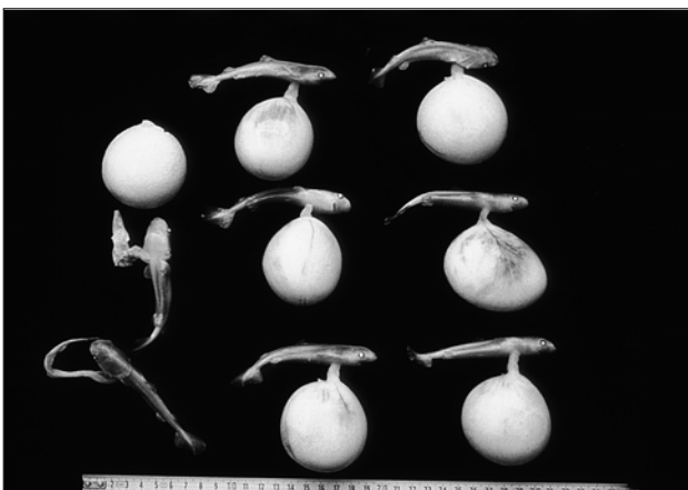
Figure 2. Embryos, with yolk sac

The specimen was caught in a trawler net, at a depth of 534 m, on the fishing ground know as La Serola, at 41° 01' N, 2° 16' E. Biometric data for the pregnant female (deposited in the Museu Cau del Tauró de l'Arboç, catalogue number MCTA-00243) are presented in table I. Two embryos were deposited in the Museu de Zoologia de Barcelona, one male (100 mm TL) with catalogue number MZB-2000-0058 and one female (105 mm TL), MZB-2000-0059. Six embryos were deposited in the Museu Cau del Tauró de l'Arboç: male (103 mm TL), MCTA-00244; male (99 mm TL), MCTA-00245; male (101 mm TL), MCTA-00247; male (95 mm TL), MCTA-00248); male (98 mm TL), MCTA-00249; female (100 mm TL), MCTA-00250.