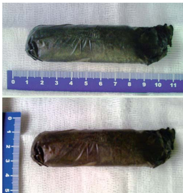
Fig. 2 Packet of hashish after removal.