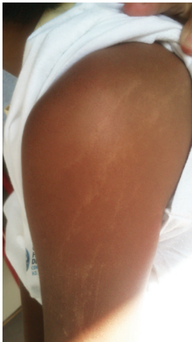
Figure 1. Hypopigmented macules in the upper limb following the lines of Blaschko