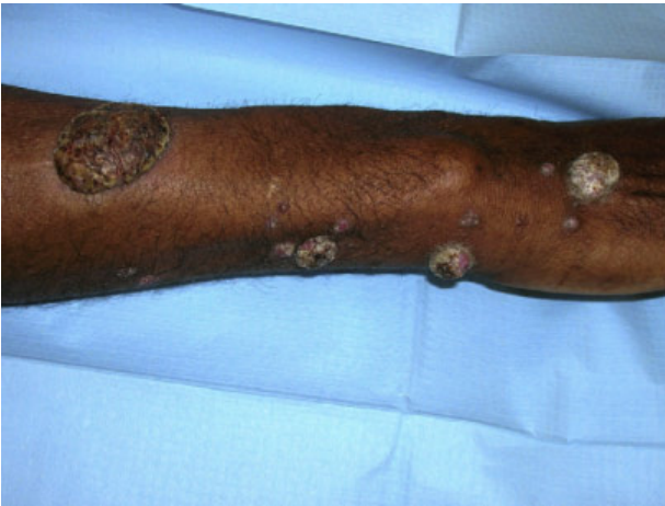
Figure 1. Widespread verrucous hyperkeratotic tumours.

of dematiaceous species associated with phaeohyphomycosis, resulting in a better understanding of these infections over the past decade.