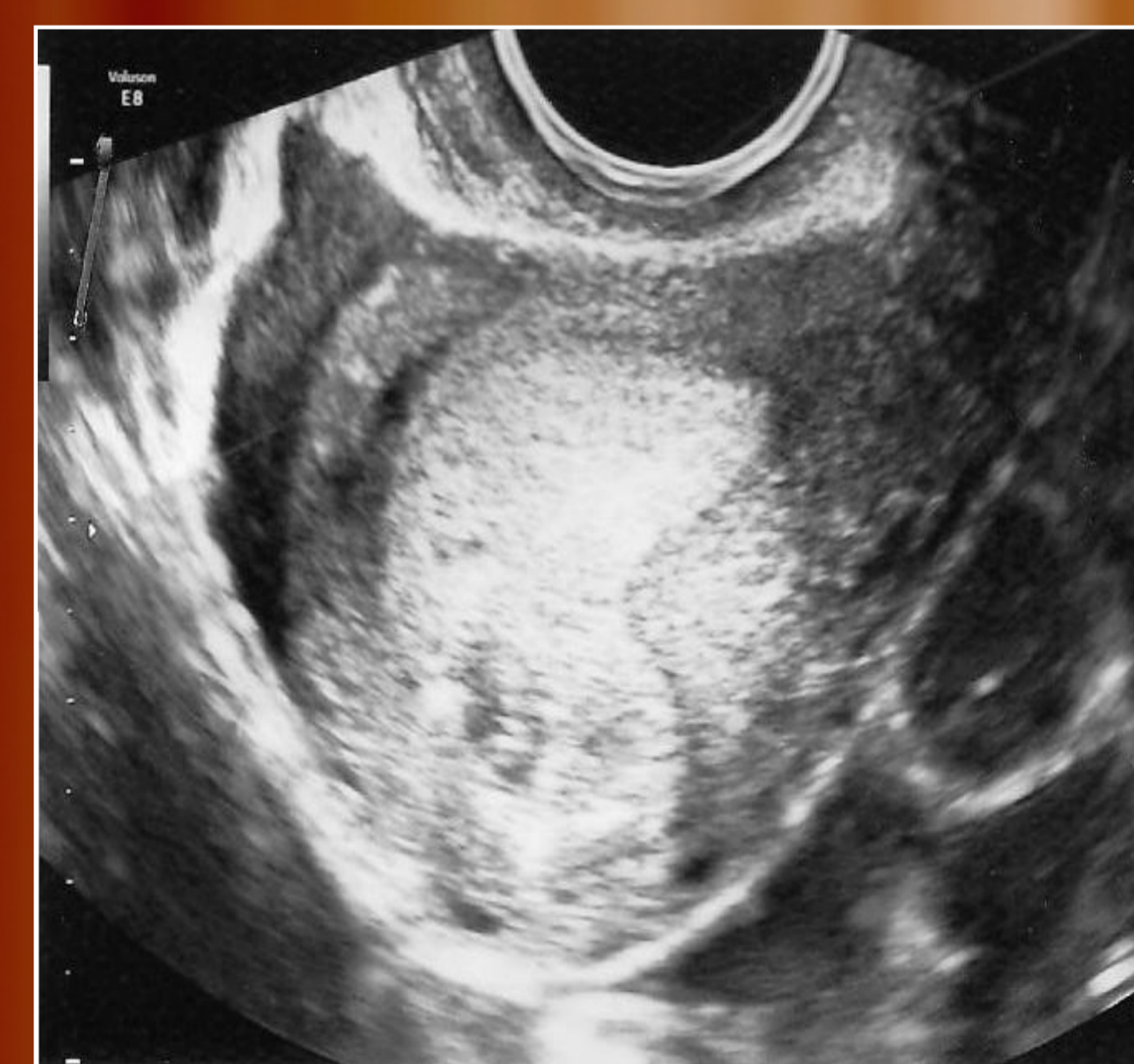
1- Pregnancy “ in utero ”

HP diagnosis was then established and the patient was admitted at the Obstetrics Ward for surveillance and ultrasonographic/laboratorial reassessment; complete miscarriage of the uterine pregnancy occurred but methotrexate was necessary for the treatment of persistent tubarian pregnancy.