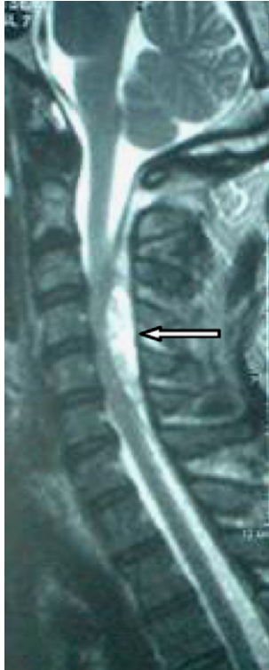
Fig. 2. Sagittal T2-weighted images showing an epidural haematoma between C3 and C6.

a chiropractic treatment was already the onset of the adverse event reported. A pragmatic approach recommends appraising these events as they happened independently of these limitations.