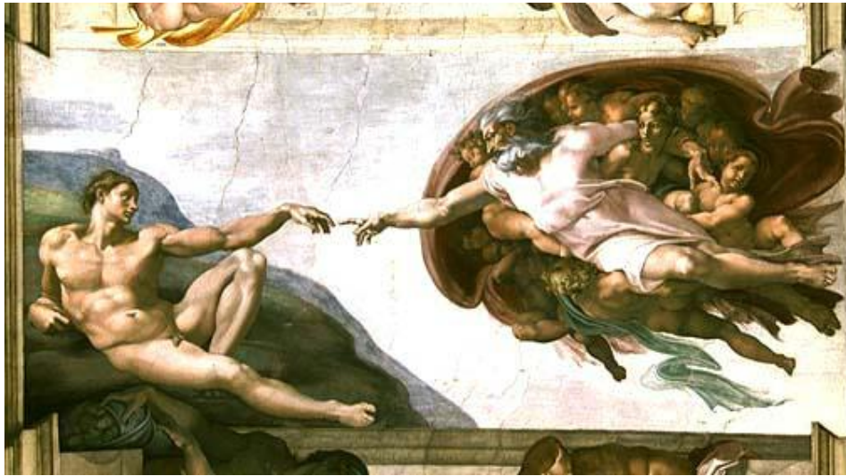
Figure 1: Michelangelo, The Creation of Man .

A spectre is haunting western academia ... the spectre of the Cartesian subject. All academic powers have entered into a holy alliance to exorcise this spectre.