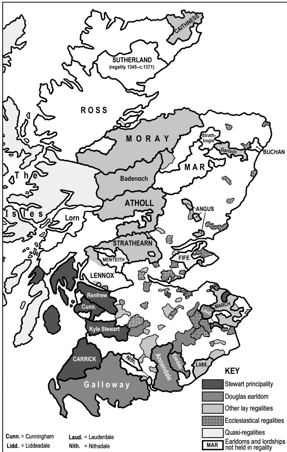
Map 2. Regalities, earldoms and lordships in early 15th-century Scotland