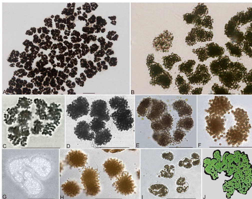
Figure 3 | Shapes and sizes of colonies of present-day Microcystis . (A, B): large tree-like; (C, D): medium irregular; (E): medium treelike; (F): medium circular; (G), medium embryo-like; (H): small subspherical, medium 8-shaped; (I): medium trilobate, embryo-like; (J): large irregular. Bars 0.1 mm in (A–I), and 1 mm in (J). (A) and (B) are cited from Fig. 7.2 of reference 29 ; (C, D, E, F, H) cited from reference 26 ; (I) cited from reference 27 ; (G) from reference 25 ; (J): taken in this study.

organisms associated with the microbialites. Our study shows 417 species of marine invertebrates in the crinoid limestone underlying the microbialites compared with 25 species in the microbialites, including ostracods, small gastropods, small worms, and tiny foraminifers.