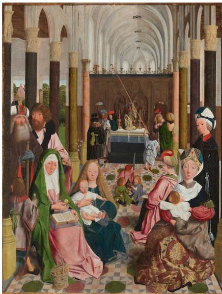
Fig. 1 Geertgen tot Sint Jans (or workshop), Holy Kinship , 1496, oil on oak, 137.2 x 105.8 cm. Rijksmuseum, Amsterdam, inv. no. SK-A-500 (artwork in the public domain)

Three children play at the center of the Amsterdam Holy Kinship , which is attributed to Geertgen tot Sint Jans or his workshop. This seemingly quotidian subject is remarkable because it shows future martyrs engaged in a game of make-believe using the implements of their torments. In this paper, I argue that the activity occupying the boys offers an invitation to spiritual play that addressed viewers and asked them to find joy in the promise of God's divine mercy and justice despite life's hardships. Given the subject matter and the identity of the artist's primary employer, it is probable that the audience included the Knights of St. John Hospitaller, an order of crusading monks, also known as the Johanniters, in Haarlem. The invitation offered in the panel not only addressed the daily work of being a monk but also offered encouragement to the Haarlem knights during a controversial period. DOI: 10.5092/jhna.2015.8.1.1