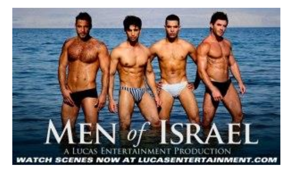
Figure 5.4 Lucas Entertainment, 2009

the amazing architecture and the embracing culture that allows its citizens to thrive" (Entertainment 2009). Lucas has devoted millions of dollars to promoting gay tourism in Israel (Blumenthal 2013); however, he is also a vehement Islamophobe who said: "I hate Muslims absolutely. It's a horrible, horrible religion. It's a plague" (Deger 2013, Party 2011). He is also a fervent supporter of Israeli airstrikes on Iran (Blumenthal 2013), and a vocal critic of gay and queer anti-occupation activists. In an interview in the rightwing U.S. magazine, FrontPage Magazine , Lucas stated: "I find it absolutely maddening that gay people, who are the number one target of Islam, are so ignorant of the facts....They are romanticizing the same Palestinians that hang gay people on cranes, but demonizing Israel, which is a safe haven for gay people" (Glazov 2011). Perhaps unsurprisingly given Lucas' political leanings, Men of Israel (which is Lucas' most promoted pornographic film) has a sex scene that was shot on the site of a former Palestinian village that was ethnically cleansed by Zionist militias in 1948 that he regularly takes tourists to visit (Blumenthal 2013). This type of rhetoric and these actions further promote Israel's pinkwashing strategies and encourage support from Western LGBTQ people and their allies.