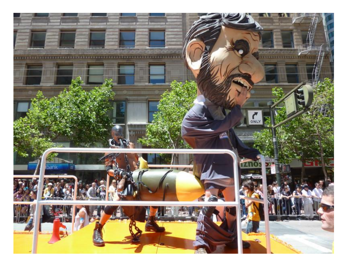
Figure 5.3 iran180, 2012

The Israeli government is far from alone in participating in this rebranding strategy. Michael Lucas, who is one of the world's wealthiest gay pornography producers, has been an extremely vocal advocate for Israel's supposedly gay-friendly culture. In 2009, he produced Men of Israel , the first gay pornographic movie that was shot on location with an all-Jewish cast (Figure 5.4). Lucas stated that he saw the film as "a bold move to promote Israeli culture and tourism" and as a counterbalance to the biased portrayals of Israel in the mainstream media (Kaminer 2009). On the film's website, Lucas stated: "The global media has created an image of Israel as a war-torn nation, which streets are lined with destroyed debris and crumbling ruins… Never are we shown Tel Aviv, Haifa, the Red Sea, the Dead Sea resorts, the beautiful beaches,