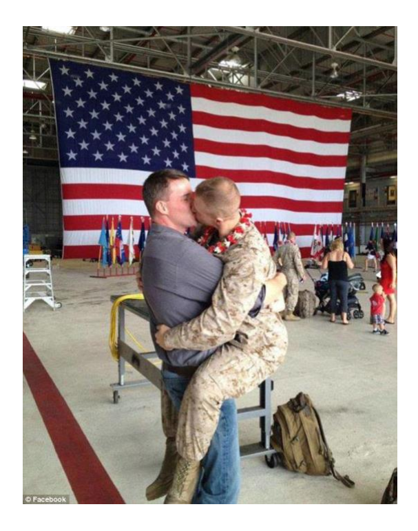
Figure 4.2 dailymail.co.uk, 29 February 2012