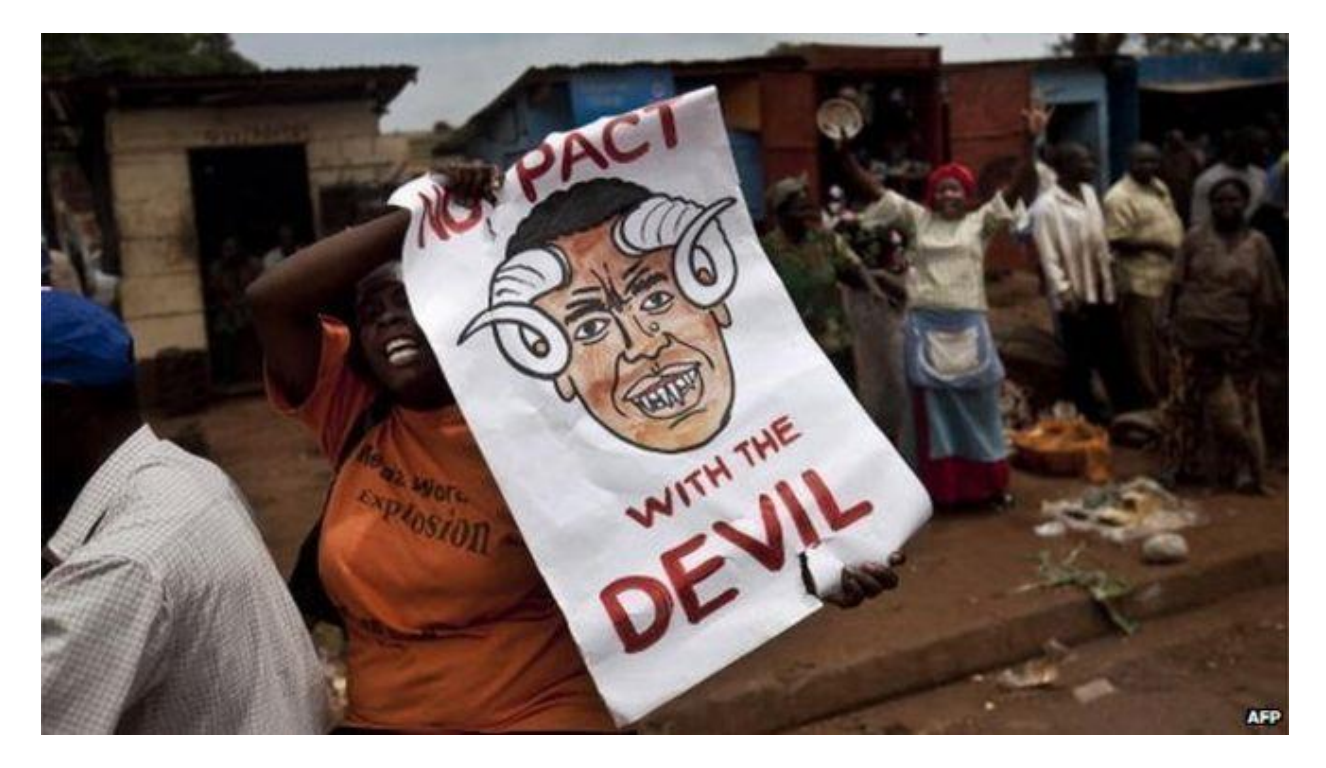
Figure 5.1 BBC, 10 November 2014

(Figure 5.1) (BBC 2014, Epstein 2014, Gettleman 2010, Keating 2014). To the public, the media set up a dichotomous association: Ugandan people and their culture are homophobic and barbaric in comparison to the gay-friendly and progressive West. Despite the fact that many Western countries, including the U.S., have rampant issues of homophobic violence and discrimination.