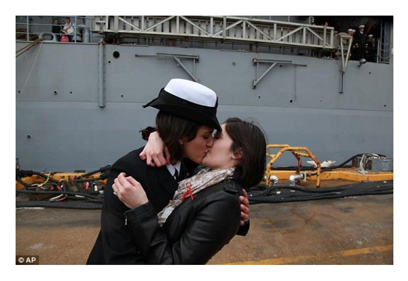
Figure 4.1 dailymail.co.uk, 23 December 2011

of the military. Instead of questioning the active recruitment of lesbians and gays into imperialist wars, we can celebrate their love. These couples can now be "defined only by their love, a love assumed to be untouched by the violence of the state" (Nair et al. 2012).