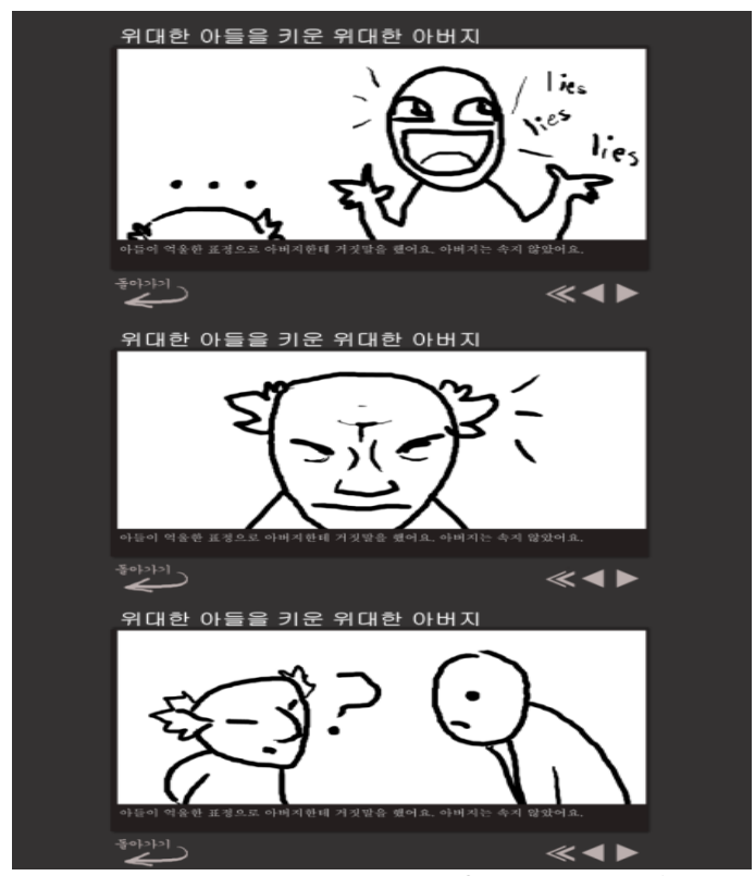
Figure 1. Linear representation of one animated scene from Jenny's multimodal reading response. The images from top to bottom changed for animation effects. The linguistic text on the top of the visual, "위대한 아들을 키운 위대한 아버지" [A great father who raised a great son], was the title of the story and the text below the visual is the linguistic explanation of the story, "아들이 억울한 표정으로 아버지한테 거짓말을 했어요. 아버지는 속지 않았어요" [The son lied to his father with a hurt face. The father was not deceived].

represented the content in more sophisticated ways using visual, a non-linguistic mode, I describe one scene from the movie in detail that included three animated images accompanying the linguistic text, "아들이 억울한 표정으로 아버지한테 거짓말을 했어요. 아버지는 속지 않았어요" [The son lied to his father with a hurt face. The father was not deceived]. See figure 1 below: