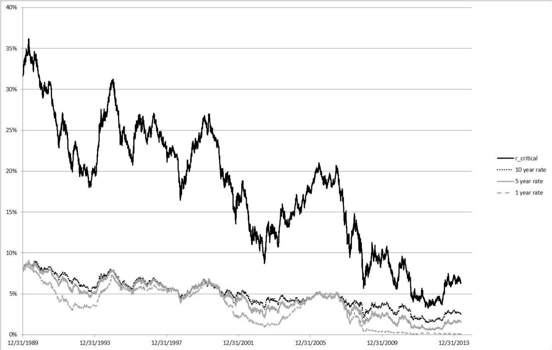
Figure 1. r_{crit} vs. time for r_{min} = 0