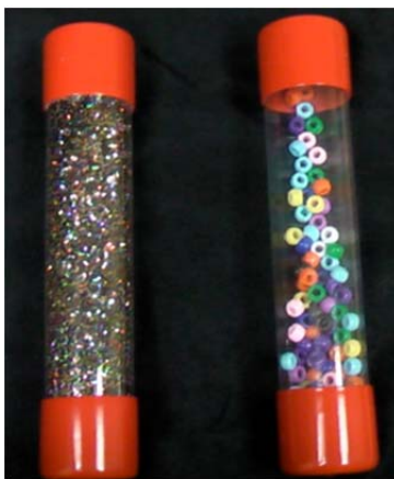
FIGURE 1. Sample of a quiet (glitter-filled) and a loud (bead-filled) objects used as stimuli in the experiment.

The experimenter first introduced one of the two objects of a loud/quiet pair. She drew the child's attention to it ("Look!"), shook the object, and asked the child, "Can you hear it?" She then removed the object from the child's view and introduced the second object of the pair in the same way. Children next were presented with a paired-comparison choice of the objects. After their choice, the children were given a 10-s period to manipulate the objects (with both objects available). Then, the experimenter introduced the second set using the same procedure.