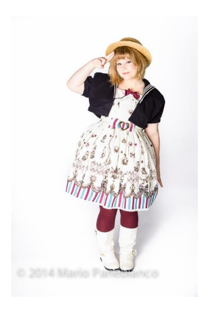
Figure 1.6.1 Country Lolita.