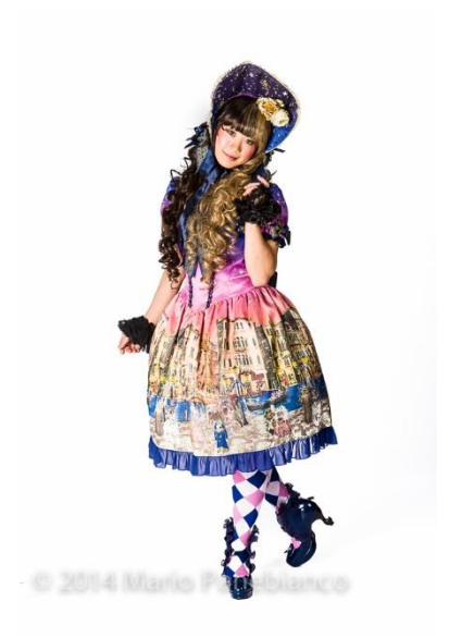
Figure 3.2.2 Bittersweet Lolita.