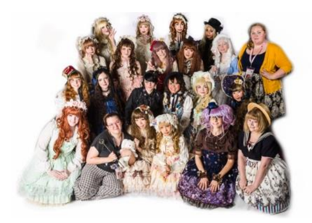
Figure 3.3.3 BTSSB Models, Designer, and AWA Fashion Track Crew.

Overall, the show was a complete success. It started on time, no models missed their cues, the emcee was flawless with her presentation, and the audience seemed very pleased by their excited applause. At the end of the show, all of the BTSSB models got together and took group photos with the designers before changing into their regular convention attire. There were also a few photos taken of the designers and the crew together, which was very exciting since I was able to participate. It was unfortunate, however, that there did not seem to be as much regard for the indie designers when it came to the photographs. They were often forgotten or told