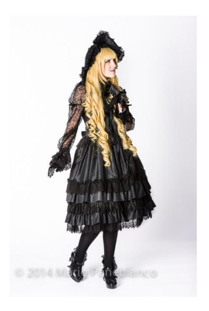
Figure 1.1.2 Kurololi.

The typical Lolita coordinate consists of a few basic elements. The base piece consists of a jumperskirt, one-piece dress, or skirt and blouse. The blouse, which is worn with a jumperskirt or skirt is often elaborate with multiple layers of lace or chiffon. A petticoat is worn in order to create the poof under the skirt and create the sought-after Lolitaesque silhouette. Lolitas also wear frilly bloomers underneath their dresses and petticoats to protect their modesty and to add to the frilliness of the dress. Typical legwear consists of tights, knee or thigh high socks, or short bobby socks. Traditional Lolita shoes are solid-colored with a chunky heal, multiple straps, and bows. Distinctive Lolita accessories include the long curly wig, headbow, heavy make-up, and multiple matching necklaces, rings, and bracelets. Though there is some variation in style and personal flair, this is the typical Lolita coordinate.