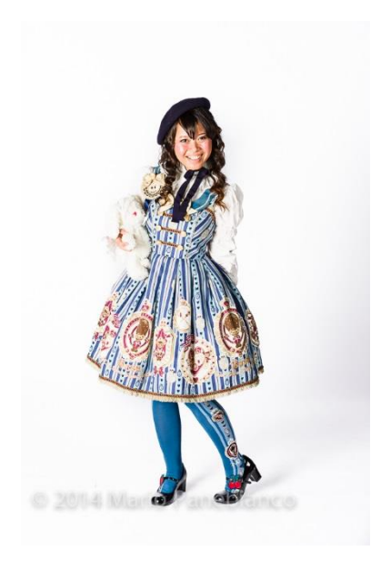
Figure 3.3.4 BTSSB Model at the AWA 2014 Fashion Show.

the lack of organization in the fashion show, and particularly the lack of concern for the indie brands, designers, and their models. The fashion show displayed an overt preference for brand clothing instead of indie clothing. This demonstrates that brand clothing is more accepted in the community, is more likely to contribute to the production of a positive impression, and is more likely to gain a member more social and symbolic capital in the community.