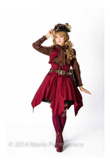
Figure 3.3.1 BTSSB Model in the AWA 2014 Fashion Show.

I arrived at the convention center bright and early at 8:00am to help prepare for the fashion show. When I arrived, the models were eagerly waiting to have their hair and makeup done before they had to get dressed. At first, I stood there awkwardly without direction. I was soon directed to steam each and every piece of BTSSB clothing before the models arrived to get dressed. It was very important to the BTSSB designer and her crew that the clothes looked pristine while onstage. After an hour of steaming all of the outfits, models entered back stage from the