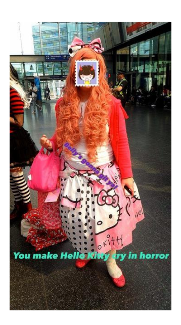
Figure 2.4.3 Example #3 of an Anonymous Post on Behind the Bows<sup>11</sup>

Atlanta Lolita and Japanese Street Fashion Community and their fear of policing on anonymous forums. The anonymous posters on these internet forums such as BtB and 4chan act as the guards in the panopticon, and the community members are the prisoners. The community itself is a panopticon. Members are constantly fearful of being punished, therefore they choose to practice endless impression management and are always on their best behavior for fear of being posted to anonymous forums.