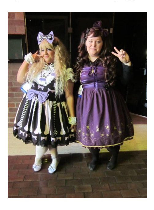
Figure 1.2.6 Lolitas at the AWA 2013 Putumayo Tea Party.

Photographs are also evidence that things actually happened, particularly events and travels (Sontag 1977:5). When a person leaves home to go on vacation, for example, friends and family expect to see photographs. These photos act as proof that an individual traveled to the place that they claimed to (Sontag 1977:9). The same thing applies to events.