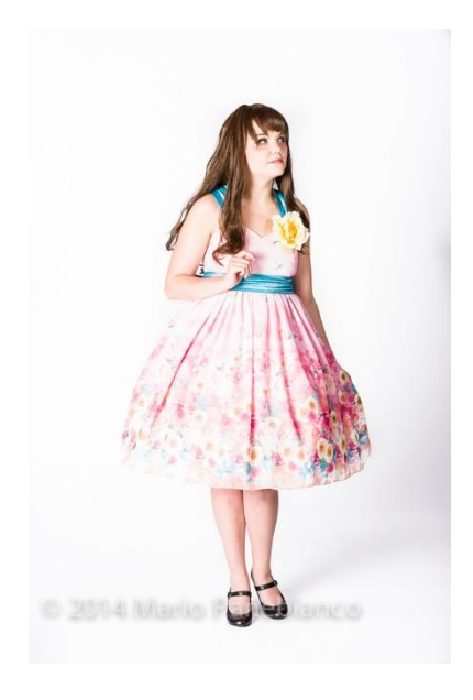
Figure 1.3.2 Sweet Lolita.

Because the Lolita Fashion subculture is extremely visual in nature, Utilizing photography as a research method is a great way to learn about the community. Photography is a form of artistic expression and visual means of presenting social research (Byers 1964:79). They embody the personal concerns of the photographer (in this case, Lolita fashion) and become records that reproduce reality (Schwartz 1989:120). The photographs that I have utilized are meant to provide a realistic illustration of