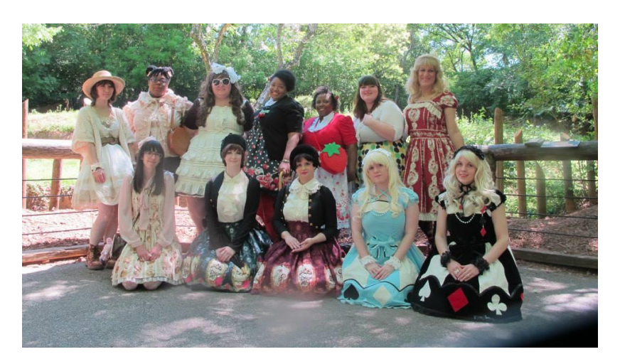
Figure 4.1.2 Zoo Meet-up.

My twin and I waited eagerly at the gates of the zoo for the other Lolitas and their "twins" to arrive. Once all of the other members arrived, we entered the facility on this crowded Saturday and began to plan our route around the park. We decided to go visit the giraffes first. As we walked throughout the park, multiple people asked to take photographs with us. Naturally, the members and I happily agreed. Many people in the crowd were interested in our clothing and asked us what it was called and why we wear it. Again, the members answered with smiles on their faces and explained in detail the origins of Lolita fashion and the purpose of the Atlanta Lolita and Japanese Street Fashion Community. The children that were visiting the zoo that day found our clothing particularly fascinating. At one instance while looking at the bears, I overheard a little girl, probably not older than five, say to her father, "Daddy, why do the pretty dolls keep following us everywhere"? It was at this point that I realized we were much more of an attraction than the zoo animals that day.