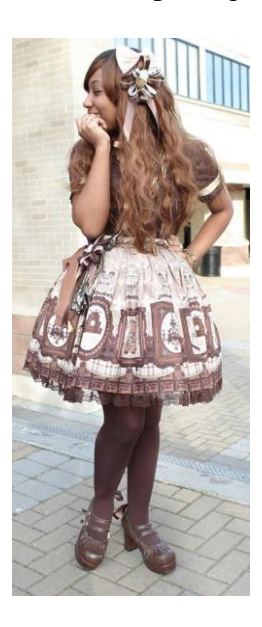
Figure 4.2.1 A Lolita posing for a photo at the Atlanta Lolita Formal Tea Party.

Lolitas take an abundance of photographs of themselves, either during events, with friends, or by themselves at home. These photographs show the effort that the Lolita made in putting together a particular coordinate. The more photographs a member takes and the more