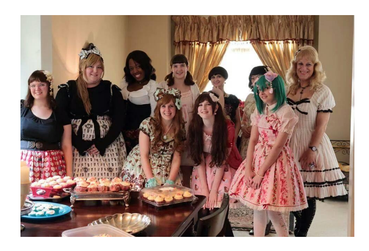
Figure 2.3.2 Cupcake Meet-up.