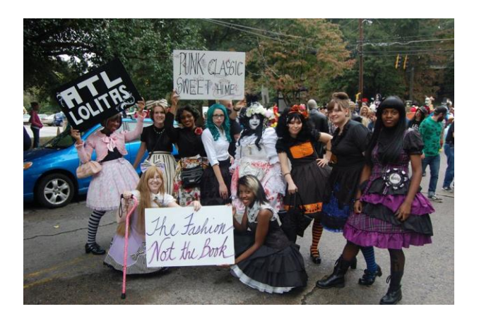
Figure 2.3.1 Going in for The Kill in Frill's Meet-up.

displaying their fashions, again, often with signs that indicate the community name and disassociation with Nabokov's Book, Lolita (Nabokov 1955).