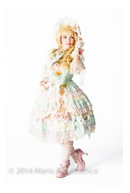
Figure 1.2.1 Sweet Lolita.

Impression management is concerned primarily with the expressions given off and how others perceive them (Goffman 1959:3-4). Impression management is a performance of an outer self, similar to acting out a character in a play. Performers of impression management are playing characters who avoid displaying their backstage view. Lolitas manage their impression that they give off very carefully through means such as photography, fashion, and their presence on the internet. The backstage often includes the inner self, glimpses of home life, or unflattering characteristics that individuals wish to keep private or secret from the audience (Goffman 1959:11). In contrast, the 'frontstage' view, also known as a 'front', refers to all activity of an individual that occurs while actively managing the impression (Goffman 1959:22). Lolitas carefully monitor themselves to ensure outward display of elegance, fantastic gallantry, sweetness, virtuosity, and brilliance that is necessary of a 'proper' Lolita. Lolitas often aim to hide this backstage view from other community members in order to maintain their impression.