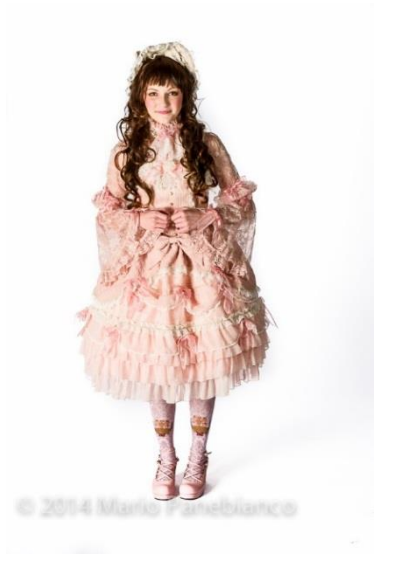
Figure 4.3.4 Sweet Lolita.

The Lolitas will prepare their most attractive coordinates weeks or months in advance for a large event or meet-up in order to prepare for photos to be taken. My interview subjects were very clear in that they planned coordinates with the knowledge that their photos would be taken and uploaded onto Facebook or another social media site. Knowing that their photos will be taken and uploaded onto Facebook puts added pressure onto the Lolitas to make successful and aesthetically pleasing clothing and accessory choices. One interviewee stated that when she does not have many photos taken of her at events, she feels as though she did not have a successful coordinate and many people did not like her choice of clothing and accessories that day.