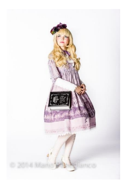
Figure 3.1.3 Sweet Lolita.

the chapter are designed to enhance the Lolita aesthetic in one way or another, though some Lolitas argue that they are necessary. However, in order for a coordinate to be considered "Lolita", one must be wearing a Lolita-style jumperskirt, OP, or skirt. Of the three, jumperskirts are by far the most common. A jumperskirt is a dress with sleeveless sholderstraps. Jumperskirts, along with OPs often have shirring in the back which allows for the garment to fit multiple bust sizes. They also commonly have waist ties which help form a slimmer-looking waistline and to form a pretty bow in the back.