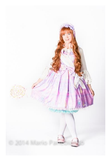
Figure 1.2.3 Infantilized Sweet Lolita.

way of making a statement through small expressive acts, often times with clothing, body modification, gestures, or other acts of deviance.