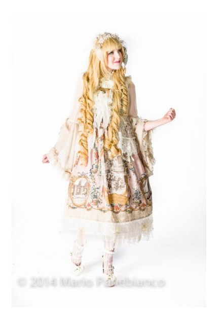
Figure 1.2.5 Classic Lolita/Mori Girl Fashion.

Aside from the development of fashion trends, fashion also flows from class-to-class and culture-to-culture in various ways. Theories such as the 'trickle-down', 'trickle-across', and 'trickle-up' have been developed to describe the different directions of fashion flow from one group to another. Lolita fashion has experienced three types of fashion diffusion since the 1980s. The fashion was originally influenced by French high fashion (trickle-down) and now has become reinvented as a popular street fashion and often influences high fashion (trickle-up). It is consumed by both upper and lower classes, replicated and reinvented, and influenced by global media and communication (trickle-across). Popular trends, subculture fashions, and haute couture all develop and spread in different ways. As a result, the vast world of fashion has led to unique origin theories that have framed 20th Century fashion studies. These include the Fashion Systems Model and the Populist Model (Delong n.d.:1).