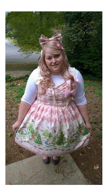
Figure 1.3.1 Author in Sweet Lolita Coordinate.

replica shops, social media-based trading, and Facebook GOs (group orders) are the main methods of shopping for Lolita fashion.