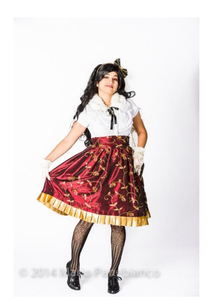
Figure 1.2.2 Classic Lolita.

unconformity (Schlenker and Weigold 1990:820). In contrast, the 'autonomous identity hypothesis' refers to those who prefer to create an identity of being autonomous, independent, and forthright. These individuals closely and actively control and monitor their impressions given off in order to maintain an autonomous identity, both to the audience, and to themselves. These individuals aim to please their audience and construct a positive image for display (Schlenker and Weigold 1990:821). They are concerned with what is "in" and popular at the time. The impression management process that these individuals undergo is most likely to positively influence their position in society, gain or maintain a popular status, or gain social capital (Schlekner and Weigold 1990:820 and 824). Of these two alternative hypotheses, the 'autonomous identity hypothesis' seems to be much more common today due to the rise of communication technologies and social media. This hypothesis is also far more relevant to the Lolita fashion community.