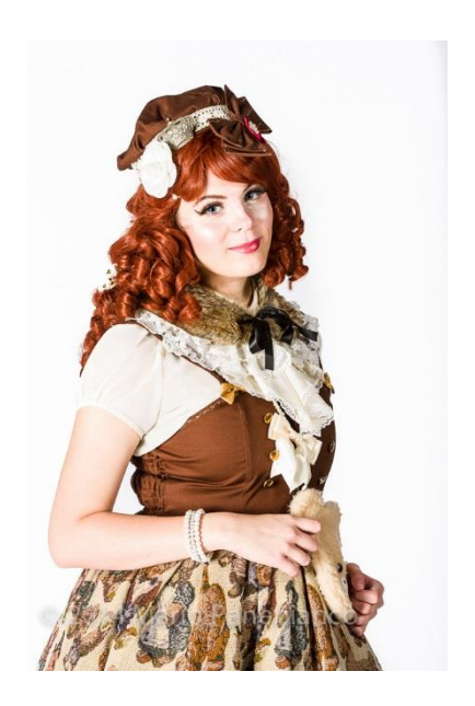
Figure 1.2.4 Over-the-Top (OTT) Classic Lolita.

individual and collective. Aside from being used as a method of self-expression, a person's fashion communicates one's economic and social class, personality, sexual preference, character, political position, etc. to others around them (Finkelstein 1999:376; Kuruc 2008:198). Subculture groups and larger social groups communicate their collective identity to others through fashion (Barnard 1996: 56).