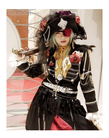
Figure 2.1.1 Visual Kei Inspired Pirate Kodona<sup>4</sup>

conforming society (Kawamura 2012:4;7-11). Teens in Japan began to adopt more personalized styles of Lolita fashion, resulting in the creation of multiple styles and sub-styles of Lolita dress (Kawamura 2012:70-73). Other subcultures that emerged in Japan include gyaru and its multiple variations in Shibuya (ganguro, yamamba, mamba, and bamba), cosplay and anime/manga-related fashions in Akihabara, and mori girl in Kouenji (Kawamura 2012:41-47).