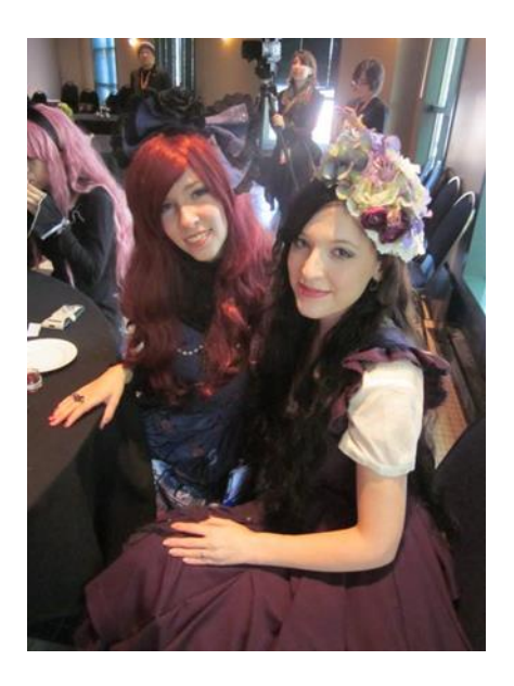
Figure 4.3.1 Lolitas posing for a photo before the tea begins.

the multi-talented Ambassador of Cute, Misako Aoki!"<sup>16</sup>. I was able to attend this tea party after paying for a fifty dollar ticket and purchasing a Putumayo brand accessory (a rule of admittance). The tea was limited to the first fifty people to purchase tickets.