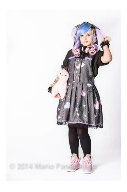
Figure 3.3.5 Indie Brand Model at the AWA 2014 Fashion Show.

In conclusion, the clothing and accessories are what first and foremost connects Lolitas. The beautiful clothing and accessories are what initially draws members to the community. Lolitas choose these elements in order to create and manage their impression and their 'frontstage' (Goffman 1959:22), which either contributes to or detracts from their impression management. Lolitas must avoid general sources of embarrassment in their coordinates in order to add to the character and help protect their 'backstage self'. Lolitas must be in character at all times and be able to recover at a moment's notice if they are caught off guard or make a mistake in the performance (Goffman 1959:210). The process of Lolita online shopping is very involved and time consuming, encompassing various shopping methods including Facebook buying, selling, and trading, indie and replica shopping, and the brand shopping experience. The utilization of these different shopping methods can increase or reduce the impression that other members have of a Lolita, which then influences his or her prestige in the community.