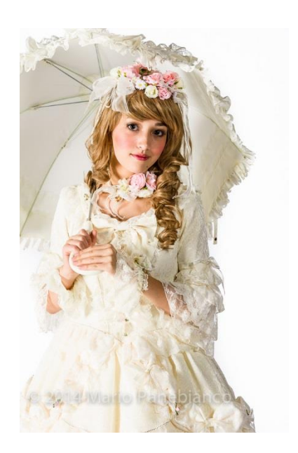
Figure 1.1.1 Shirololi.

early 1950s. Shōjo manga shifted from a demographic of young girls to a much wider and older audience in the 1970s (Hori 2013). Lolita clothing style was not worn as a fashion until the early 1970s when only kurololi (all black Lolita style clothing) and shirololi (all white Lolita style clothing) were worn. It was not until the early 1990s that Lolita fashion became much more individualistic and popular among the youth in Japan. Young teens in Japan began to adopt more personalized styles of Lolita fashion, resulting in the creation of multiple styles and sub-styles of Lolita dress.