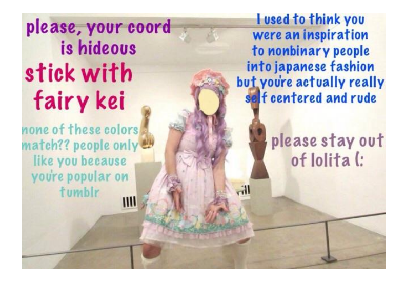
Figure 2.4.1 Example #1 of an Anonymous Post on Behind the Bows<sup>8</sup>

Like CGL on 4chan, "Behind the Bows" (BtB) is an anonymous forum. However, unlike CGL, BtB is housed on LiveJournal and submissions ("secrets") are collected throughout the week and posted by the moderators every Saturday night or early Sunday morning. BtB has rigid rules on secret submissions unlike CGL. Images cannot surpass 640X640 pixels in size, images