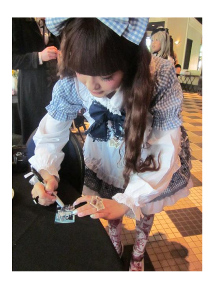
Figure 4.3.3 Misako Aoki signing printed photographs.

were taking pictures with wind-up disposable cameras or using their cell phones. I observed a few Lolitas who had brought their own travel-sized digital photo printers so that they could take photos of themselves with Misako Aoki and Shunsuke Hasegawa and then have them sign the physical photograph. When the hosts arrived at my table, the Lolitas surrounded them giddily, asking for autographs and photos together. There were also group photographs of each table's occupants and the hosts. After the hosts visited each of the fifty Lolitas and the tea party was nearing an end, a few last group photos were taken and the representative from Harajuku Hearts gave her closing statements and thanked the hosts for a lovely party.