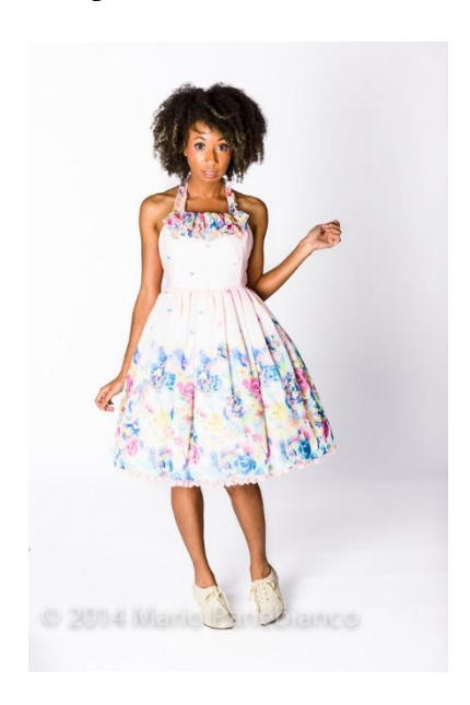
Figure 2.1.2 Casual Sweet Lolita.

street fashions through the internet or through friends. Though members of the Atlanta Lolita and Japanese Street Fashion Community have many different stories on how they became interested in the fashion (i.e. Victorian dolls, pixel art, desire for an alternative fashion community, etc.), this phenomenon is the greatest contributor to the rise in popularity of Lolita fashion in Atlanta. Unlike the Japanese parasite-singles who rely on their parents for money and to help maintain their shopping habits, American Lolitas are much more independent. The majority of the Lolitas in the Atlanta Lolita and Japanese Street Fashion Community are working students or degree-holding workers. There are some members who are in high school, do not work, and rely on their parents to support their Lolita fashion purchases, but this is certainly not the norm.