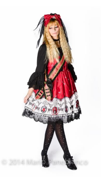
Figure 3.3.2 Indie Brand Model in the AWA 2014 Fashion Show.

Aside from the brand-indie brand rift backstage, the fashion show itself went very well. The entire show lasted roughly an hour. First, the indie models went on stage. Each indie designer was introduced and the emcee for the event provided the audience with a bit of information about the designer and their clothing line. The music was loud and cheerful and added to the atmosphere very well since the majority of the indie-brands were sweet Lolita style. After each of the indie models finished their walks, there was noticeable shift in atmosphere when it was time to present the BTSSB models. The light in the room got much dimmer and the