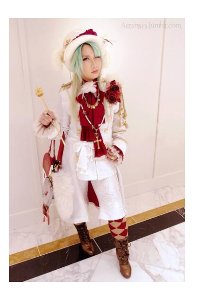
Figure 1.1.3 Ōji/Kodona<sup>1</sup>

'Ōji' (or Kodona, a more western term), the masculine form of Lolita fashion, also known as shounen-kei or boystyle. Other sub-styles of Lolita include bittersweet Lolita (a combination of elegant gothic Lolita and sweet Lolita), sailor style, hime Lolita (princess style), country Lolita, aristocrat (a more mature version of classic Lolita style), Guro Lolita (gore), punk style, wa Lolita (traditional Japanese look), OTT Lolita (over-the-top Lolita), shirololi (all white), and kurololi (all black). All of these Lolita fashion styles can be worn by both men and women. However, when a man wears traditionally female Lolita clothing, he is considered to be a "brolita".