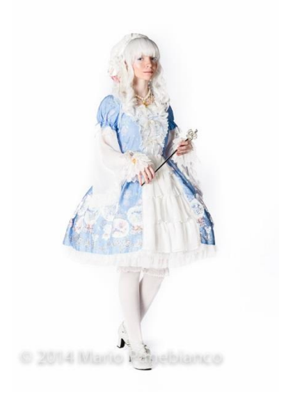
Figure 3.1.1 Classic Sweet Lolita.

Members of Atlanta Lolita and Japanese Street Fashion Community are first and foremost connected through a mutual interest in Lolita fashion. The beautiful clothing and accessories are what initially draws members to the community. In this chapter, I argue that Lolitas choose specific clothing and accessories in order to create and manage their impression. I examine the different visuals of Lolita fashion and explain the use of each of the major pieces in a typical Lolita coordinate and how these either contribute to or detract from one's impression management. I continue with a section on cosplay fashions and discuss the Lolitas' general