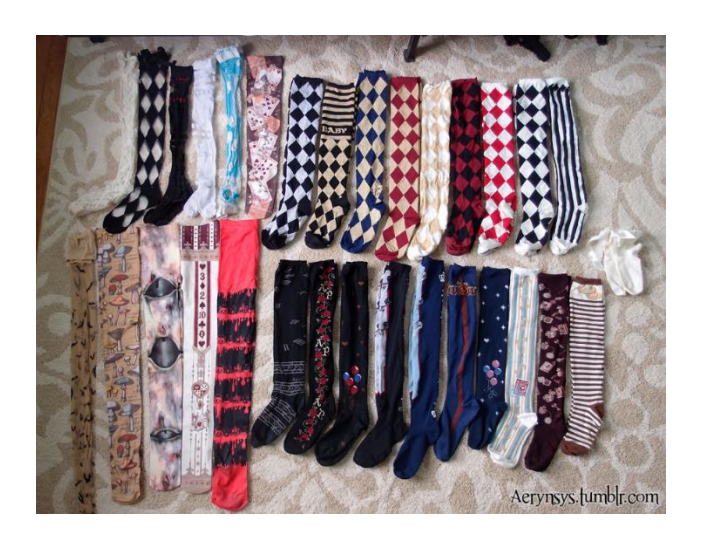
Figure 3.1.4 Wardrobe Post of Socks and Tights<sup>12</sup>

Lolita. In addition to tights and over-the-knee socks, some Lolitas wear short ankle-high socks (bobby socks) with their coordinates. These socks are much less common, most likely due to the fact that they are often referred to as "sissy socks" by some members of the community. They are generally frowned upon because they are commonly worn by both babies, and adult age-players (adults who dress as a different age, either younger or older, often interacting in sexual activity). Again, here is another example of Lolitas trying to distance themselves from Nabokov's book. Amanda claimed that she would never be seen wearing sissy socks. She will only wear full-length tights because she believes anything else looks too child-like. She also stated that the girls who wear short socks (and sometimes knee-high socks) often get mocked by others on BtB or get teased behind their back.