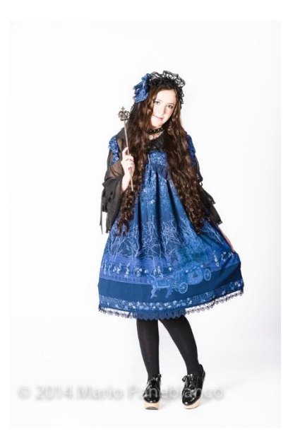
Figure 3.1.2 Gothic Lolita.

Members of the Lolita subculture utilize fashion to express themselves and to communicate with their fellow community members. Subculture groups and larger social groups communicate their collective identity to others through fashion (Barnard 1996: 56). Fashion is an effective tool of communication between and within different culture groups, most often providing information about a specific person or group. Fashion is both individual and collective. There are a few basic Lolita fashion elements that allow members to identify with each other. Aside from being used as a method of self-expression, the elements that a member chooses to wear and how they choose to elaborate on them communicates their economic status and social class, personality, sexual preference, character, political position, etc. to others around them (Finkelstein 1999:376; Kuruc 2008:198). These typical Lolita pieces include the jumperskirt, one piece dress (OP), or skirt, the petticoat, the headbow or headdress, socks or tights, blouse, shoes, and wig. Each of these elements has a purpose. The jumperskirt, OP, or skirt is clearly the most important element of the coordinate. Without the base piece, all other elements seem pointless. All other elements that I list later in