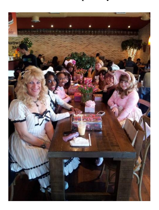
Figure 4.1.1 Valentine's Day Meet-up at the White Windmill Bakery and Café.

restaurant or café, shopping venue, public event, or festival. On occasion, bystanders will approach the crowd of Lolitas and ask if they can take their picture or have their picture taken with the group. In these instances, the members are usually happy to oblige. Lolitas will enthusiastically strike a pose and smile for the camera. Also during these events, it is quite common that non-Lolita observers become interested in the clothing and secretly snap photos with their phones. Some of the Lolitas that I have met do not mind that their photos are being taken without their permission. However, the majority of the community members find this action to be unacceptable and a violation of their privacy.