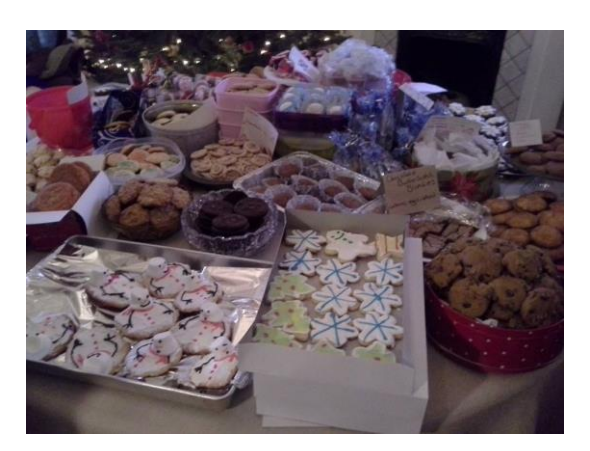
Figure 1.1.4 Cookie Table at Third Annual Atlanta Lolitas Holiday Cookie and Gift Exchange Party.

The members of the Atlanta Lolita and Japanese Street Fashion Community participate in meet-ups to display their fashions and spend time with like-minded individuals with similar interests. Meet-ups, both in Japan and the United States, are very similar. Lolitas get together at parks, shopping malls, restaurants, etc. and wear their coordinates. There have recently been a lot of meet-ups hosted by members of the Atlanta Lolita and Japanese Street Fashion Community. These include apple-picking, a Halloween party, gothic meet-up at Oakland Cemetery, and the strawberry-themed picnic. A notable meet-up that I attended last year was the Third Annual Atlanta Lolitas Holiday Cookie and Gift Exchange.