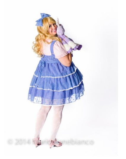
Figure 2.2.2 Infantilized Sweet Lolita.

There seems to be a slight rift between Lolitas who wear sweet coordinates and those who wear gothic and classic coordinates. Those Lolitas who wear gothic and classic often argue that sweet Lolita is too childish and utilizes unflattering colors like pastel pink and lavender. These Lolitas also argue that wearing sweet Lolita coordinates to work or to non-Lolita events is very difficult and uncomfortable because they are very noticeable and deviate wildly from any mainstream popular clothing of today. Classic and gothic Lolitas take pride in their coordinates and often feel as though they can wear casual versions of their coordinates to non-Lolita events, public places, and to work and school without feeling uncomfortable. As I mentioned previously, many younger members will dress in sweet Lolita while older members will dress in classic or gothic. The rift between the two styles is also likely to be related to the age difference between members.