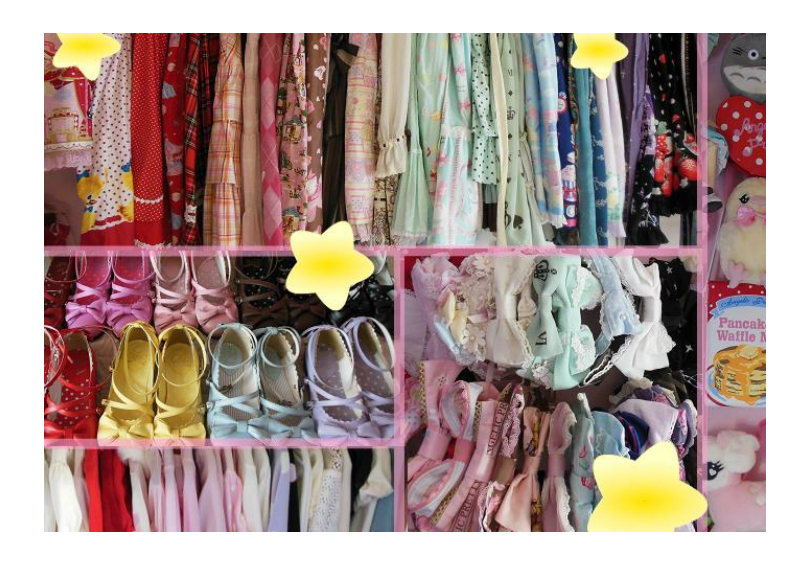
Figure 4.2.2 Wardrobe Post Example \#1^{14}