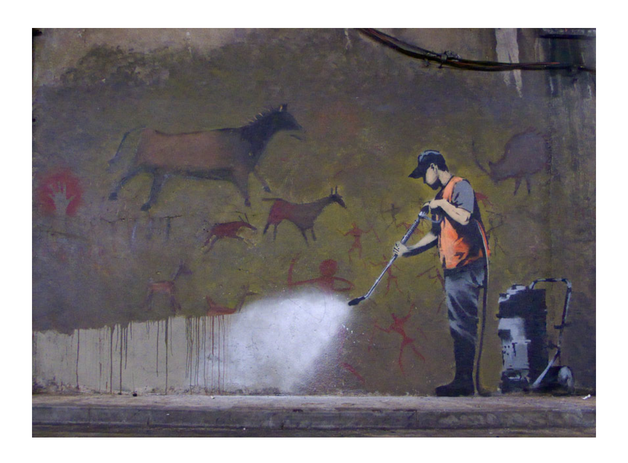
Figure 2: Banksy