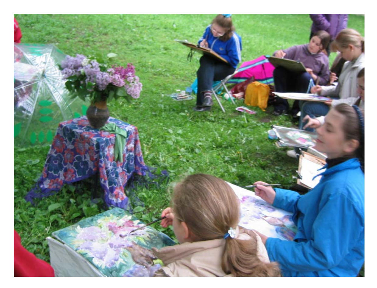
Figure 6: Students outside Boris Kustodiev Children's Art School.

"By Learning you will Teach and By Teaching you will Learn." -Anonymous.