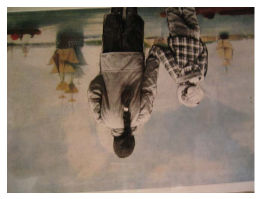
Figure 5: Light box of Lenin and two photo assemblages at a contemporary gallery in St. Petersburg where Kate Sutton gave us a tour on our summer trip 2005..