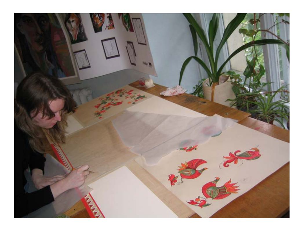
Figure 1: Traditional decorative 2-D and 3-D art design classes offered at Herzen Applied Fine Arts School in St. Petersburg. (Bang photos, 2005).