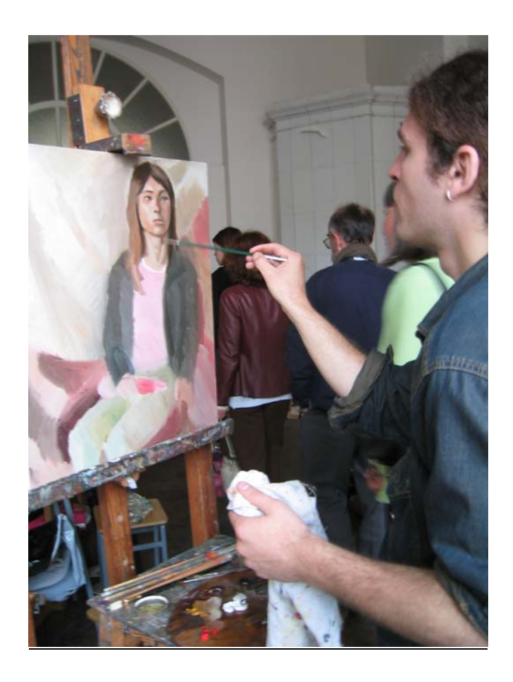
Figure 2: Classically trained art student painting from an actual model at the Herzen Applied Fine Arts studio. (Bang photos, 2005).