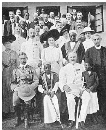
Figure 4 5 .

The Buganda Kingdom is today home to the Republic of Uganda's political and commercial capital city Kampala as well as the country's main International airport Entebbe (see fig.1). Uganda is made up of almost 40 different ethnic groups with the Baganda being the largest group at approximately 17% of the total population (CIA 2002 census). The early history of the Kingdom of Buganda has for generations been passed down through oral tradition and accounts on the formation of the kingdom vary depending on the source. For the purposes of this paper I have compiled information on the history of the Kingdom from texts from the early 20 th century written about the customs of the Baganda, more recent journal articles, as well as information from the official website of the Buganda Kingdom and related unofficial sites.