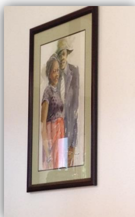
Figure 9 Clinic wall art