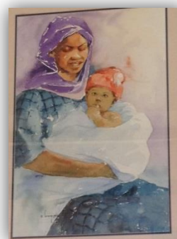
Figure 10 Clinic wall art