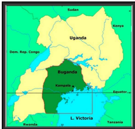
Figure 3 4 .