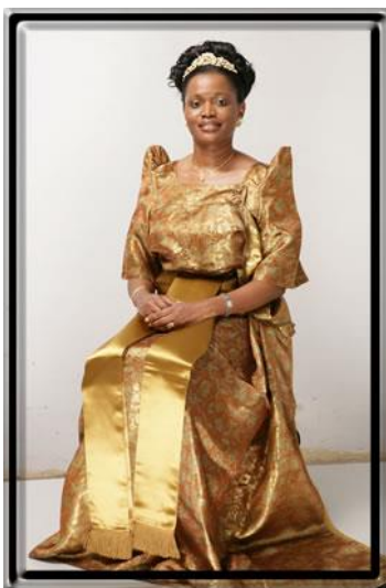
Figure 6 His Majesty Ronald Muwenda Mutebi II, Kabaka of Buganda and (Figure 7) The Nnabagereka (Her Royal Highness, the Queen) Sylvia Nagginda both in traditional costume.