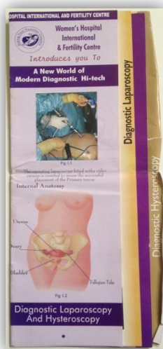
Figure 8 Clinic pamphlet

ing and go forward to undertake their quest for health with conviction (Davis-Floyd and Sargent 1997). The ontological politics I mention here just briefly but they are certainly worth further investigation in future studies especially as ARTs become available in rural areas where they will have to compete with more traditional views of healing including ethnomedicine and local frameworks therein. But my point here is that there are power dynamics at play in the private clinic setting that encourage the patient to have faith in these modern processes and perhaps to leave more traditional concerns at the door.