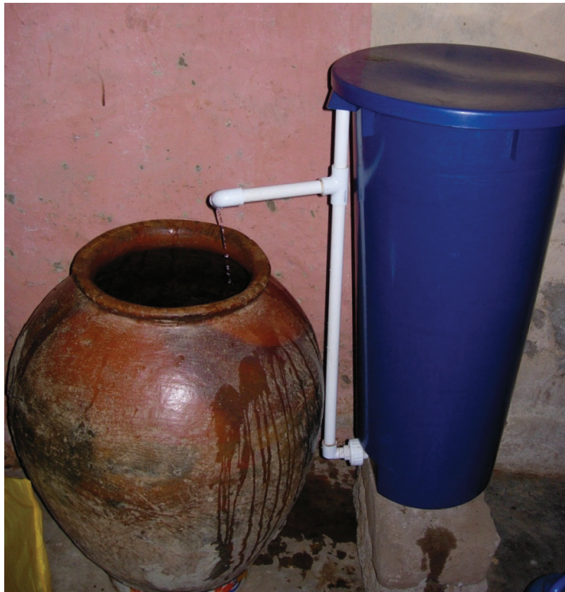
Figure 1. Typical set-up of the plastic BSF in a household in rural Tamale, Ghana (2008).

impoundments, [14]. The purpose of the RCT was to document the ability of the plastic BSF to improve water quality for both fecal indicator bacteria and turbidity and to reduce diarrheal disease in a setting where the population relies heavily on contaminated, highly turbid surface water for drinking and where the lack of access to water and sanitation are likely to be contributing significantly to morbidity and mortality in children under five years of age [2,14].