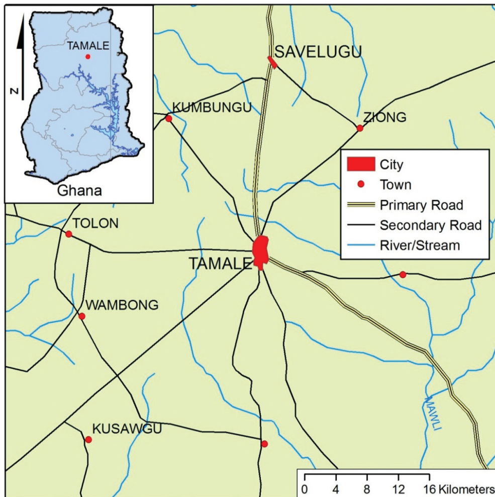
Figure 2. Map a (1:500,000) indicating the location for the Randomized Controlled Trial of the Plastic Biosand Filter in Tamale, Ghana (2008).

a The map was based on VMAP0 2000 data [15] and was formatted using ArcGIS 10 (ESRI, Redlands, CA, USA).