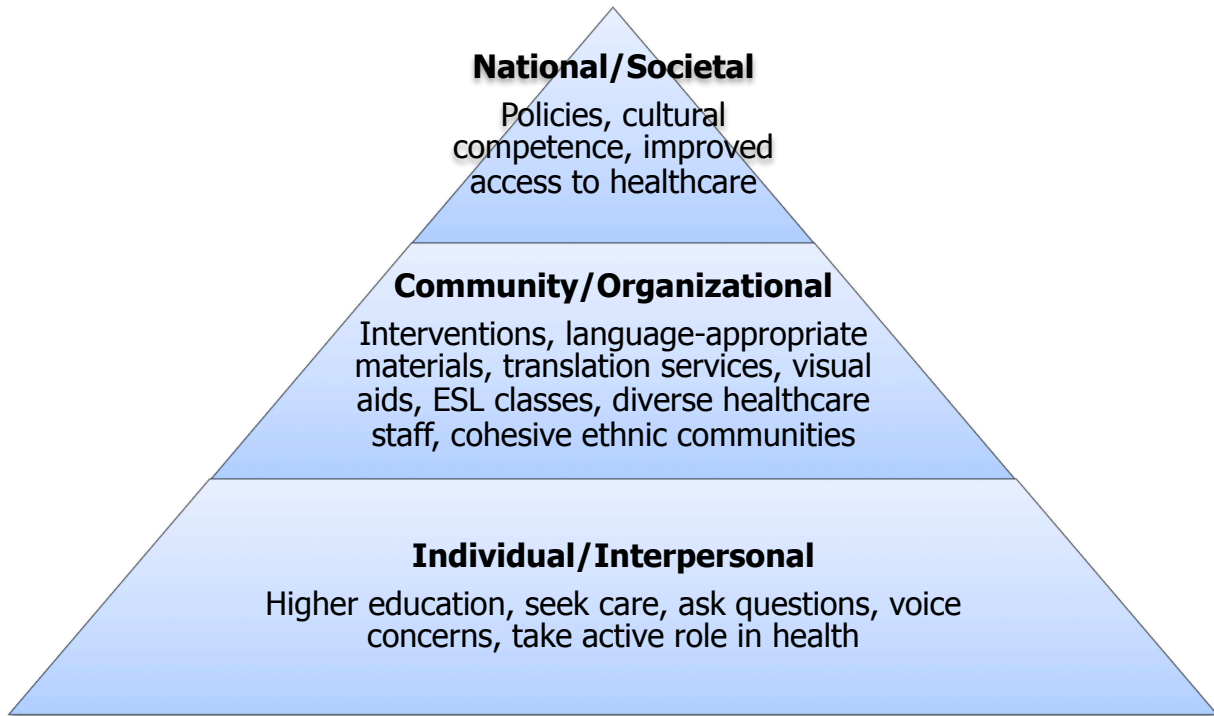
FIGURE 1: Social ecological model of interventions appropriate to LEP patients