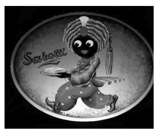
Figure 2: The Sarotti Moor Image found in George Steinmetz and Julia Hell's article, "The Visual Archive of Colonialism: Germany and Namibia."

seen below to advertise its chocolates. The bulging eyes and large lips of this African servant resemble some of the figures in the development aid cartoon discussed above. Also, the Sarotti Moor plays on Middle Eastern stereotypes with the turban and dress. Blackness thus referred to a host of "outsider" characteristics. Finally, this portrayal of blackness in association