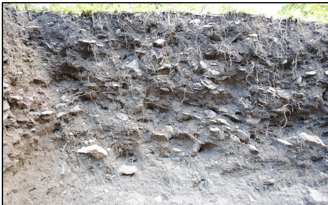
Figure 4.3 Partial Profile View of the Southern Wall of Unit 1 Level 1

The southwestern portion of Unit 1 revealed a cluster of mano and metate preforms that rested on top of Level 2. Mano and Metate Cluster 1 was comprised of 16 mano and metate preforms with four blocks of uncut limestone (Figure 4.4). However, portions of this cluster remained embedded in the southern wall of Unit 1. In order to fully expose Cluster 1, a 0.25 m x 1.5 m extension was opened along the southern wall of the southwestern portion of Unit 1. This extension, Unit 1, Extension A was brought down to the top of Level 2. Even after Extension A was brought down to Level 1, a few mano and metate preforms protruded into the southern wall of Unit 1. As a result, it was decided to create a second extension of the same size, Extension B. Excavating this extension revealed that those preforms extending into the southern wall of Extension A represented the extent of the cluster.