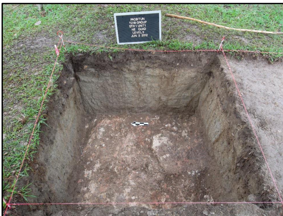
Figure 4.6 Complete East Profile View of Unit 1, Northeast Quad.

As a result of the temporal constraints of the field season, only \frac{3}{4} of the original 3 m x 3 m unit was excavated to bedrock. Excavations in this unit yielded no concrete evidence of the existence of architecture. However this does not dismiss the one time-existence of a workshop. As Searcy (2011) notes, workshops often existed within a perishable structure atop a raised platform. Initially, there were plans to further investigate the potential of a physical structure. We had originally hoped to create three 2 m x 0.5 m trench units extending to the north, south, and east of the structure. The western portion of the mound was not to be sampled as a result of the drastic drop-off in elevation. There were hopes that these trenches would expose any physical wall that surrounded the unit. Once again, the temporal constraints that limited bringing every quad from Unit 1 to bedrock limited our ability to create the aforementioned trenches (see below for future research objectives).