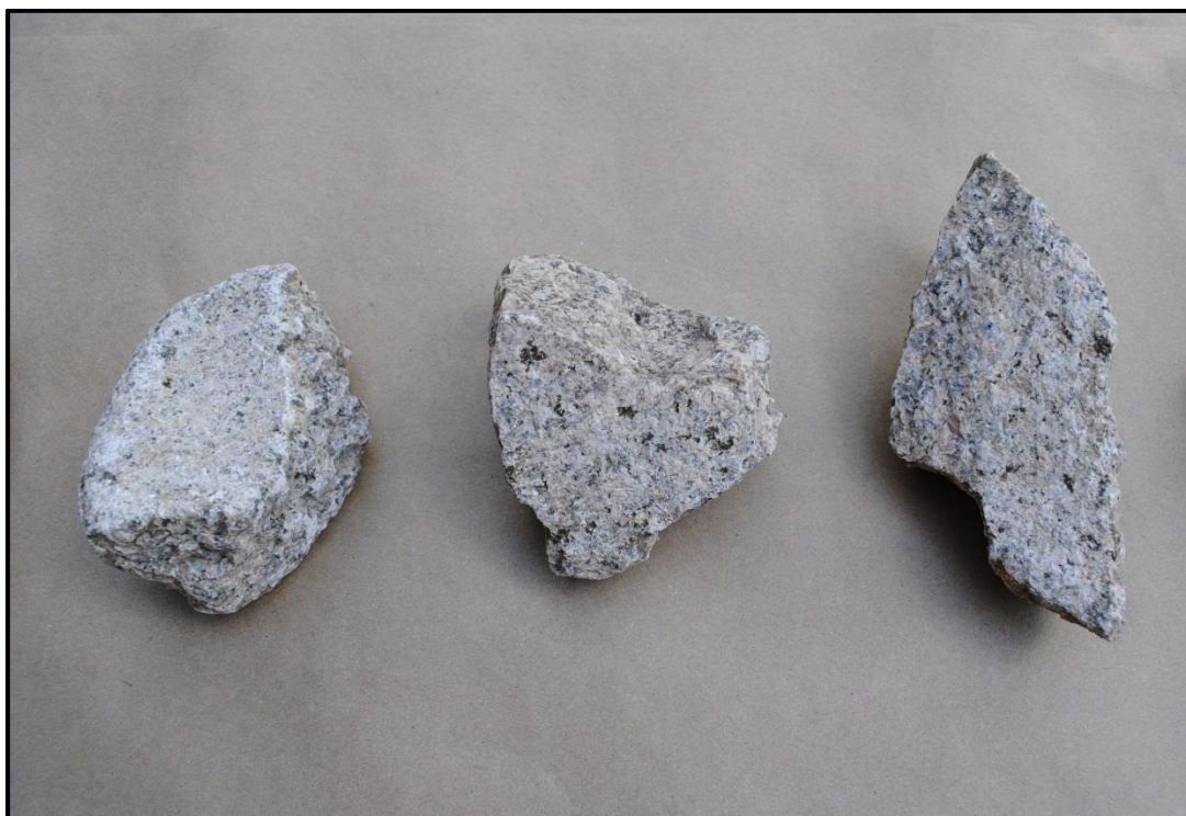
Figure 5.3 Representative Sample of Metate Fragments.

Interestingly enough, the number of metates found within Level 1 appear in a much lower frequency than manos. From Unit 1 Level 1, 17 metate preforms were found. Metate preforms were rather troublesome to identify as compared to mano preforms. All metate fragments were roughly the size of some of the larger flakes produced by what Hayden (1987) termed the estillar phase of production. The distinguishing factor that was utilized for separating metate preform fragments from flakes was the observed presence of smoothing on the artifact's surface. Out of these 17 metate preforms, only one possessed a trough formation indicative of a metate in the latter stages of the afinar phase of production. This trough form can be seen in the far left metate example in Figure 5.3.