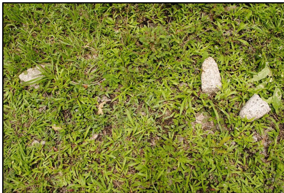
Figure 4.2 Example of Surface Finds on Mano Mound