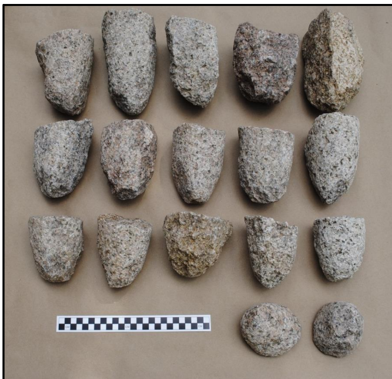
Figure 5.2 Representative Sample Mano Preforms Found in Unit 1, Level 1