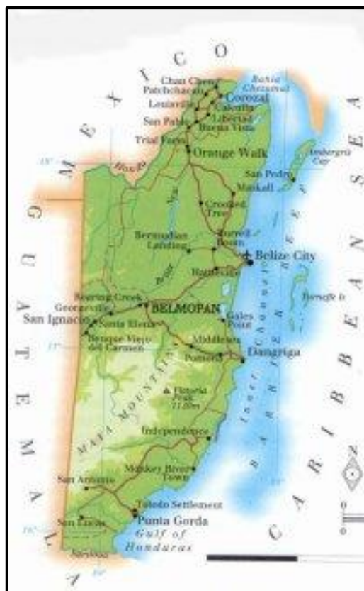
Figure 3.2 Physical Map of Belize including the Maya Mountains. Populstat (2004)