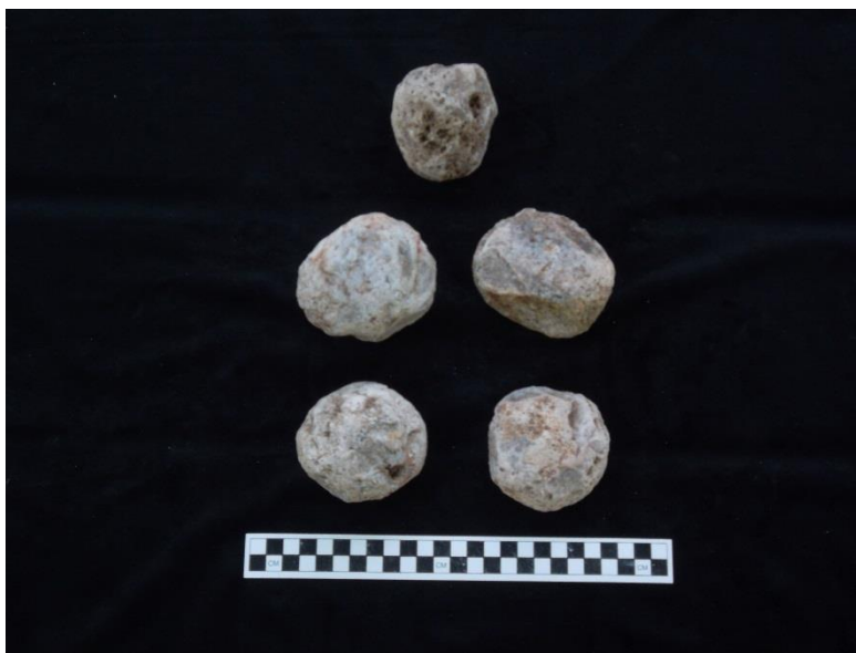
Figure 5.4 Chert Cobbles