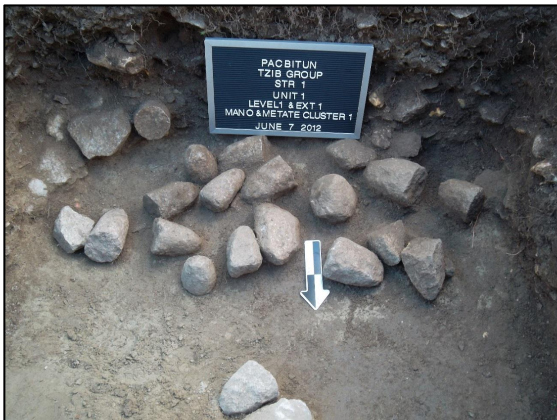
Figure 4.4 Mano and Metate Cluster 1 within Unit 1 and Ext. A.

A second, smaller cluster of mano and metate preforms was located in the western portion of Level 1. Out of this cluster, Mano and Metate Cluster 2, roughly 14 preforms with two pieces of amorphous granite were uncovered. The boundaries of this cluster were entirely within Unit 1, therefore, no extension was needed to entirely expose the cluster. All mano and metate preforms found in Unit 1 and Unit 1 Extensions A and B were uncovered in Level 1, with the majority coming from the two identified clusters.