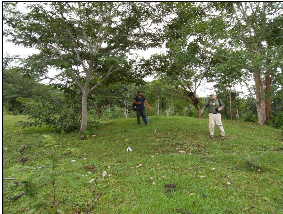
Figure 4.1 Mano Mound