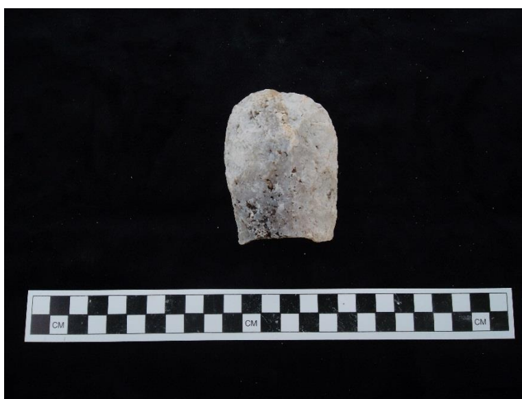
Figure 5.5 Chert Biface