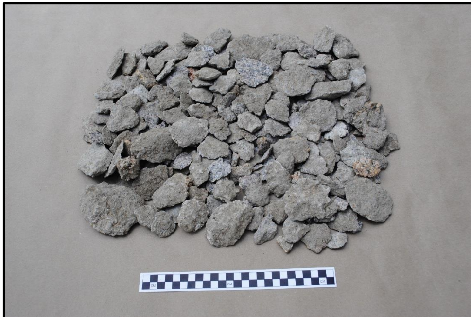
Figure 5.1 Representative Samples of Granite Debitage Found in Unit 1, Level 1.