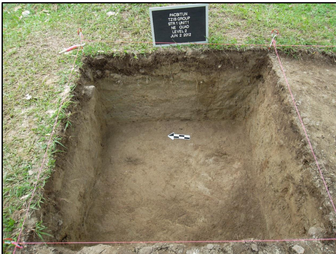
Figure 4.5 East Profile of Unit 1, Northeast Quad, Level 2.

Once again, we excavated the northeastern quad first to reveal the next level. The fill that was present in Level 2 of Unit 1 was not found in Level 3. This production debris was replaced by thick, yellowish-brown clay. In Level 3, the artifact density increased greatly from what was found in Level 2. Granite found in this layer dropped off dramatically, while ceramic and lithic remains were uncovered at relatively high densities. Throughout the entire 3 m x 3 m unit, the thickness of Level 3 stayed between 10-15 cm. Level 3 proved to be the last cultural level within the unit. Below this level was bedrock. However, to make sure Level 3 was indeed the extent of cultural occupation within the unit, 10 cm off bedrock was excavated. No evidence of cultural materials were found within these few centimeters, thus excavations in Structure 1 Unit 1 were halted.