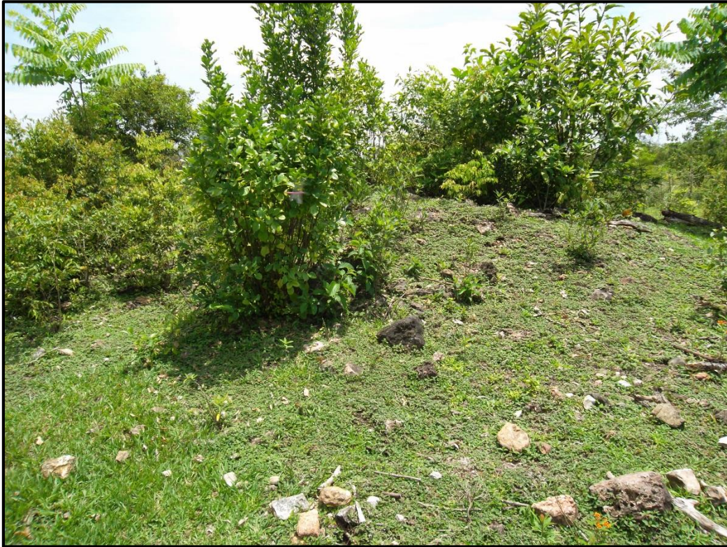
Figure 5.6 The Northern Structure of the Plazuela (Structure 2)