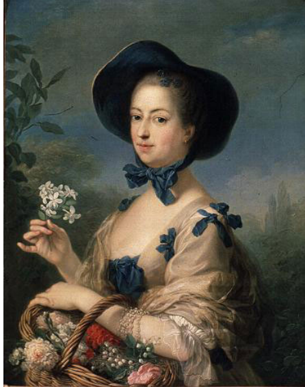
Figure 3: Carle Van Loo, Portrait of Madame de Pompadour as La Belle Jardinère , ca.1760. Source: Goodman, Elise. The Portraits of Madame de Pompadour: Celebrating the Femme Savante . Berkeley and Los Angeles: University of California Press, 2000.