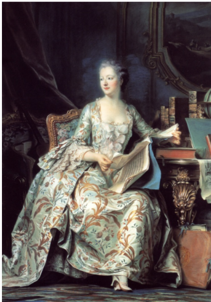
Figure 2: Maurice-Quentin de La Tour, Portrait of Madame de Pompadour , 1755 Source: Goodman, Elise. The Portraits of Madame de Pompadour: Celebrating the Femme Savante . Berkeley and Los Angeles: University of California Press, 2000.