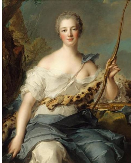
Figure 1: Jean-Marc Nattier, Portrait of Madame de Pompadour as Diana , 1755