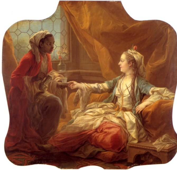
Figure 5: Carle Van Loo, Madame de Pompadour as a Sultana , about 1752