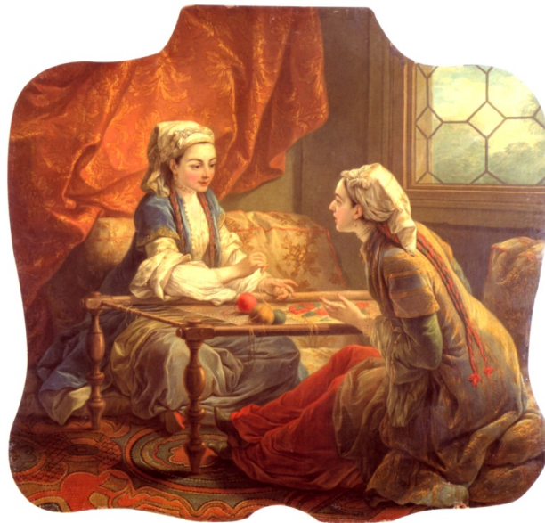
Figure 6: Carle Van Loo, A Sultana at her Tapestry Frame with a Companion , about 1752