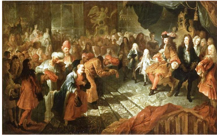
Figure 9: Antoine Coypel, Louis XIV Receiving the Persian Ambassadors , 1715