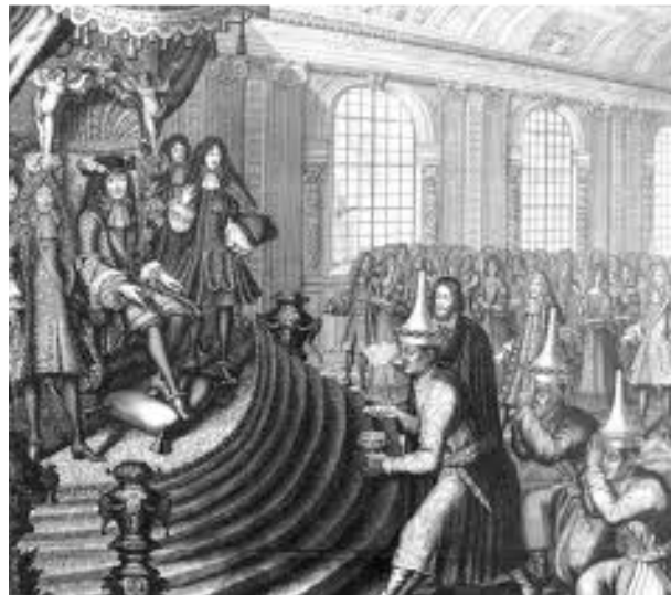
Figure 10: Nicholas III de Larmessin, The Siamese Embassy , 1686 Source: Göçek, Fatma Müge. East Encounters West: France and the Ottoman Empire in the Eighteenth Century . Oxford: Oxford University Press, 1987.