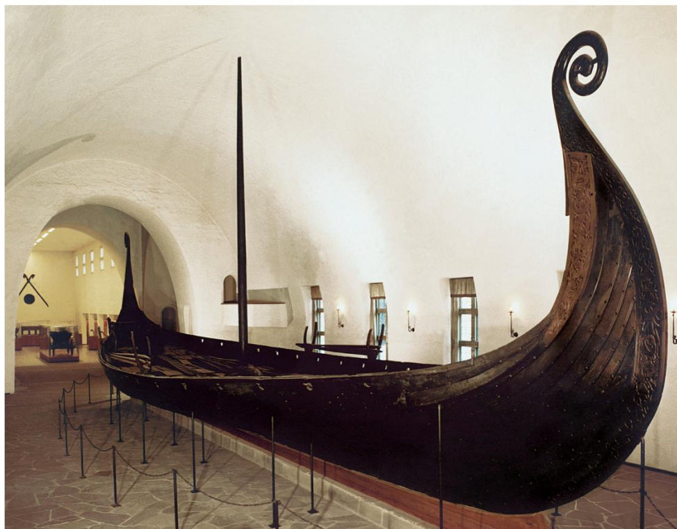
Figure 2 Oseberg Ship, Viking Ship Muesum Oslo Norway

life but also to provide a conveyance to Hel. Later this would evolve into the Viking burial tradition of burying the deceased in his or, in some cases such as the Oseberg Ship, her longboat along with significant possessions.