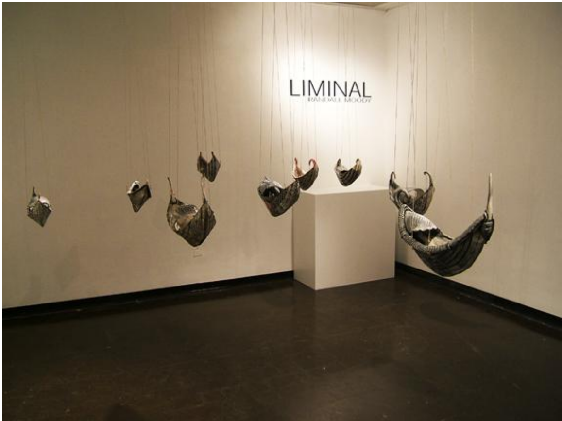
Figure 6 Installation View, Dimensions Variable, Randall Moody

I explore through the metaphor of boats the commonalities and links to all of these beliefs held by so many disparate cultures. By appropriating aspects of boats of different cultures I am alluding to an archetype of a spirit boat which can transcend the threshold between one realm or state of being and the next. In tapping into this deep well of mythos and belief each viewer can bring or take his or her own interpretation of where we are coming from or where we are going. My goal is to gently bring to light the idea that we as humans have far more in common with each other than we have differences. These commonalities are ageless, come from our inherent humanity and will continue long after this stage of existence.