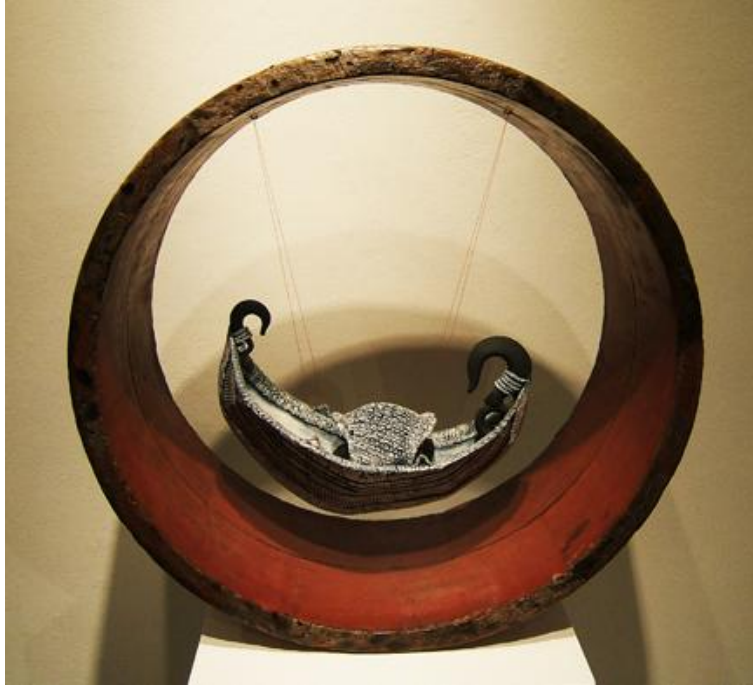
Figure 7 "Big, Red, Round", Mixed Media, 27" diameter, Randall Moody