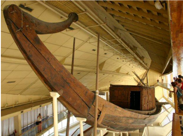
Figure 3 Solar Barque, Cheops (Kufu) c. 2500 BC

during his reign. These large boats (143 feet long by 19.5 feet wide) were dismantled and placed into the pits which were then covered with limestone slabs.