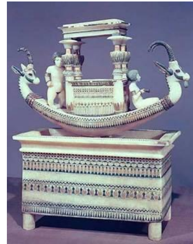
Figure 4 Dynasty Egyptian Boat, from the tomb of Tutankhamun

Boats and boat models are not only for burial but as in the case of the “spirit vessels” of Southeast Asia also a method of ridding the living of negative or malevolent spirits. As in the case of the kapal hantu “evil spirit boats” of Malaysia, although the scale of the boats (one to two meters) may suggest models or toys they are vessels of magical significance to the culture. These boats are made during times of need such as illness or drought. The boats are made, loaded with rice, tobacco, eggs, suckling pig and other offerings. After this the evil spirits are invited aboard and the boat is launched upon the water carrying the spirits of misfortune away from the people. (Loewenstein, 1958) This practice is echoed in British North Borneo with a ceremony called popoulik , meaning “making to go home”. This ceremony is held only during times of epidemic and is to send the demons of illness back to the underworld.