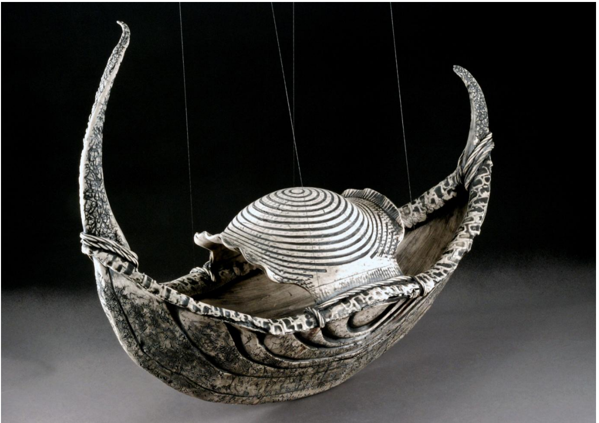
Figure 5 "Barque 5", Porcelain 19"X 14", Randall Moody

The textures allude to the decay the hull of a ship endures on a long journey while others denote the passage of time and trips. Other textures hold the apocryphal prayers of dead and the blessings of the living. Most funerary or spirit boats were either monumental or humble in scale. This served to remove the objects from being confused with those for actual use. The scale of my work is important to me in that it allows the pieces to read as artifact and as something alien yet related to us.