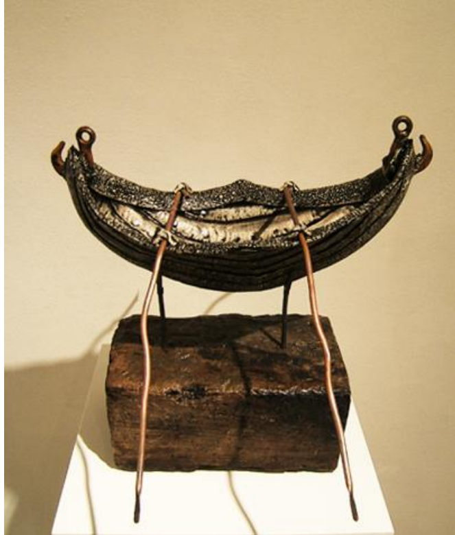
Figure 8 "Dark Barque 1", Porcelain, Wood, Copper and Steel, 20"x 20", Randall Moody