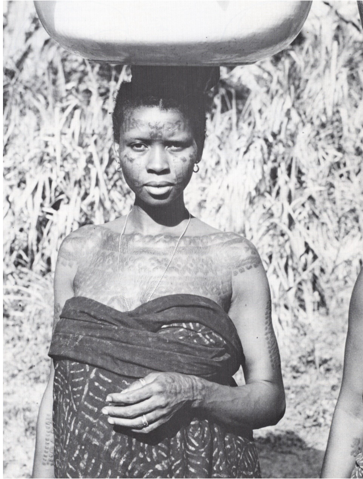
Figure 14. Yoruba Woman with kóló marks on hands, arms, neck, and face, 1973.