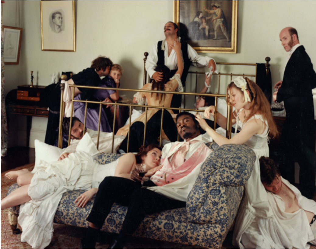
Figure 10. Yinka Shonibare, Diary of a Victorian Dandy: 0.300 hours , 1998, type C photograph, Source: Kent, Rachel. Yinka Shonibare, MBE . Munich, Germany: Prestel, 2008.