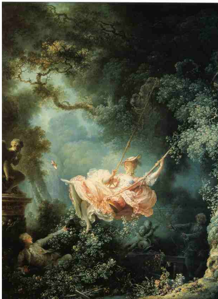
Figure 19. Jean-Honoré Fragonard, The Swing , 1765, Oil on canvas, 35x32 in.