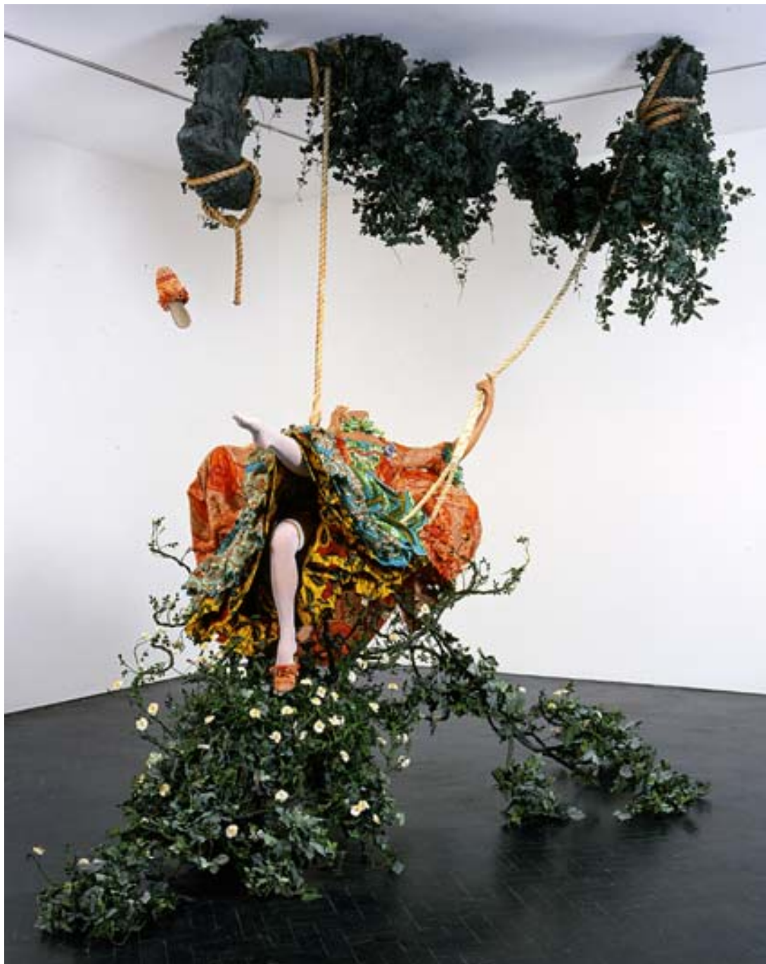
Figure 18. Yinka Shonibare, The Swing (after Fragonard) , 2001; mixed media, 330x350x220 cm. Source: Kent, Rachel. Yinka Shonibare, MBE . Munich, Germany: Prestel, 2008.