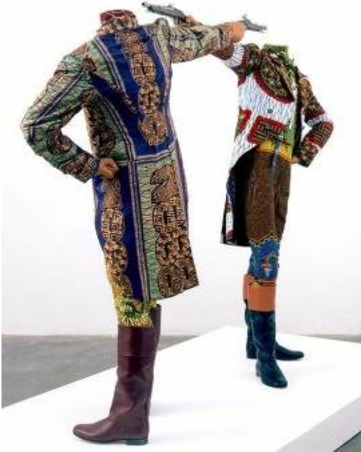
Figure 3. Yinka Shonibare, How to Blow Off Two Heads at Once (Gentlemen) , 2006, 2 life-size fiberglass mannequins, Dutch wax printed cotton, two guns, shoes, leather riding boots; plinth: 160x245, 122 cm; figures: 160x155x122 cm. Source: Kent, Rachel. Yinka Shonibare, MBE . Munich, Germany: Prestel, 2008.