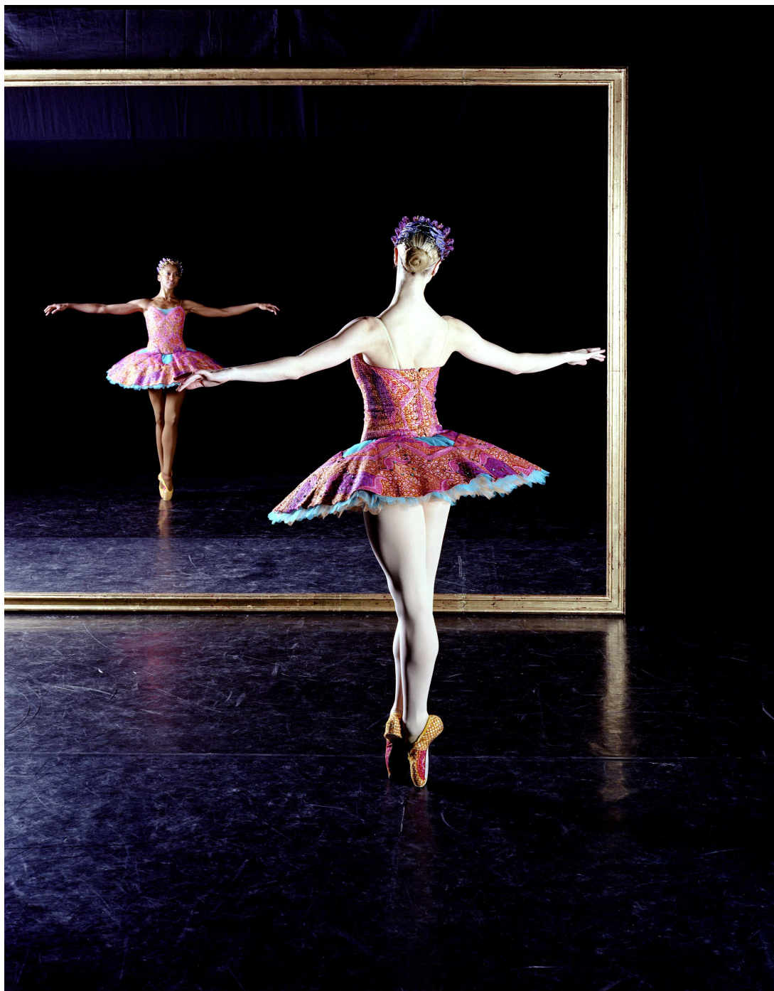
Figure 16. Yinka Shonibare, Odile and Odette , 2005, Film still. Source: Kent, Rachel. Yinka Shonibare, MBE . Munich, Germany: Prestel, 2008.