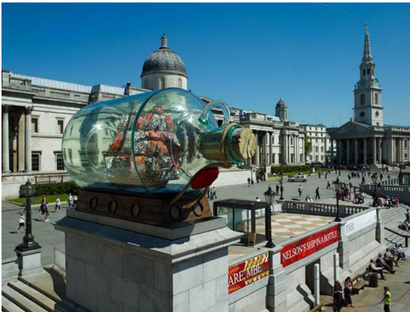
NELSON'S SHIP IN A BOTTLE

interpretation of gender, women’s role as “translators” is substantiated. His racial and ethnic deconstructions are often carried by his female figures, characterizing what British film theorist Laura Mulvey once defined as women’s position as “bearers, and not makers, of meaning.” 25 Through the objectification of the female body Shonibare accomplishes his Victorian fantasies and capitalistic obsessions. Thus, while Shonibare states that he adopted the MBE title, which acknowledges him as a member of the Order of the British Empire, as a platform of protest, what I endeavor to prove is that his function as a hegemonic subject is veritably reestablished through his poses of dominance over women.