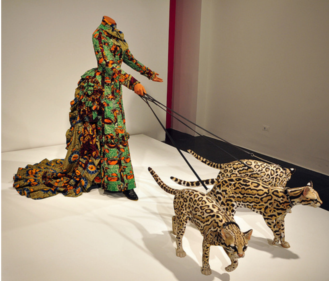
Figure 6. Yinka Shonibare, Leisure Lady (with ocelots) , 2001, life-size fiberglass mannequin, three fiberglass ocelots, Dutch wax printed cotton, leather, glass; woman 160x80x80 cm; ocelots 40x60x20 cm each. Source: Kent, Rachel. Yinka Shonibare, MBE . Munich, Germany: Prestel, 2008.