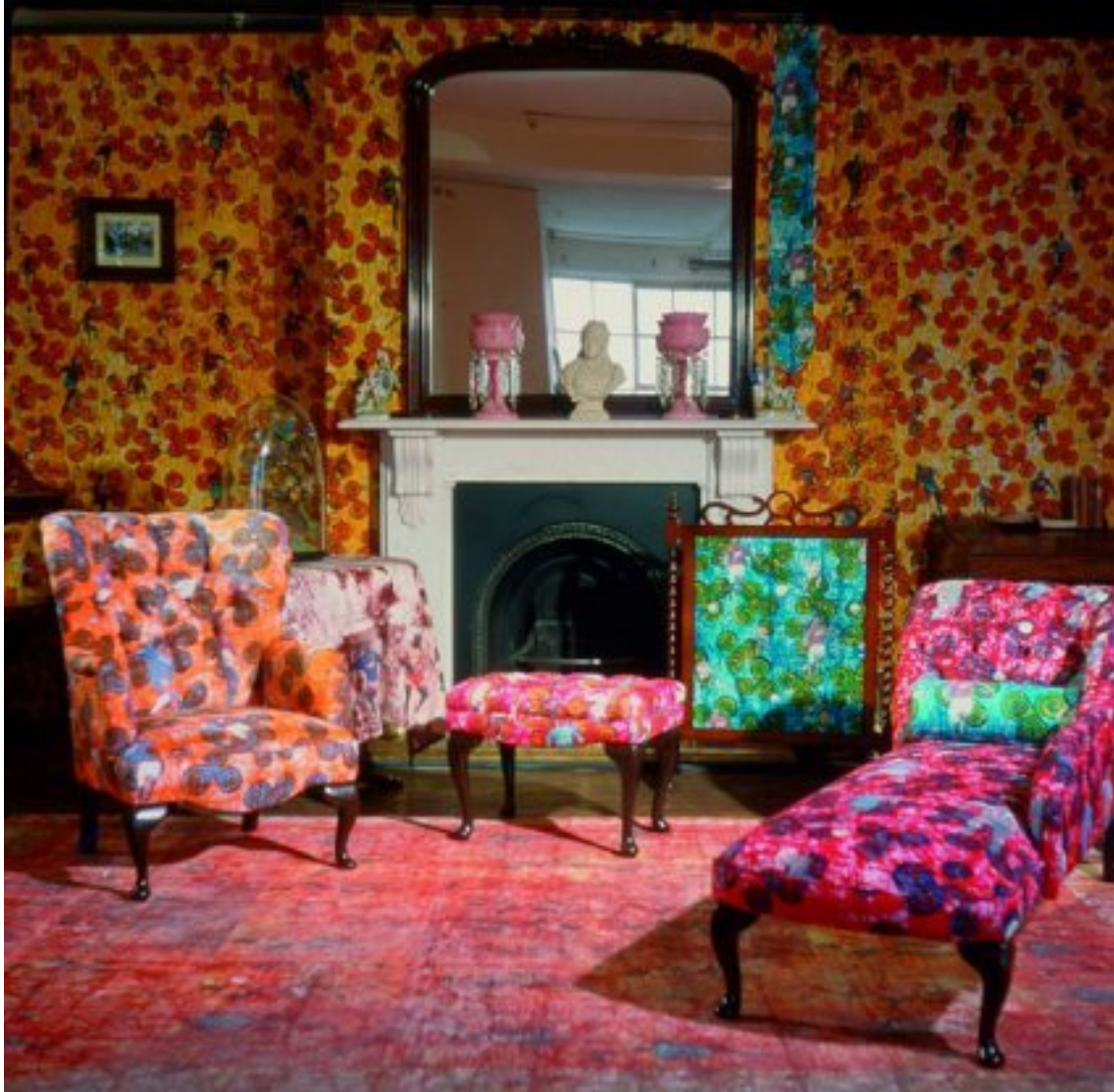
Figure 4. Yinka Shonibare, The Victorian Philanthropist's Parlour , 1996; reproduction furniture, fire screen, carpet, props, Dutch wax printed cotton, 260x488x530 cm.