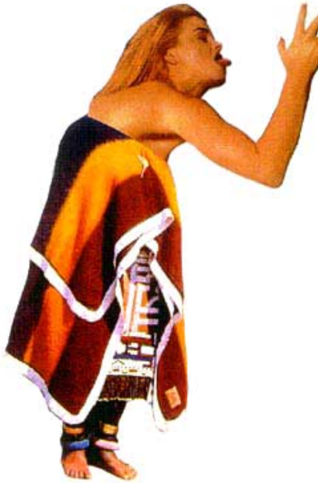
Figure 17. Candice Breitz, Rainbow Series #4 , 1996, Cibachrome Photograph. Source: Candice Breitz Web Site. "Rainbow Series." Accessed April 10, 2012. www.candicebreitz.net