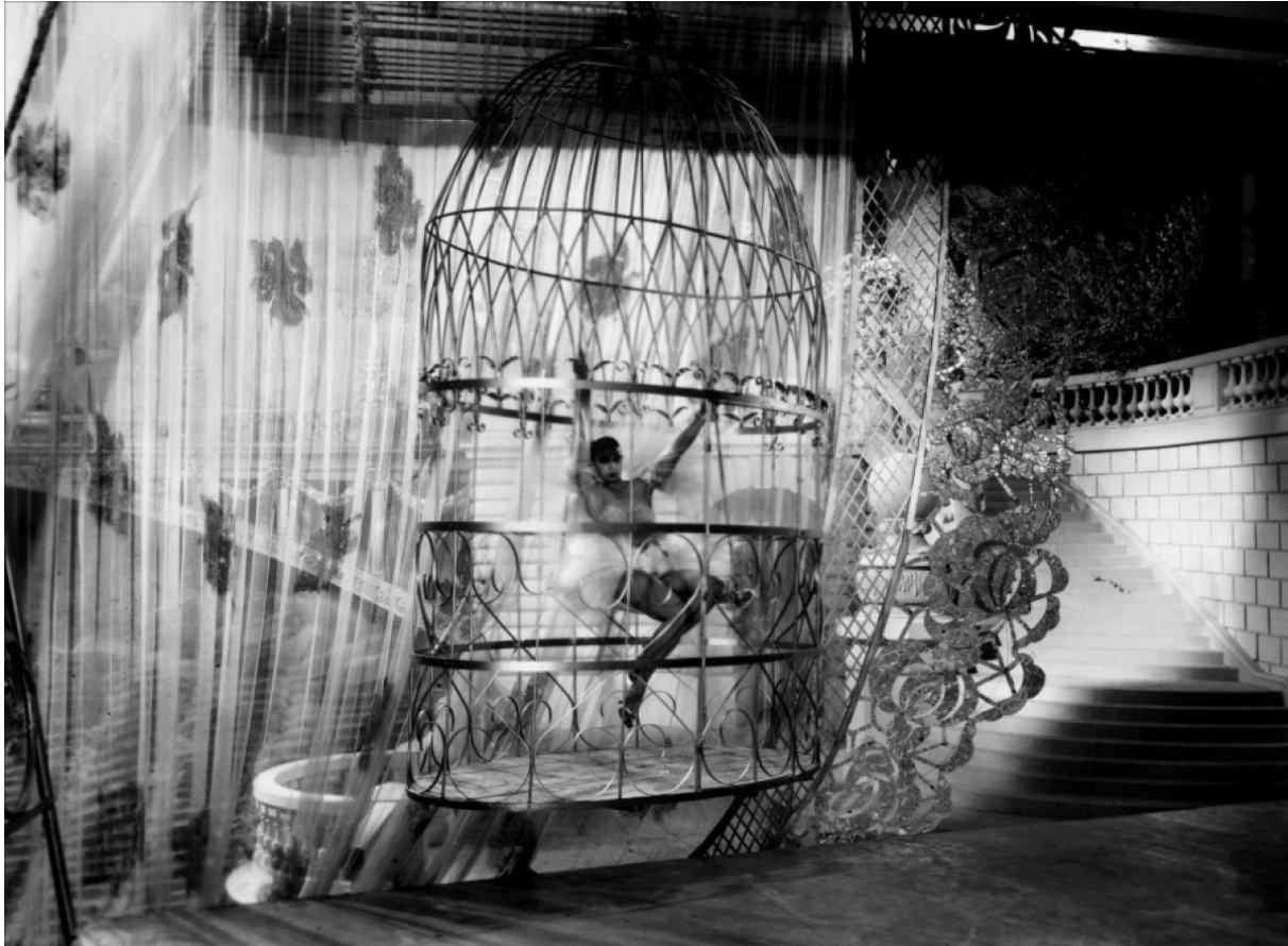
Figure 20. Josephine Baker, In Zouzou , 1934, Film still.