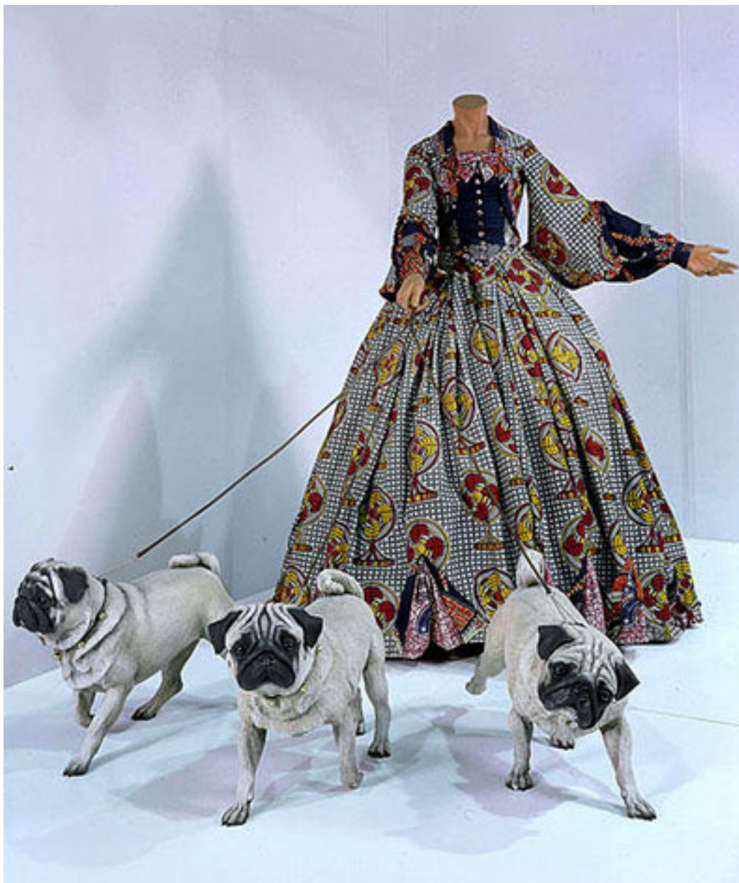
Figure 7. Yinka Shonibare, Leisure Lady (with pugs) , 2001, Life-size mannequin, fiberglass dogs, Dutch was printed cotton, figure: 160x80x80cm; dogs 40x60x20 cm each. Source: Kent, Rachel. Yinka Shonibare, MBE . Munich, Germany: Prestel, 2008.