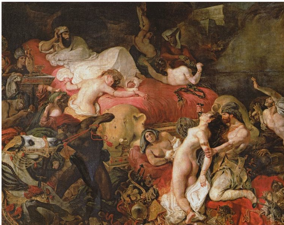
Figure 11. Eugène Delacroix, Death of Sardanapalus , 1827.