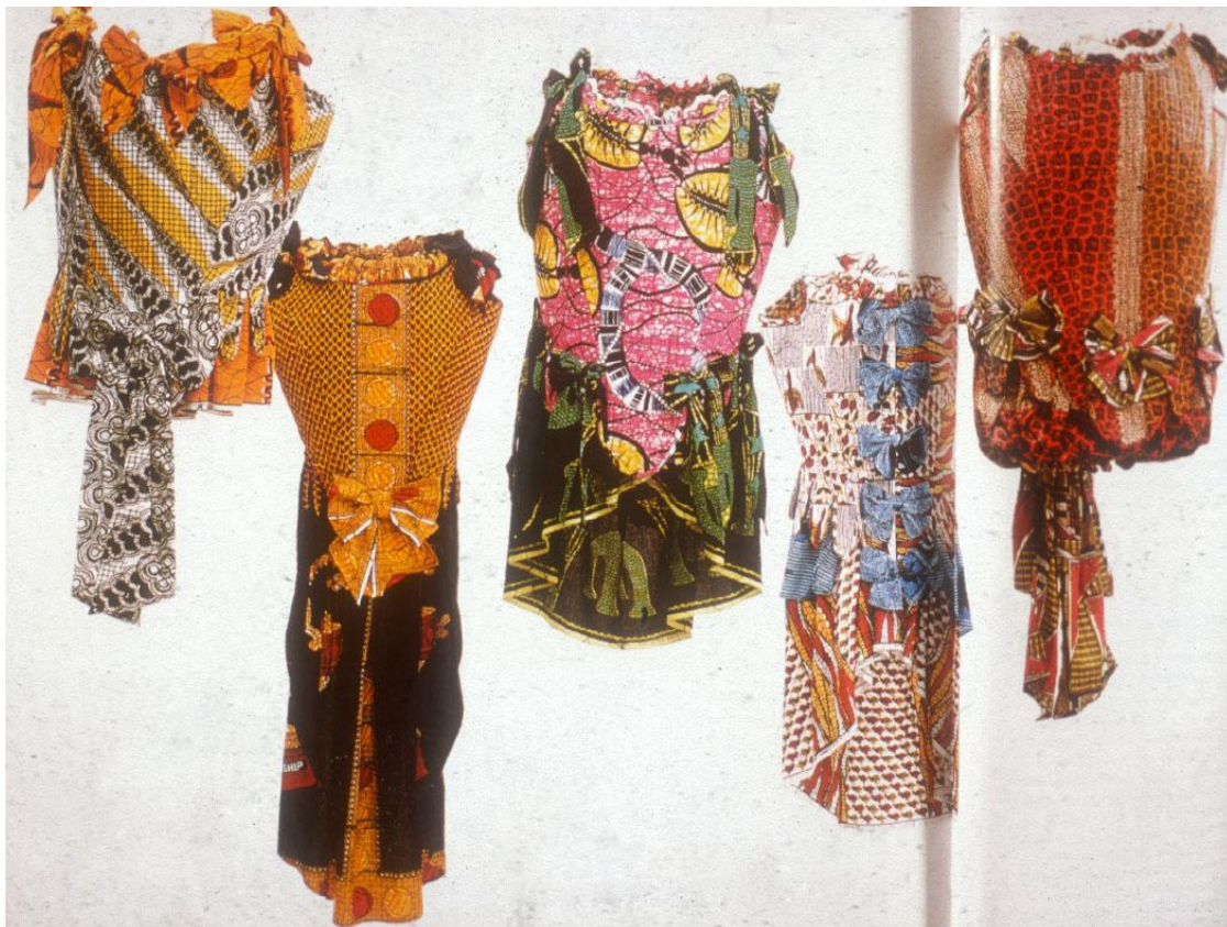
Figure 15. Yinka Shonibare, Five Undergarments and Much More , 1995, African fabric, rick-rack, fishing line, interlining, circumference 95x130 cm each. Source: Kent, Rachel. Yinka Shonibare, MBE . Munich, Germany: Prestel, 2008.