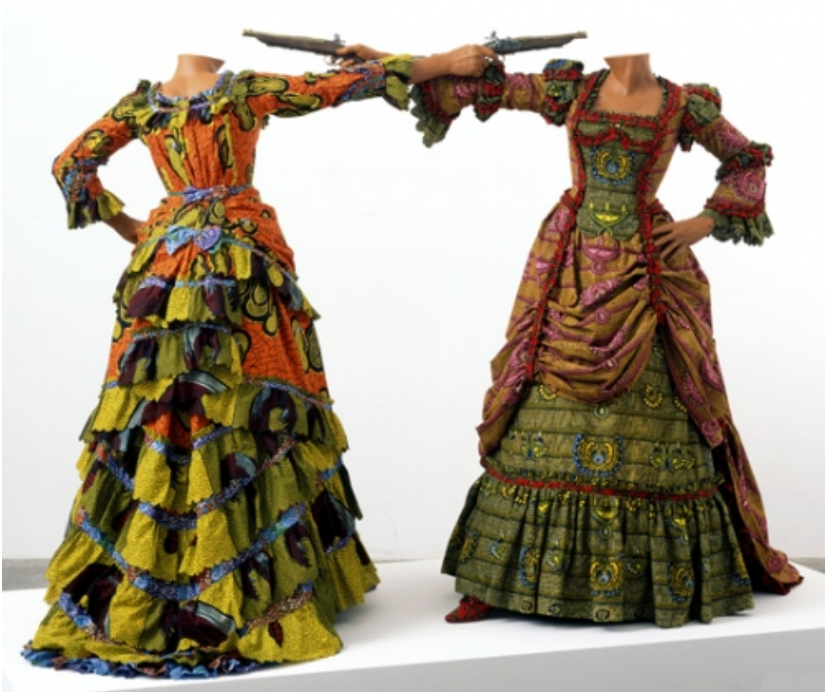
Figure 2. Yinka Shonibare, How to Blow Off Two Heads at Once (Ladies) , 2006, 2 life-size fiberglass mannequins, Dutch wax printed cotton, two guns, shoes, leather riding boots; plinth: 160x245, 122 cm; figures: 160x155x122 cm. Source: Kent, Rachel. Yinka Shonibare, MBE . Munich, Germany: Prestel, 2008.