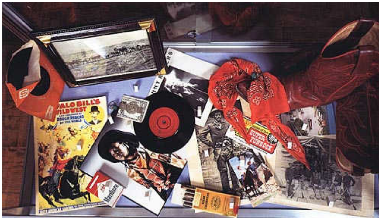
Figure 22. Yinka Shonibare, Mary Beth Regan's Case , from "Portable Personal Histories" Exhibition, 1997. Source: Iniva Web Site. "Shonibare." Accessed April 13, 2012. www.iniva.org/dare/themes/translation/shonibare.html

Shonibare's manipulation of femininity throughout his oeuvre requires additional consideration, as does the role of gender in relation to race and class discourses. Throughout this thesis, I have endeavored to challenge the assumption that race and gender can be deconstructed or subverted in the same ways. The articulation of gender does not necessarily align with racial concepts, thus, within the postmodern objective, an analysis of new feminine spaces is as imperative as understanding racial differences.