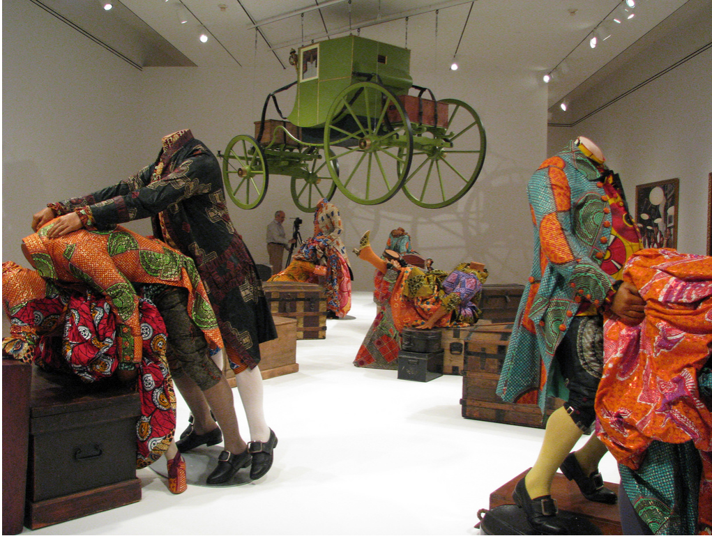
Figure 8. Yinka Shonibare, Gallantry and Criminal Conversation , 2002, 11 life-size fiberglass mannequins, metal and wood cases, Dutch wax printed cotton, leather, wood, steel; carriage: 200x260x470 cm; plinth 900x900x12 cm. Source: Kent, Rachel. Yinka Shonibare, MBE . Munich, Germany: Prestel, 2008.