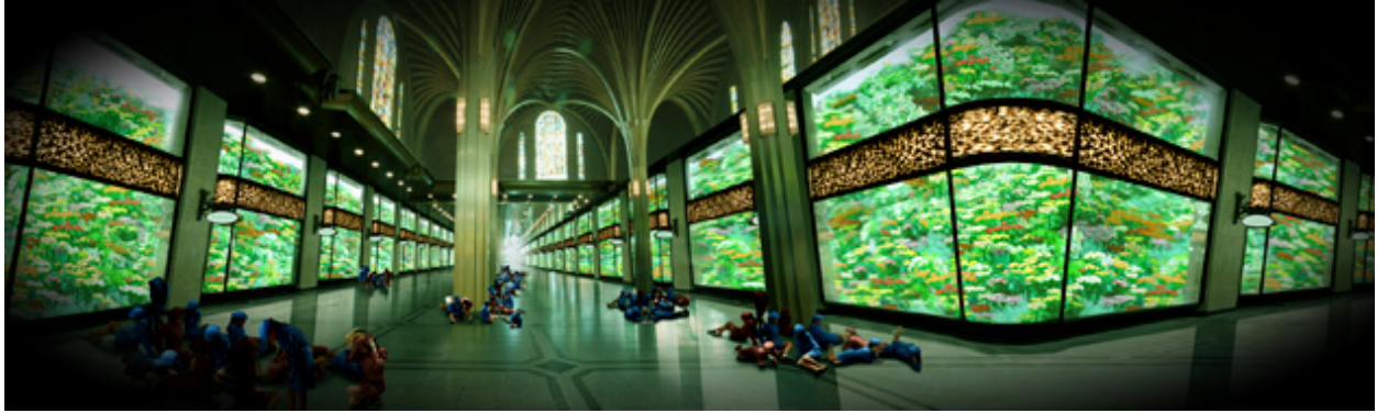
Figure 15. Yanagi Miwa, Aquajenne in Paradise I , 1994, chromogenic print, dimensions unknown.