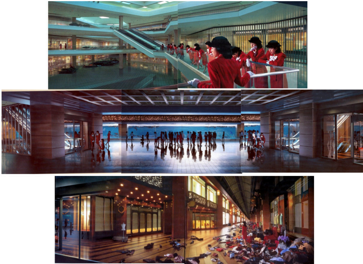
Figure 13. Yanagi Miwa, Midnight Awakening Dream , 1999, chromogenic print, 180 x 1877.4 centimeters. Source: Miwa Yanagi, Elevator Girls: Miwa Yanagi , Seigensha Art Publishing, 2007, 18-24.