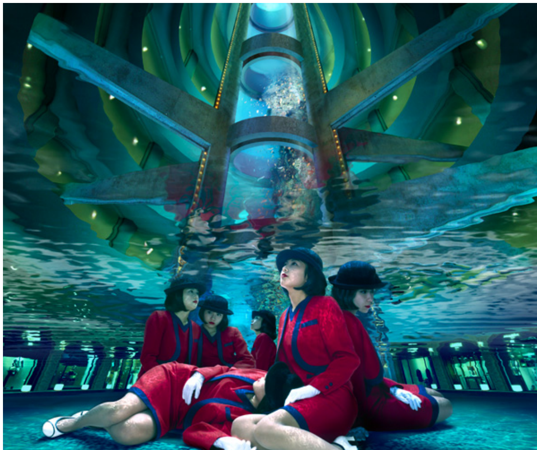
Figure 17. Yanagi Miwa, Elevator Girl House B4 , 1998, chromogenic print, 200 x 240 centimeters.