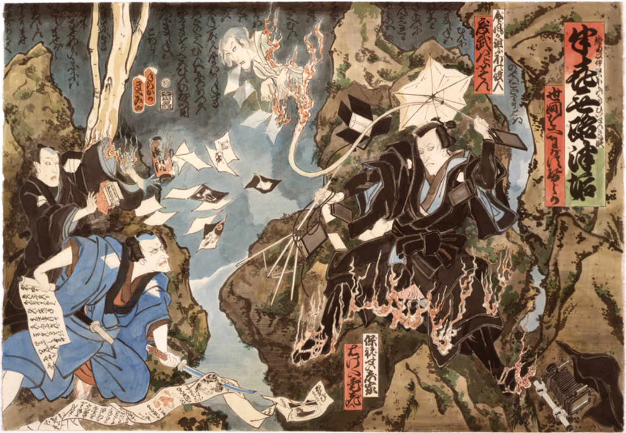
Figure 5. Teraoka Masami, Hanging Rock , 1990, watercolor on paper, 83.2 x 118.7 centimeters.