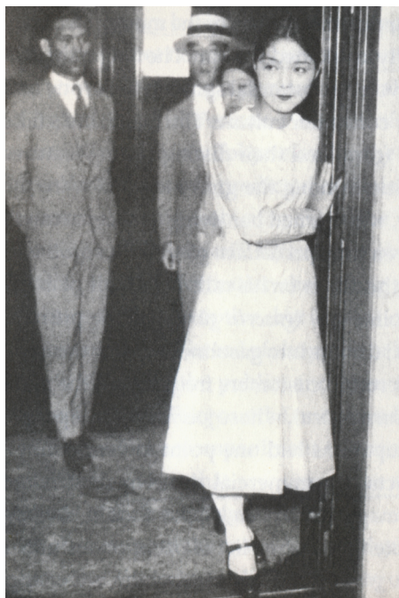
Figure 8. "Elevator girl in an office building," 1932. Source: Barbara Sato, The New Japanese Woman: Modernity, Media, and Women in Interwar Japan (Durham, Duke University Press, 2003), 122.