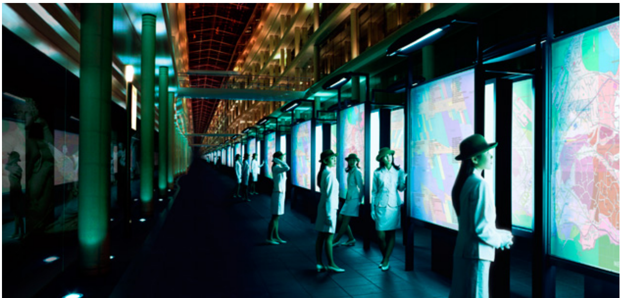
Figure 20. Yanagi Miwa, A Street with Maps , 1997, chromogenic print, 180 x 375.6 centimeters.