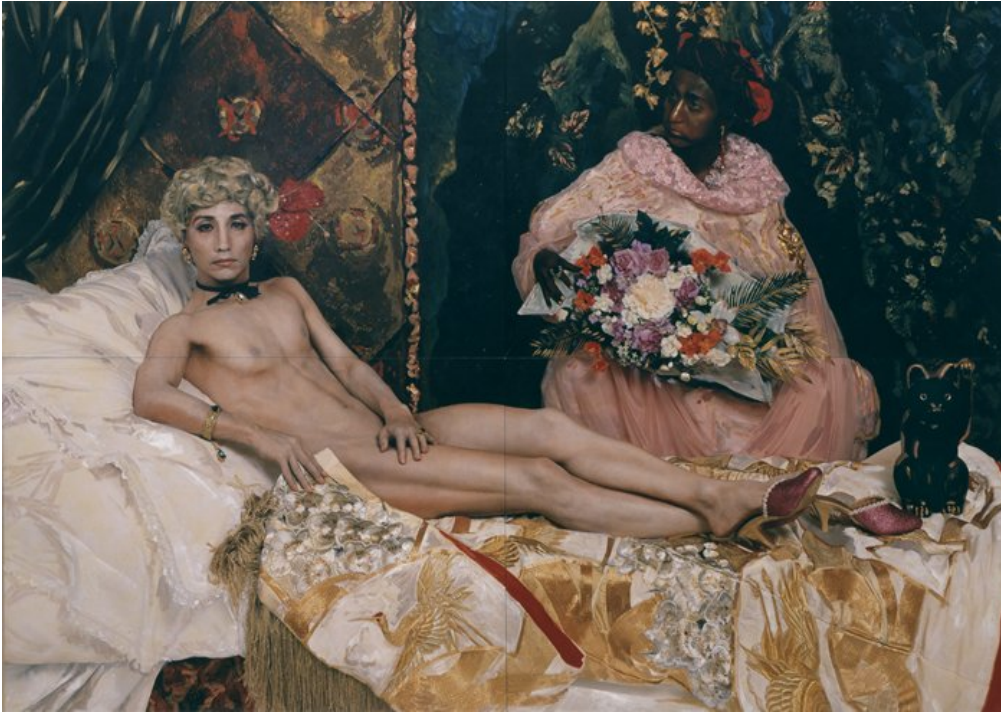
Figure 3. Morimura Yasumasa, Olympia (Futago) , 1988, chromogenic print with acrylic paint and gel medium, 210.19 x 299.72 centimeters.