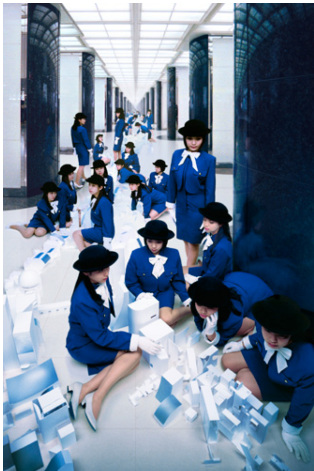
Figure 21. Yanagi Miwa, Eternal City II , 1998, chromogenic print, dimensions unknown.