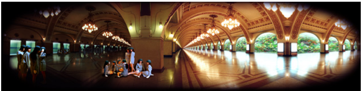
Figure 6. Yanagi Miwa, Looking for the Next Story I , 1996, chromogenic print, 180 x 720 centimeters.