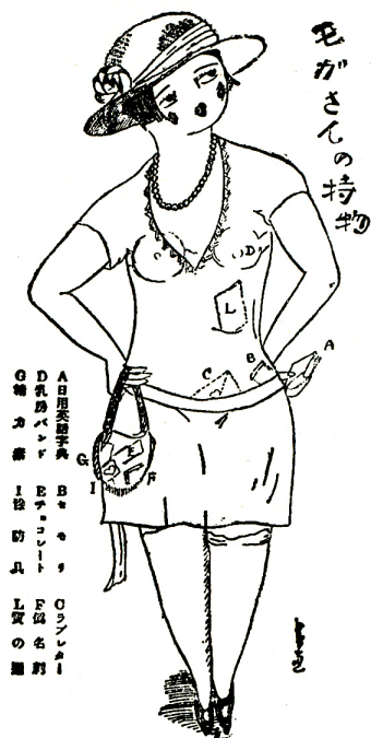
Figure 7. Kobayashi Kiyoshi, "A Modern Girl's Belongings," in Manga Mangun , 1928. Source: Barbara Sato, The New Japanese Woman: Modernity, Media, and Women in Interwar Japan (Durham, Duke University Press, 2003), 52.