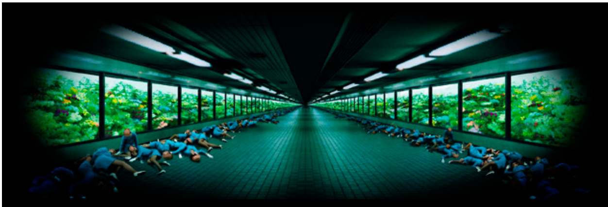
Figure 14. Yanagi Miwa, Looking for the Next Story II , 1994, chromogenic print, dimensions unknown.