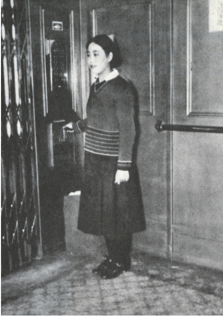
Figure 9. "Elevator girl in a department store," mid-1920s. Source: Barbara Sato, The New Japanese Woman: Modernity, Media, and Women in Interwar Japan (Durham, Duke University Press, 2003), 122.