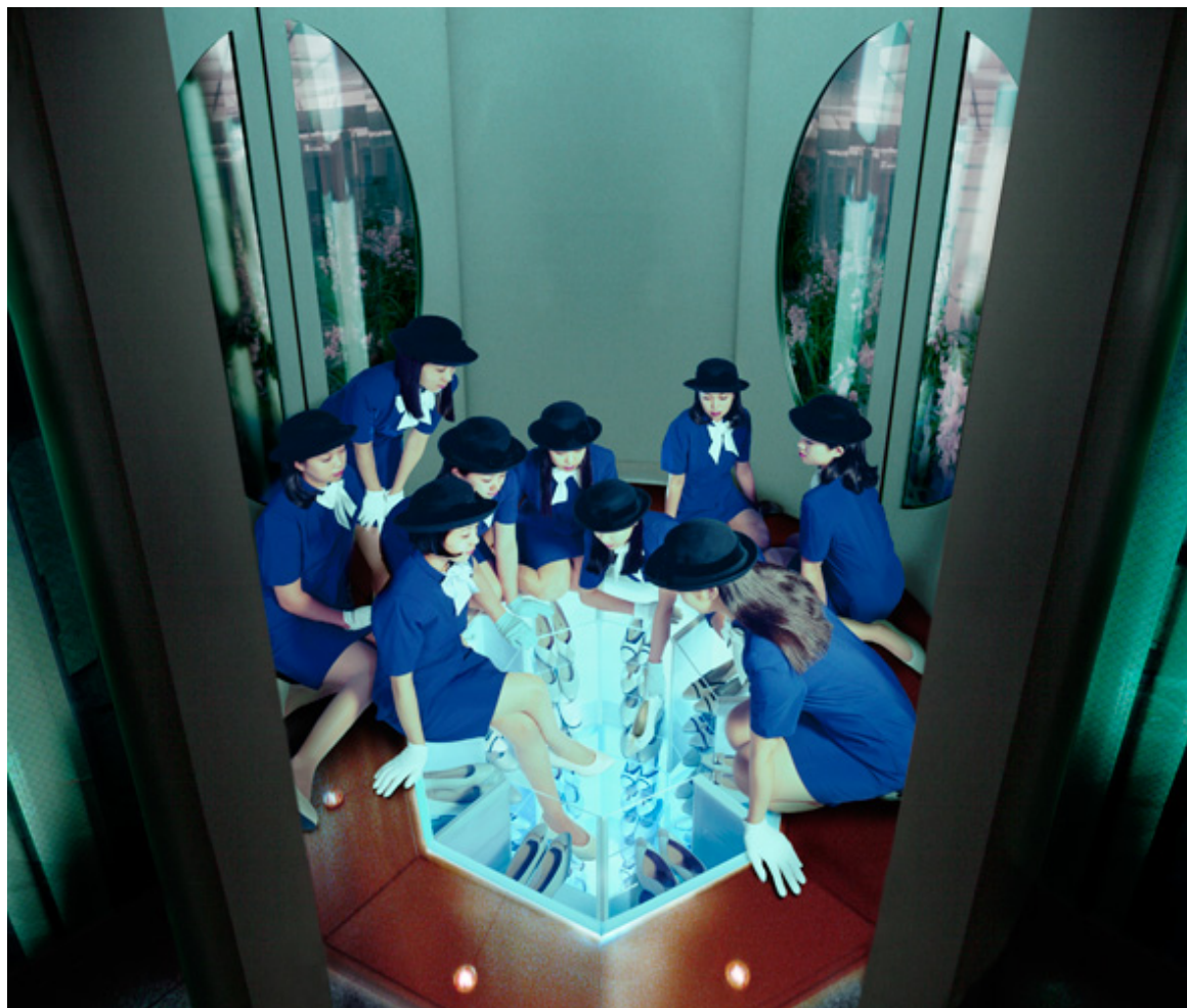
Figure 22. Yanagi Miwa, Elevator Girl House 3F , 1998, chromogenic print, 180 x 213 centimeters.