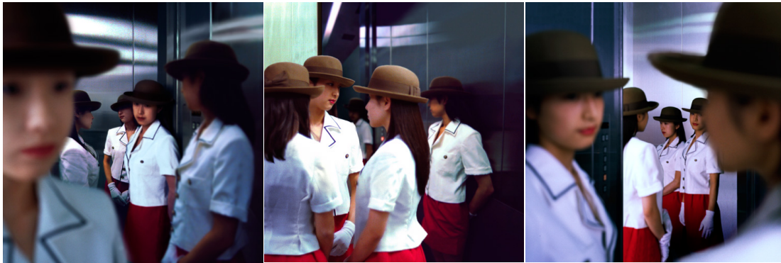
Figure 12. Yanagi Miwa, Before and After a Dream (triptych), 1997, chromogenic print, dimensions unknown.