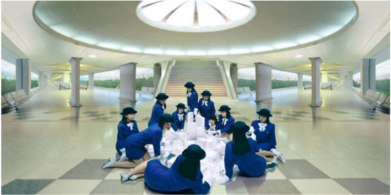
Figure 19. Yanagi Miwa, Eternal City I , 1998, chromogenic print, 180 x 360 centimeters.