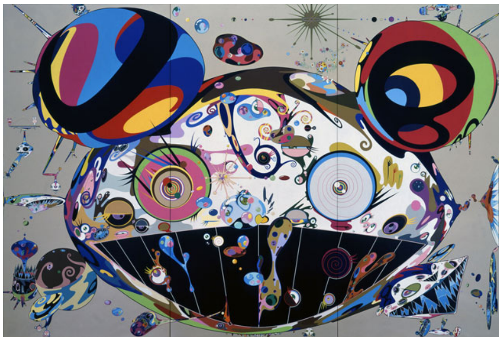
Figure 1. Murakami Takashi, Tan Tan Bo , 2001, acrylic on canvas mounted on board, 360 x 540 x 67 centimeters.