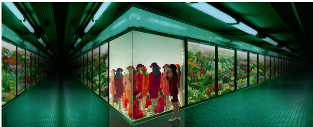
Figure 18. Yanagi Miwa, Elevator Girl House , 1995, chromogenic print, 71 x 179.5 centimeters.