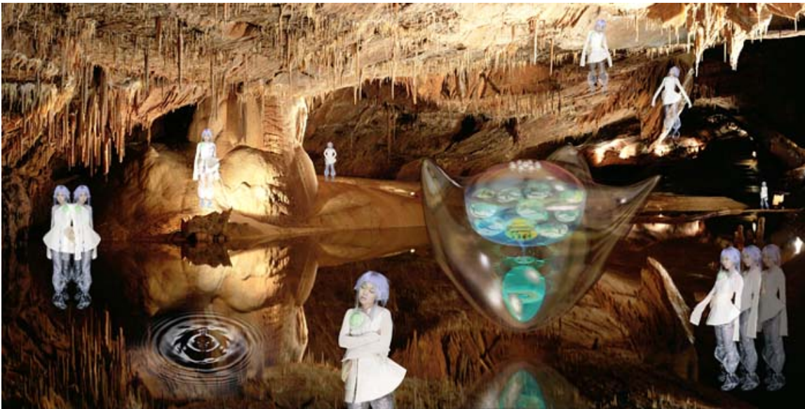
Figure 4. Mori Mariko, Mirror of Water, 1996-1998, color photograph mounted with glass in five parts, overall dimensions 305 x 610 x 1.9 centimeters.