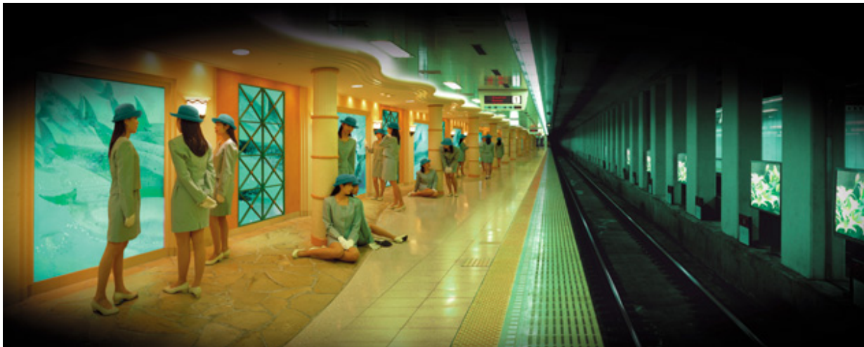
Figure 16. Yanagi Miwa, Elevator Girl House B3 , 1997 chromogenic print, 180 x 450 centimeters.