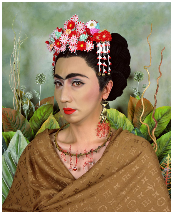
Figure 2. Morimura Yasumasa, An Inner Dialogue with Frida Kahlo (Hand Shaped Earring) , 2001, color photograph on canvas, 148.59 x 119.38 centimeters.