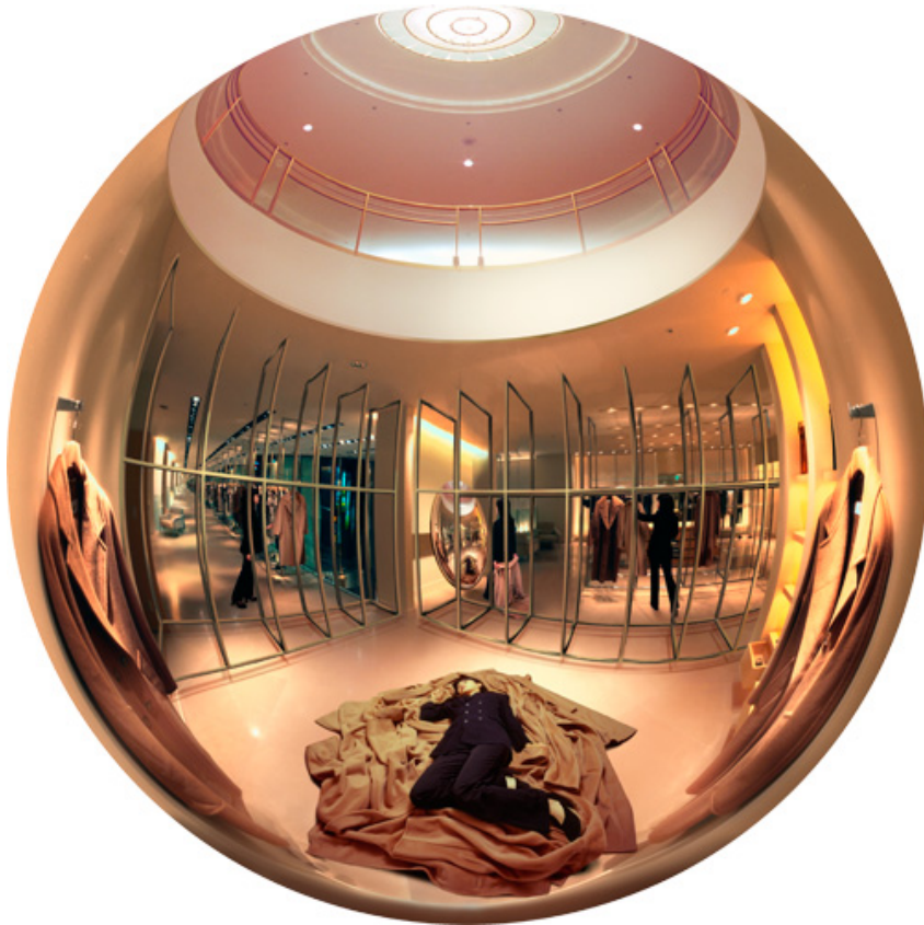
Figure 25. Yanagi Miwa, Paradise Trespasser II , 1998, chromogenic print, 180 centimeters in diameter.