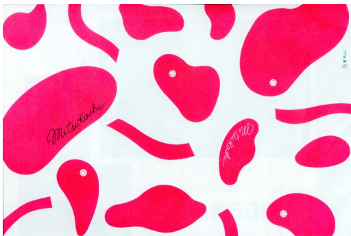
Figure 24. Mitsukoshi department store wrapping paper. Source: http://blogs.yahoo.co.jp/sakainaoki1947/55514433.html .