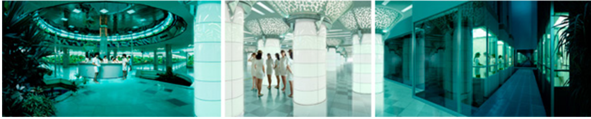
Figure 11. Yanagi Miwa, Information City: Fountain Garden / Woods of Shine / Elevator , 1996, chromogenic print, overall dimensions 180 x 900 centimeters.