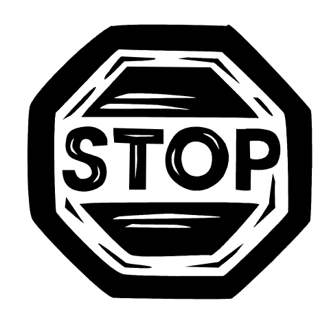
Do Not Proceed Until Directed