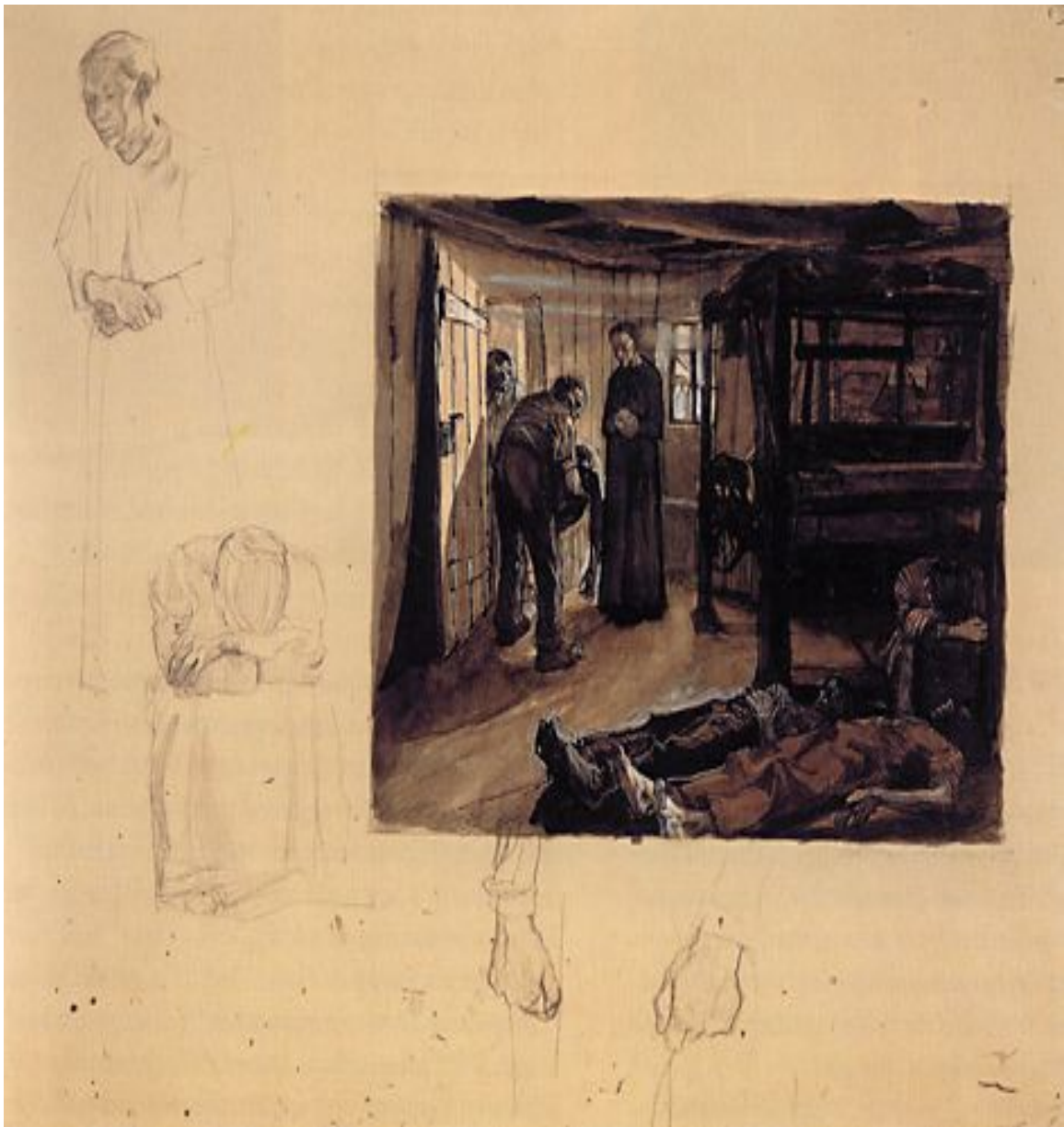
Figure 1: End (in progress), 1897, Staatliche Kunstsammlungen Dresden 215