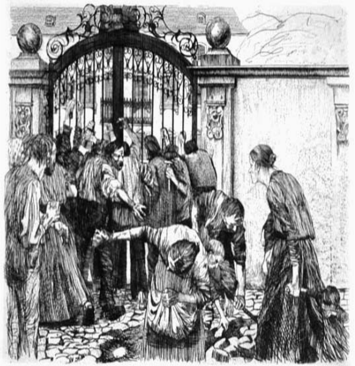
Figure 7: The Riot , 1897, etching