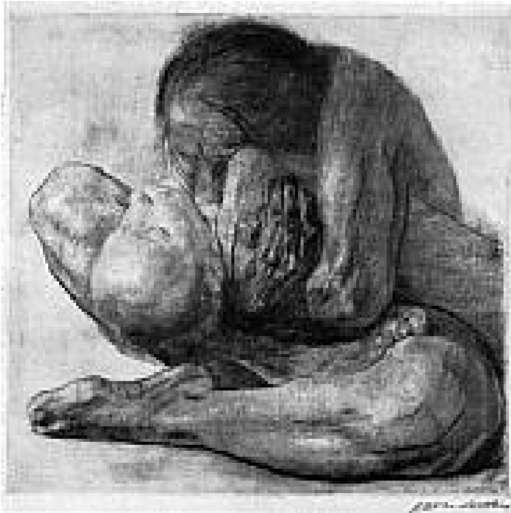
Figure 3: Mother with Dead Child , 1905, etching