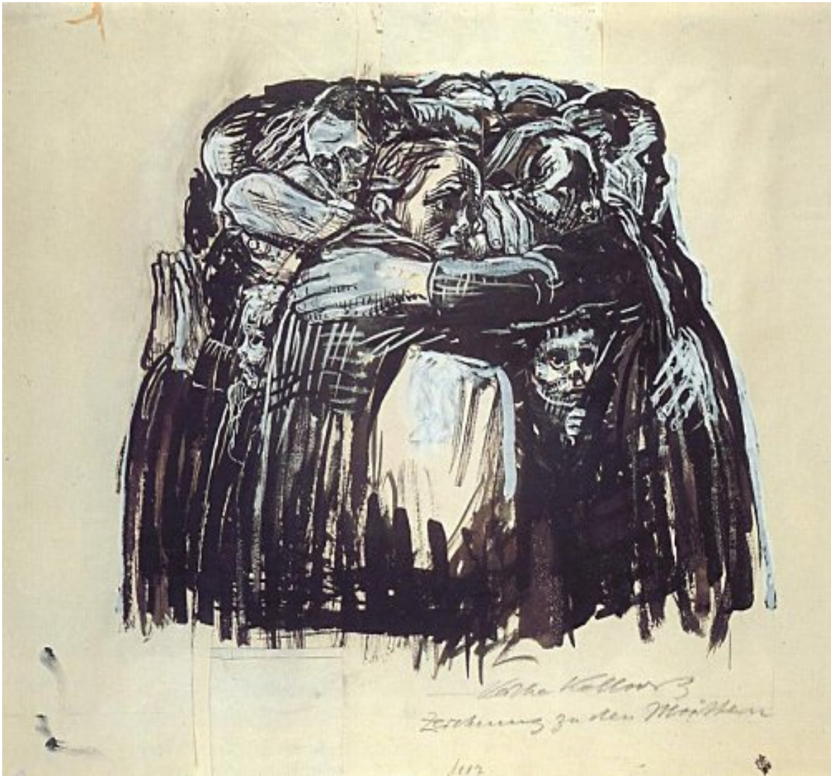
Figure 5: The Mothers , 1921, pen and brush, Boston Museum of Fine Arts 217