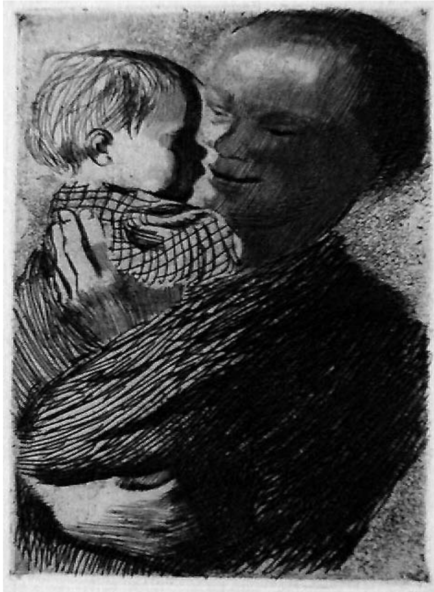
Figure 2: Woman with Child in Arms , 1910, etching