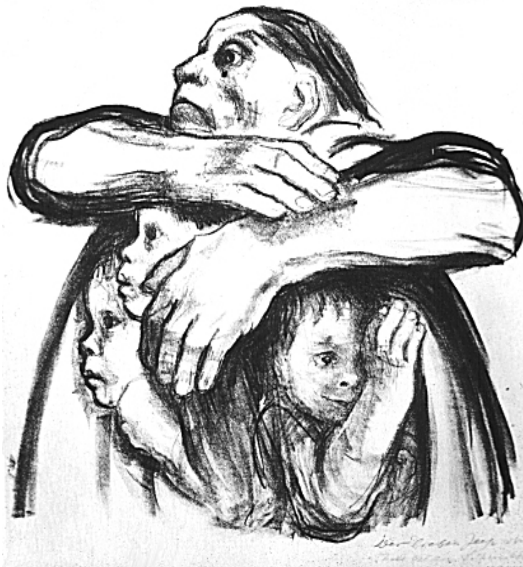
Figure 11: The Seed for the Planting must not be Sown , lithograph, 1942