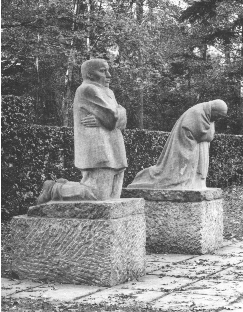
Figure 10: The Mourning Parents , 1932, sculpture, Roggevelde Cemetery, Belgium