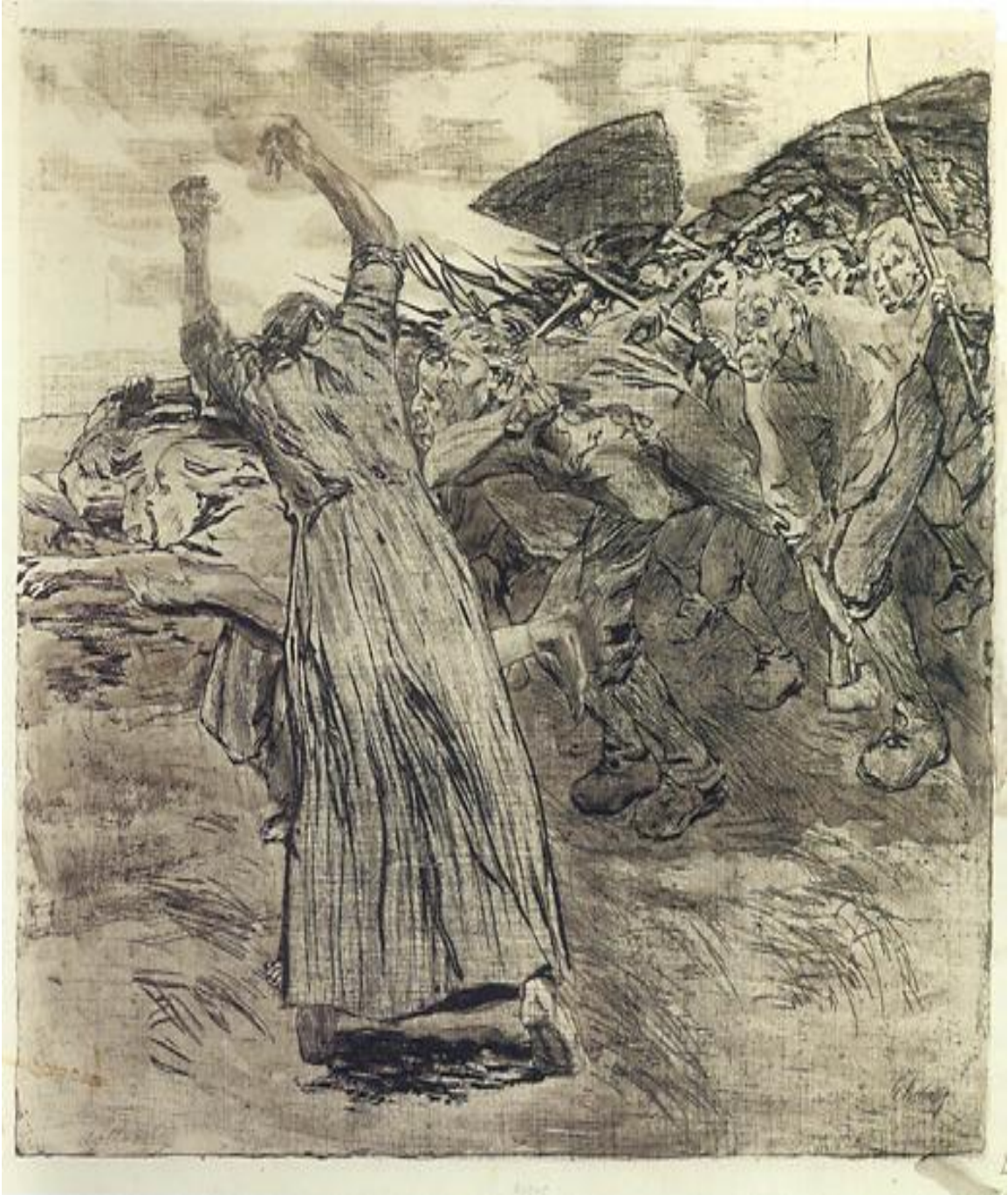
Figure 9: Outbreak , 1903, etching and drypoint, private collection