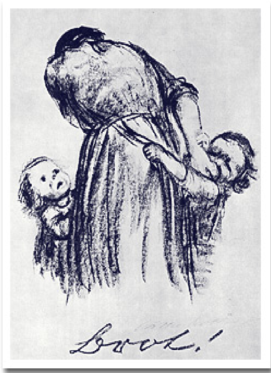
Figure 13: Bread! , 1924, lithograph