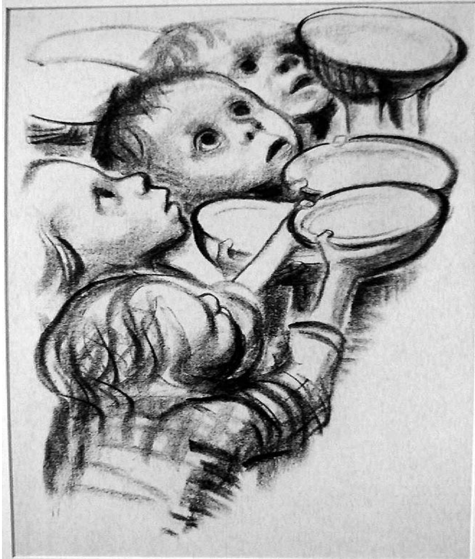
Figure 12: Germany's Children are Starving , 1924, lithograph