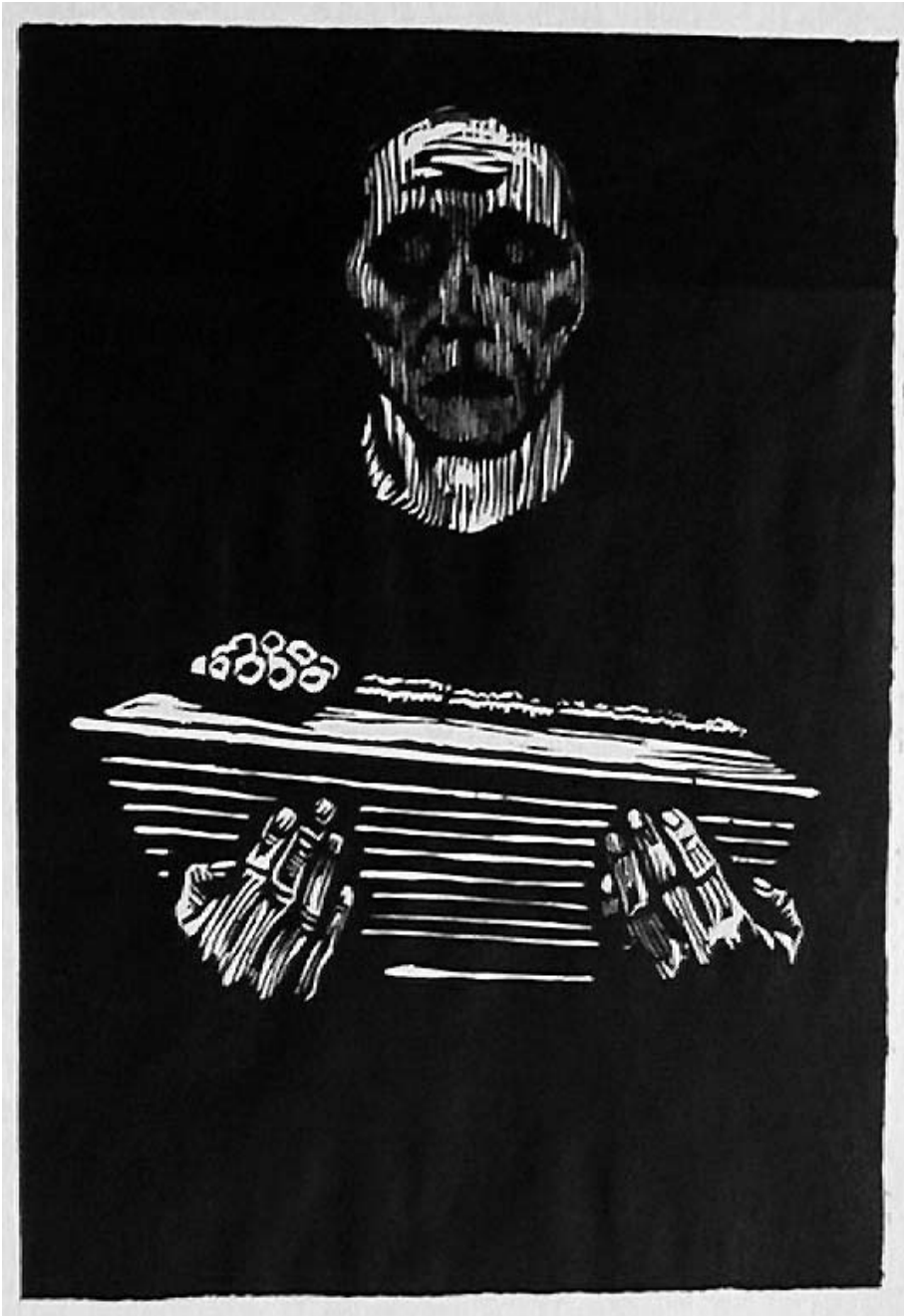
Figure 6: Infant Mortality , 1925, woodcut