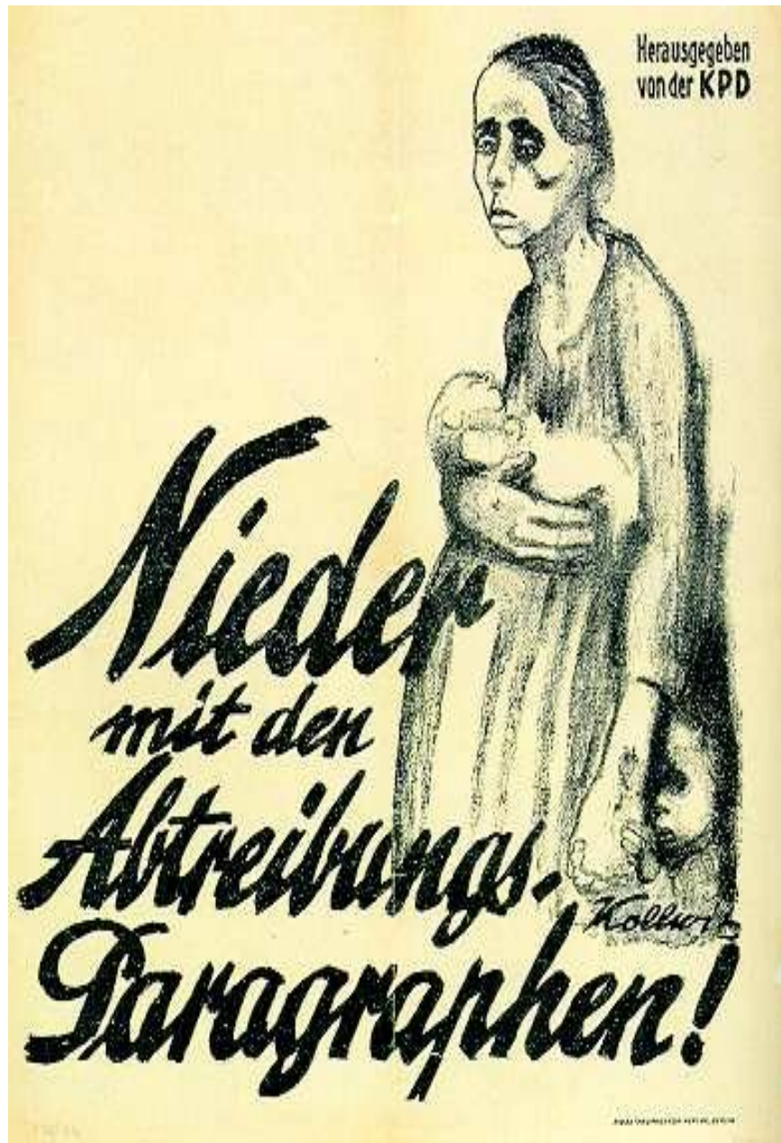
Figure 4: Down with the Abortion Paragraph! , 1924, poster 216