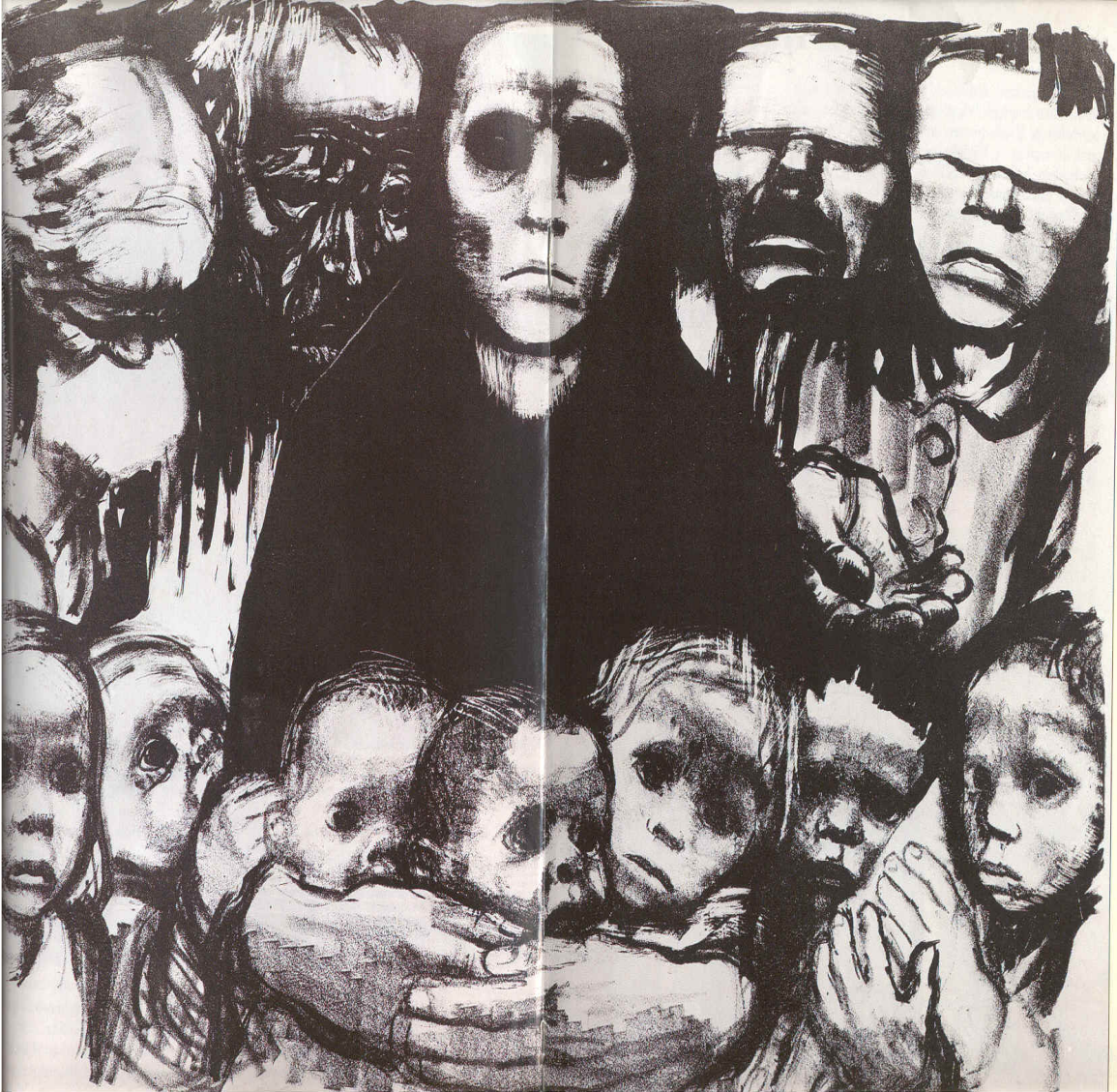
Figure 14: The Survivors , 1923, drawing