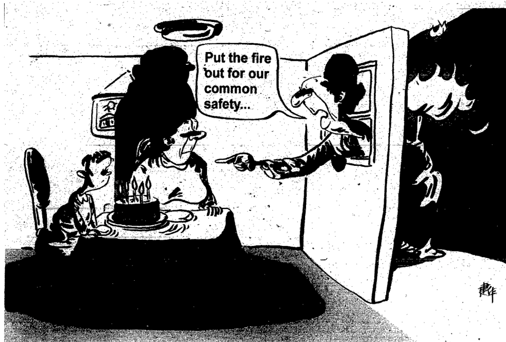
Figure5 “Caricature3,” China Daily , Jan.28, 1999, 4.

These caricatures conveyed opposite messages from the written reports, and such split could bring confusion to readers. For example, on January 22, China Daily published the article, “The Sino- U.S. partnership helps favour common interests,” 60 which showed ample evidences in various fields to persuade audience that the cooperation was benefiting both countries. It cited a statement of an American scholar, Robert Ross, who addressed that “China poses no threat to the United States because it needs a peaceful environment to improve its economy and people’s lives.” 61 Meanwhile, the cartoons showed the unfriendly attitude America held towards China, which was totally opposite to China’s enthusiasm and warm hope, like the “international finance” cartoon we discussed above, which implied that America and Europe controlled the global finance while China was kept out of the financial game. Since the visual components could always be more impressive than written words, China Daily was using such tactics to express its dissatisfaction about America and tried to effectively influence readers.