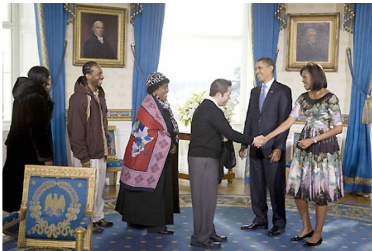
Figure10 “Obama sprints through first full day in office,” China Daily , Jan. 22, 2009, 3.