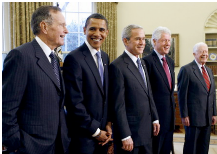
Figure11 “Obama hails 'extraordinary' moment with presidents,” China Daily , Jan. 8, 2009, 3.