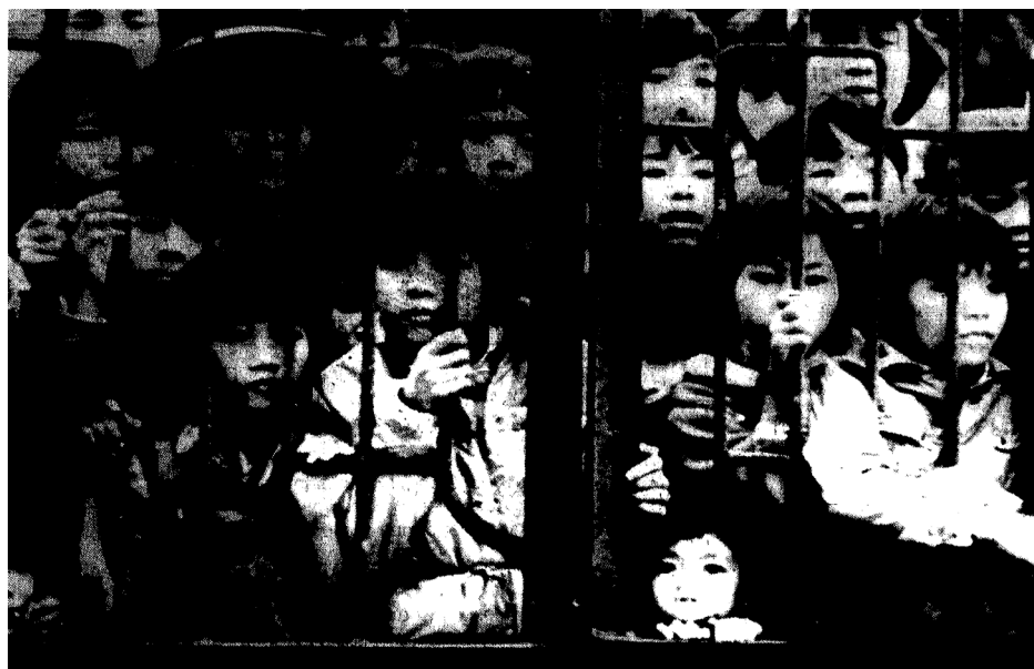
Figure2 “Vietnamese children,” China Daily , Jan. 21, 1989, 8.

unofficial visit to Viet Nam. The ex-marines will try to help local officials search for mines the Americans planted 20 years ago during the war. 31