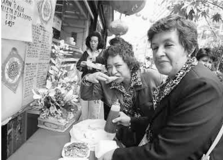
Figure6 “Mexican ladies are enjoying Chinese dim sum in New York,” People’s Daily , Jan.14, 2009, 3.

above people, seemed extremely huge. While the persons under it looked so small. This contrast could imply the viewers to recognize China's power which the dragon represented.