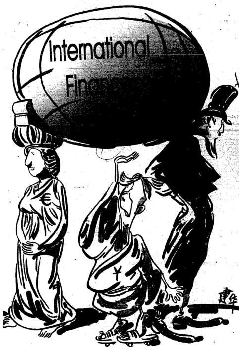
Figure4 “Caricature2,” China Daily , Jan.13, 1999, 4.

Some caricatures even implied the political and military conflict between America and China. For instance, in figure5, 59 a little boy, standing for China, was lightening candles on his birthday cake with his mother in their home. A strong man, standing for America, with upper body probing into the house from the window, yelled to the boy: “Put the fire out for our common safety!” But when the man pointed his finger to the boy, audience could see he was holding a big firebrand in another hand hiding behind his back. This cartoon referred to America’s interference in China’s internal affairs without noticing its own bigger problems.