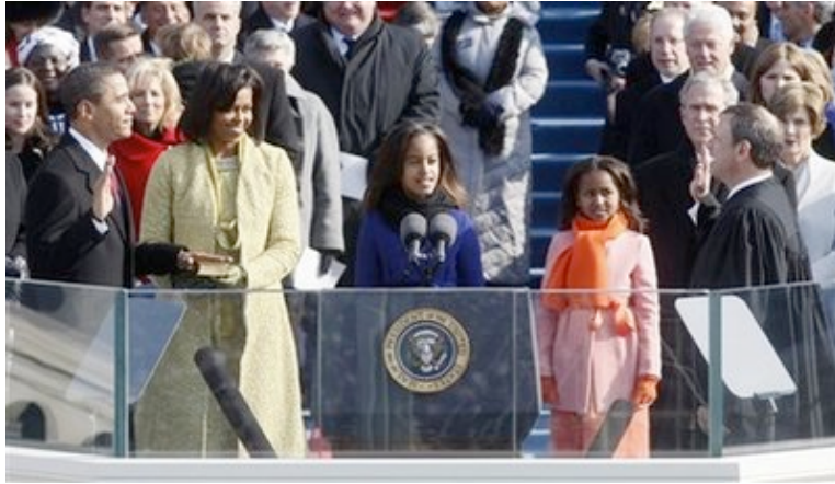
Figure9 “Obama takes presidential oath again after stumble,” China Daily , Jan. 22, 2009, 3.