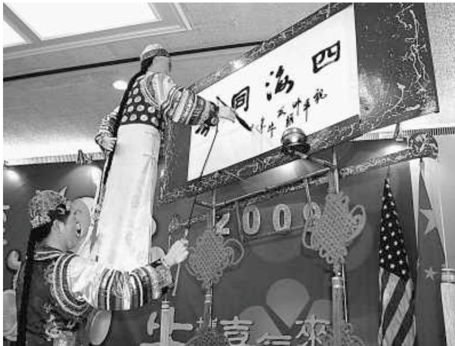
Figure7 “The whole world is celebrating Chinese New Year,” People’s Daily , Jan.18, 2009, 3.