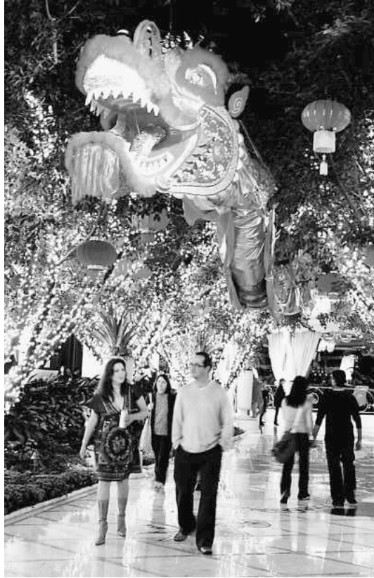
Figure8 “Chinese New Year in Las Vegas,” People’s Daily , Jan. 28, 2009, 3.

In China Daily , most pictures were used in the reports on American new president Obama (See figure9-11). Among the 15 pictures of Obama, 13 of them showed a smiling and amiable portrayal of him. Moreover, all other American politicians who were taken in the pictures, such as Hillary Clinton, Bill Clinton, and Jimmy Carter showed big smiles, presenting a harmonious mood. These pictures represented the editorial policy of China Daily was friendly to Obama.