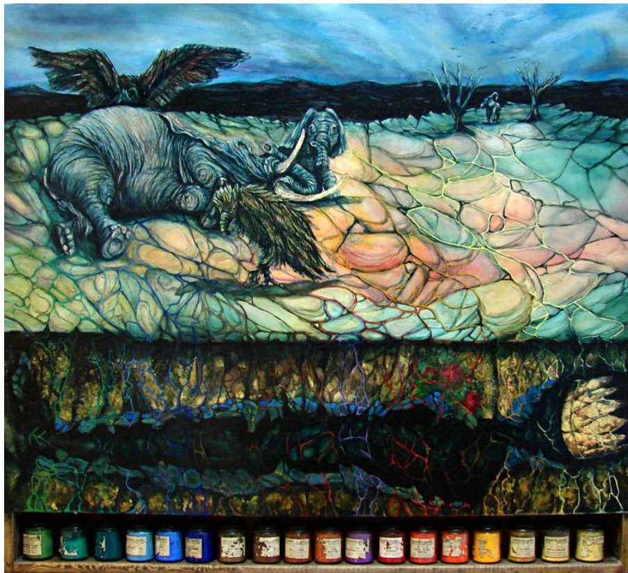
Figure 7 She Is Gone

Above the reliquary are painted pathways for each individual pigment making its way through the gold leaf-covered underworld (suggesting timelessness) to the world above, symbolically connecting all that is buried to all that is alive. The golden underworld encases a hollow space where a great figure has been laid to rest, but all that remains in this cavernous space is a golden crown. The crown cannot be taken into the afterlife but is left as a symbol of a leader here on earth. In the world above we see a literal depiction of the cycle of life. An elephant mother (the most matriarchal of wild animals) lies dead beside her baby as the vultures come to feed, returning the mother's fragile body to the earth once again. The type of visual story telling I utilize in this painting still affects how we understand religion, and more specifically, how we imagine an Apocalyptic Mythos today.