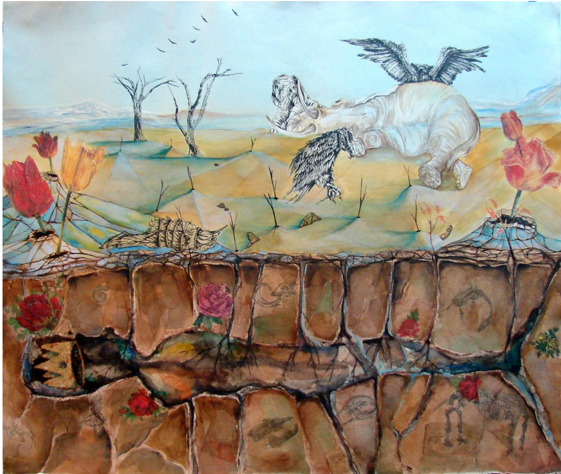
Figure 8 She Is Gone, Mono-print