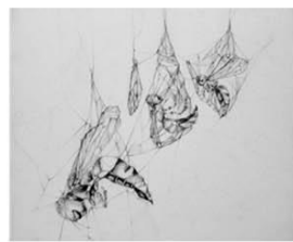
Figure 10 Big Wish