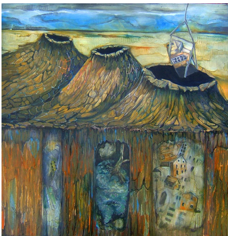
Figure 3 Falkner's Dream

In the next painting from The Future Apocalypse series, “Faulkner’s Dream,” influenced by the works of William Faulkner, remnants of civilization are organized in alien holes in the cracked and desolate landscape.