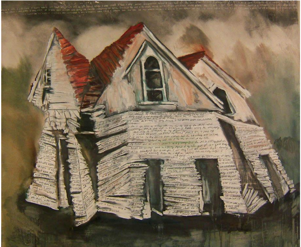
Figure 9 The Confessional