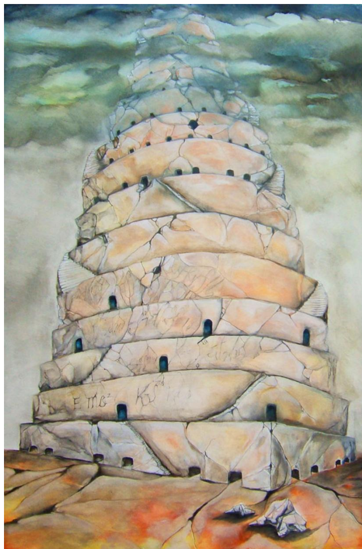
Figure 1 The Tower Of Babel

In my painting of “The Tower of Babel”, I use a triangular composition, which causes the tower to reach into the heavens in an upward, thrusting gesture. The phallic nature of this composition represents mankind’s hubristic conquests. The tower, however, is imperfect in its construction – it breaks apart as it leans away from the viewer’s perspective and seems as if it may topple over at any moment. The flesh tones of the palette represent the body. The surface of the tower is encrypted with the mathematical notations that describe Einstein’s discovery known as E=mc^2 , which led to science that