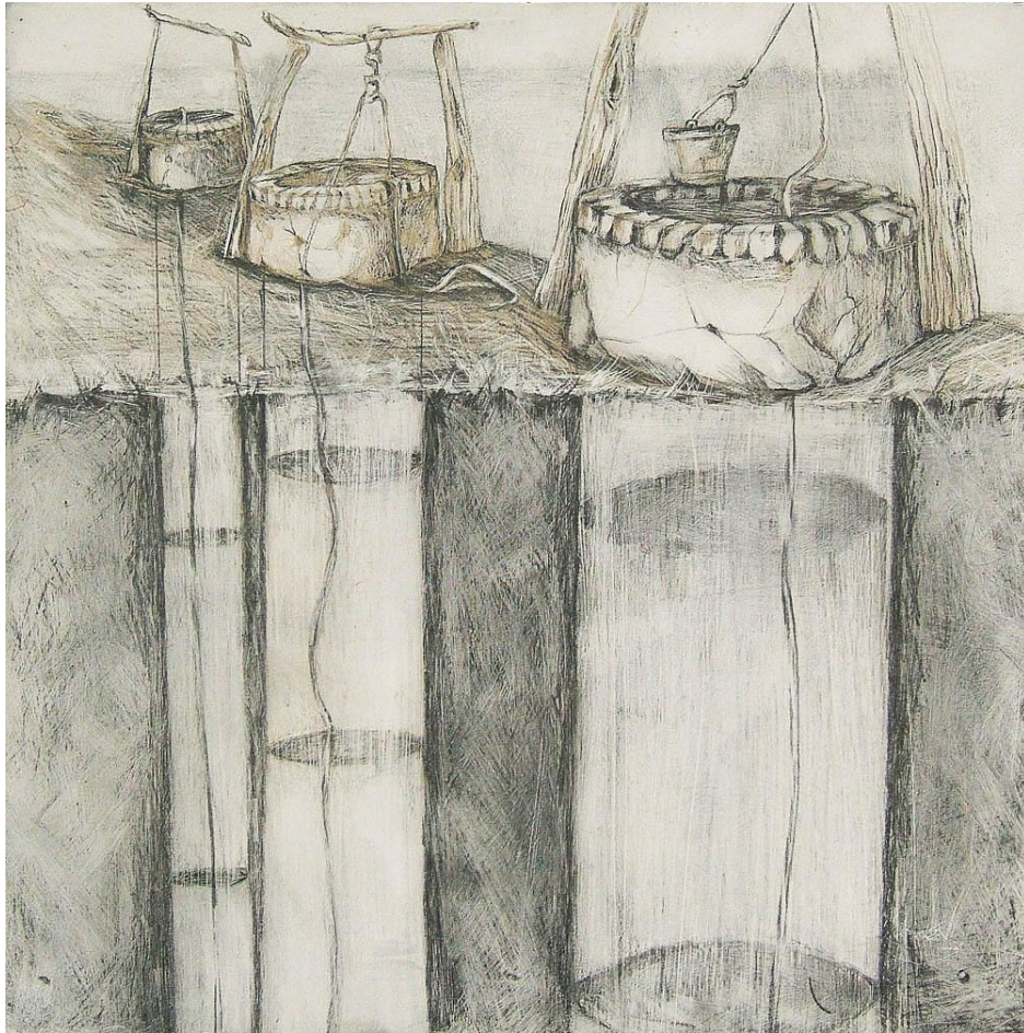
Figure 12 Wishing Wells