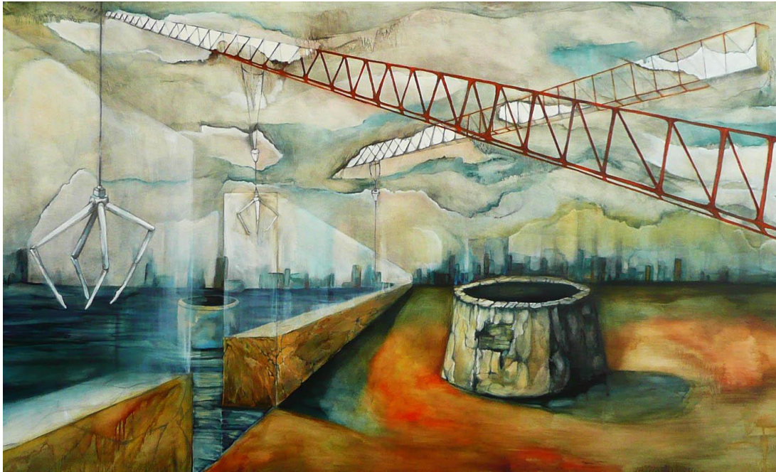
Figure 11 The Water Museum