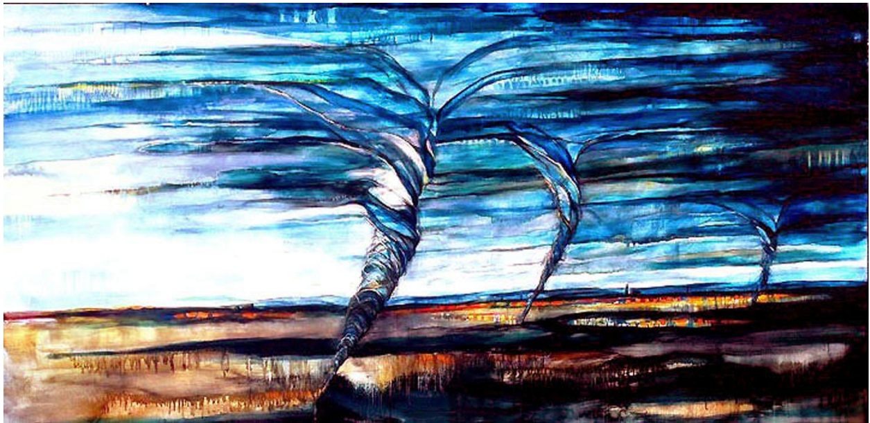
Figure 5 Tornado Landscape

Even before I was conscious of it, the idea of 'Ecological Apocalypse' was present in my works, starting with my Natural Disasters series, which I first presented in a solo exhibition entitled Deluge in 2005. This show consisted largely of works that included depictions of tornados and flooded landscapes.