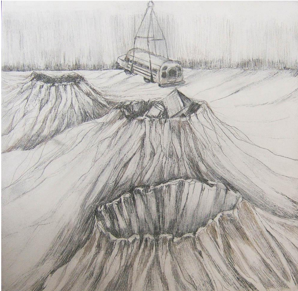
Figure 14 Dropped