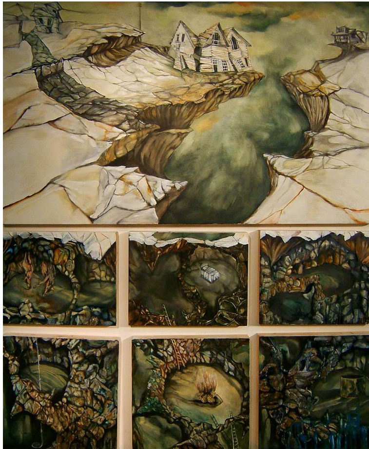
Figure 4 Plato's End

for communion and a place for storytelling where myth is born. In the cave above the fire circle is a single bed, a metaphor for dreaming. To the left of the bed hang hogs (Swine), a symbol of the inevitable sins of humanity. In the cave beneath hangs a white cord that offers an escape route for the redeemed. To the right of the cave with the bed, sits an empty cave and beneath is a cave with a leaking well, representing the deficiency of our ingenuity.