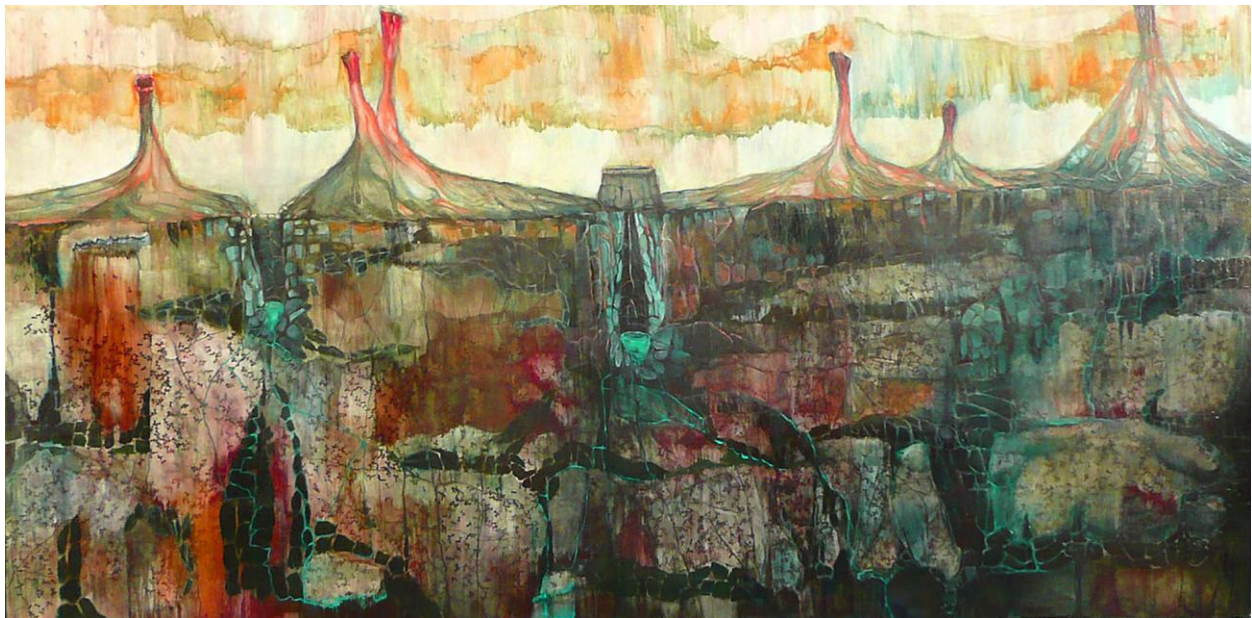
Figure 2 Beyond 1984

The impending apocalypse seems to be culturally ingrained in our psychology and informed by the myths of the past. Mythoi are born predominantly out of a fear of death and influence humanity's vision of the future. George Orwell writes, "Myths which are believed in tend to become true." 1 This sentiment influenced the first painting of my 'The Future Apocalypse' series, "Beyond 1984."