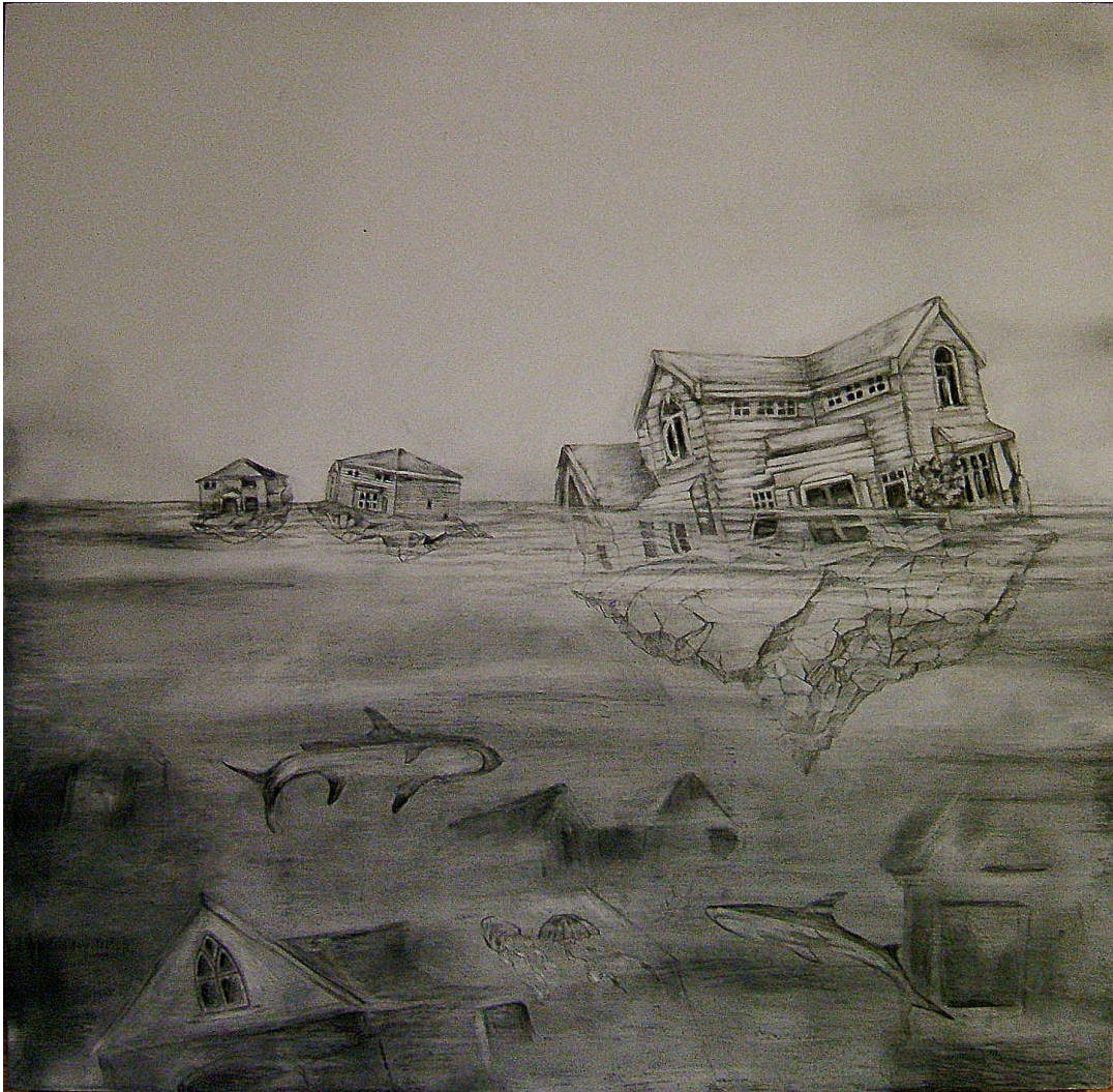
Figure 13 The Last Tipping