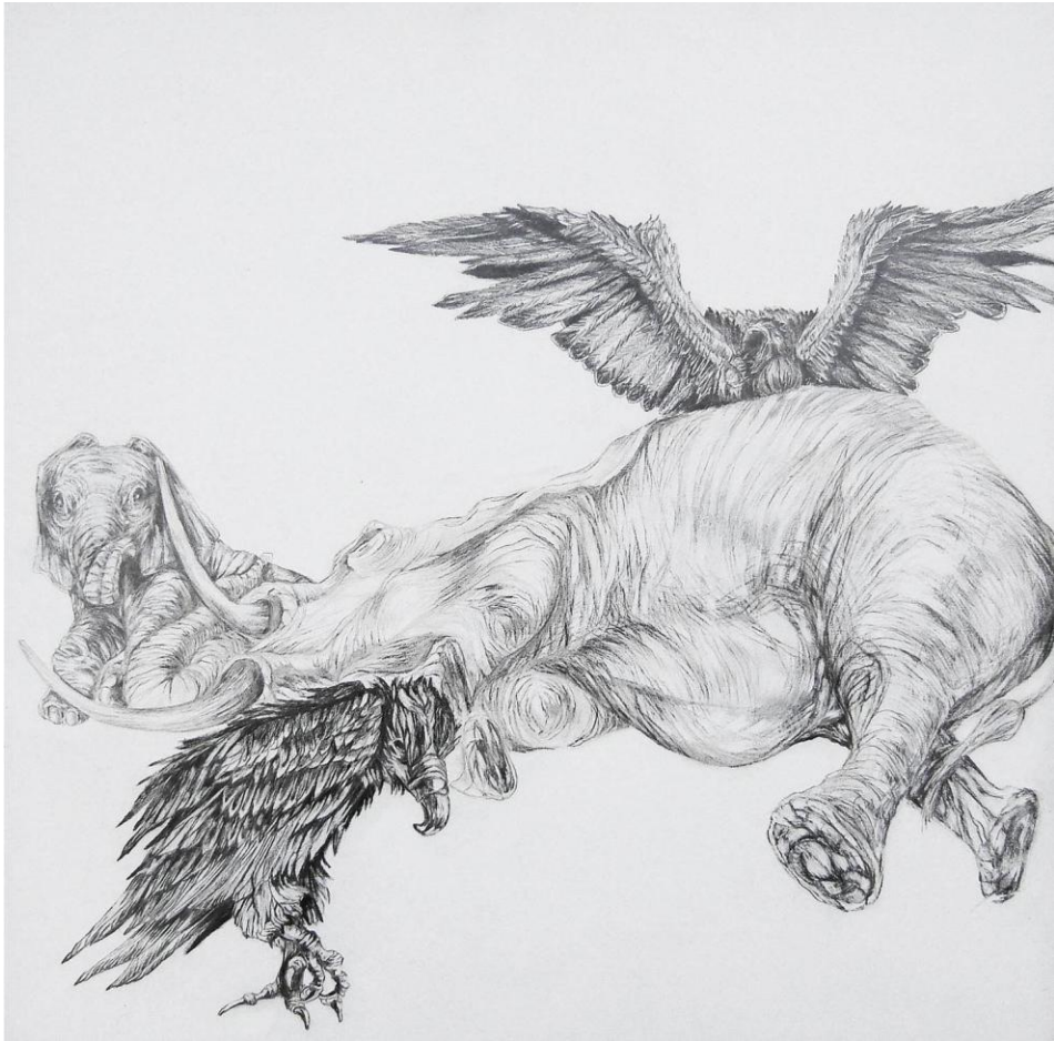
Figure 15 She Is Gone, Silver-point