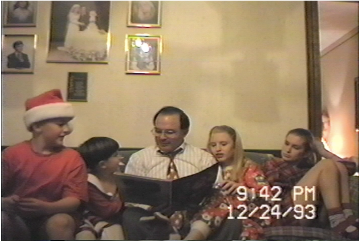
Figure 2: Film Still 2 – From JAMES III: The Night Before Christmas