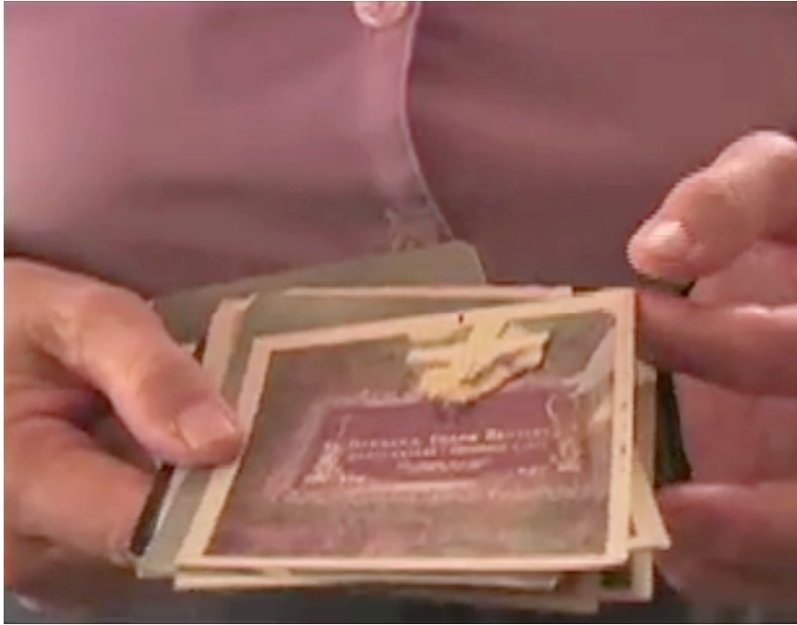
Figure 1: Film Still 1 – From Keeping Barbara : Grandma Holding Barbara’s Grave Photograph

Although in the process of creating Looking Back time is spent converting analog family records into digital copies, therefore preserving what memory remains from them, the larger concern is the inevitable reality that we all eventually will be entirely forgotten to time (Figure 1). Furthermore, the work exposes an inherited trait of collecting family documentation and my personal struggle to analyze the extensive amount that exists.