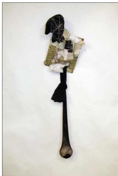
Figure 2 Baseball , 2009, Mixed

I think of the fabric sculptures as loose portraits or archives. In constructing them, I began recalling my own memories and stories others had shared with me, mixing parts of the two together and forming a new version of the original events. Next, I compiled objects and clothes that seemed to fit with the new portrait and its new story. I cut up the clothing into small fragments. Then, I joined all of the objects for the portrait with tape, string and glue to form the body of the sculpture. Lastly, I took the clothing fragments and bound each one to cover the majority of the body, now giving the piece its own clothes or skin. Although the materials and clothing of each sculpture were deliberately chosen, the combination was a much more intuitive process.