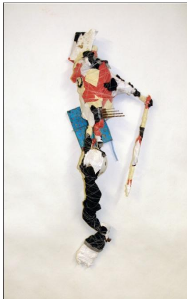
Figure 3 Drill Bits , 2009, Mixed Media

Around this same time, I started experimenting with stacking fabric in an effort to symbolically indicate one's memory of an event and the truth of the event. I began cutting squares and rectangles of the same size and stacking them on top of each other forming 1-3" blocks for each piece. The fabric blocks were derived from outfits that were at one point in time worn together (jeans, tee-shirt, cardi-