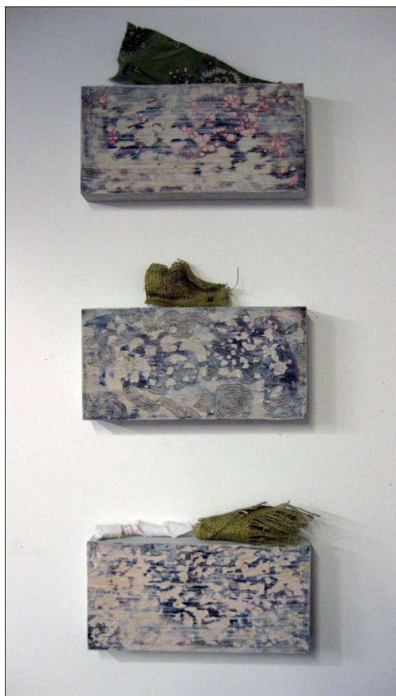
Figure 1 Memory Self-portrait , 2008, Mixed media

with a specific personal memory in mind. The new painting panels represented the actual event, solid and unchanging. I cut up clothing that held sentimental value to me. I dipped the fragments in clear gel medium and placed them on top of each panel like a souvenir on a display shelf. This combination signified my perceived memory of the event, malleable and metaphysically connected to the original objective happening (the panel). These early works were concerned with individual memory, and my work continued on this trajectory into Cultural Memory.