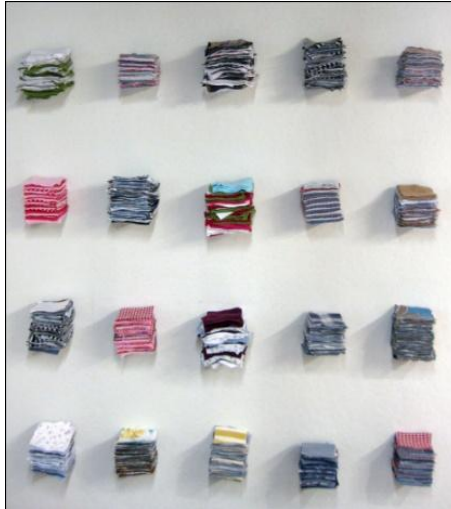
Figure 7 Matriarch , 2011, Fabric stack installation