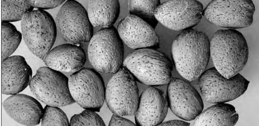
Hard-shell almond nuts, more favourable to maintain kernel quality.

ages in the market es very close to althese continuous