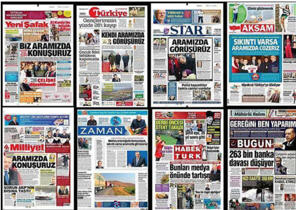
Six pro-government newspapers on November 9, 2013, feature headlines saying "We will solve it amongst ourselves."

The same thing happened in early June when seven papers ran headlines with an identical quote from the prime minister on his return from North Africa during the Gezi protests: "I would give my life for the demands of democracy," he declared, suggesting that like his hero Adnan Menderes, the prime minister hanged by the military in 1960, he was willing to martyr himself for the cause of democracy. 45