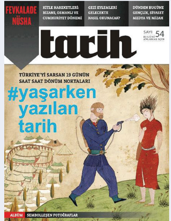
Cover of the censored edition of NTV Tarih . Reproduced by permission of the publisher.