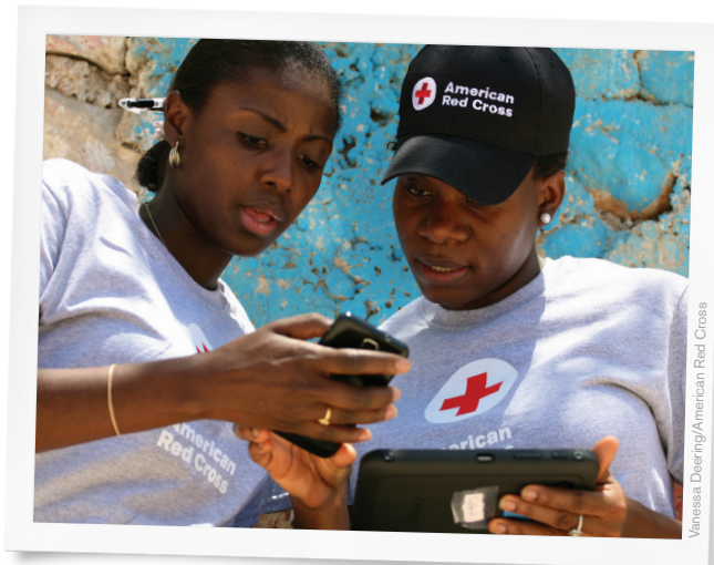
The American Red Cross continues to broaden its use of technology in Haiti, using tools such as GPS-enabled smartphones to collect and analyze information.

The American Red Cross would like to thank the many individuals, corporations, foundations and government agencies that so generously support our work in Haiti. Your contributions are making a difference in the lives of almost 4.4 million people in Haiti that we have reached since the earthquake. We are committed to spending your donations wisely to help the Haitian people recover, rebuild and be better prepared for the future.