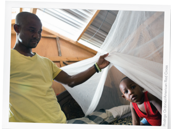
Rodrigo, Ordenez/American Red Cross

Recognizing that some people do not have access to primary health care systems, the American Red Cross and its partners bring lifesaving health interventions directly into communities. From mass vaccination campaigns, mosquito net distributions, and cholera prevention to hygiene promotion, first aid trainings and mobile clinics, the American Red Cross has helped more than 665,000 people through community-based health services, including more than 300,000 people who have benefited from HIV education services. Almost 3.2 million people have benefited from cholera education and vaccinations. Because cholera is transmitted through water and poor sanitary conditions, the American Red Cross has also spent and committed $49 million on projects that have helped provide more than 556,000 people with increased access to clean water and sanitation. Today, we continue to support essential sanitation services in many camp sites throughout Port-au-Prince.